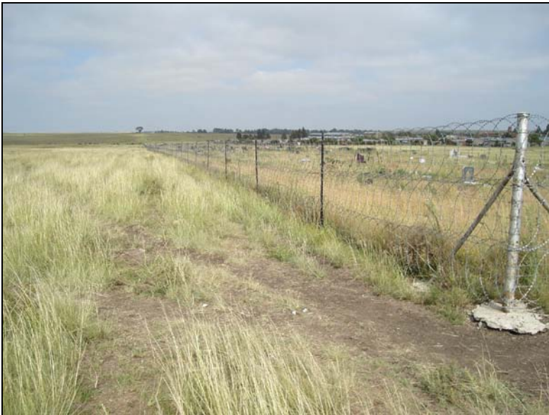
Fig.10 The cemetery at Mamafubedu, Petrus Steyn.