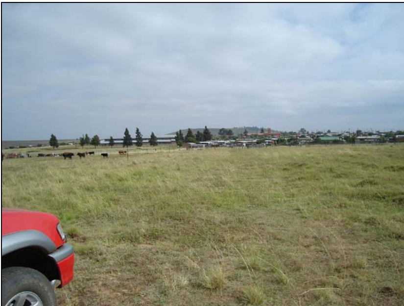
Fig.6 View from point E.