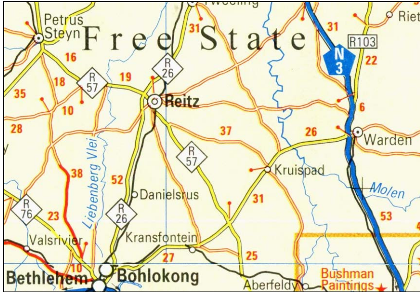
Map 1 The town of Petrus Steyn in relation to Bethlehem, Reitz and Warden.