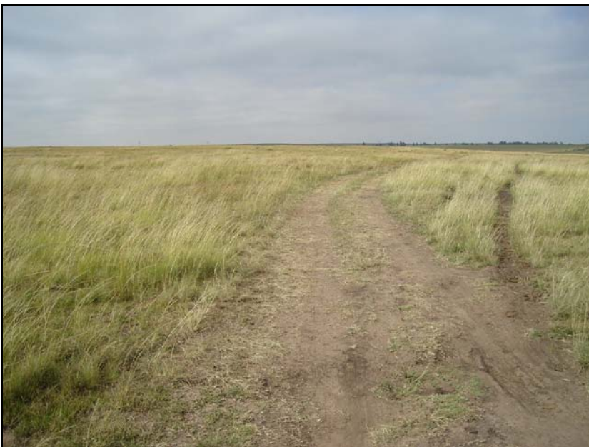
Fig.2 View across the proposed site of development at Point B.