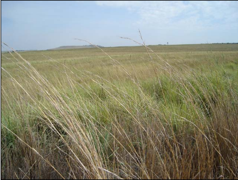
Fig.3 View from point C.