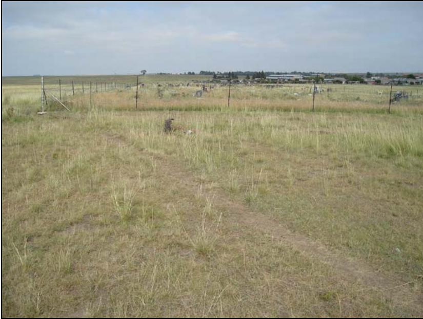
Fig.1 View across the proposed site of development at Point B. Cemetery in foreground.