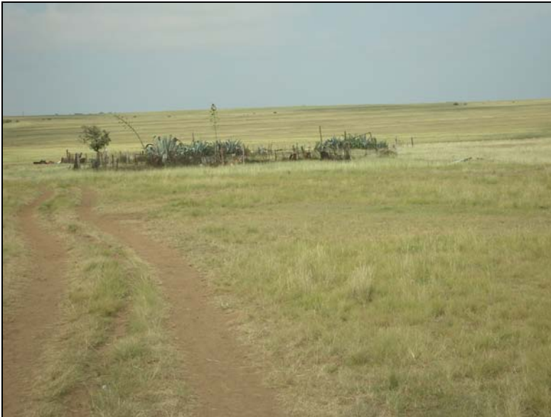
Fig.8 There are several stock enclosures in the area.