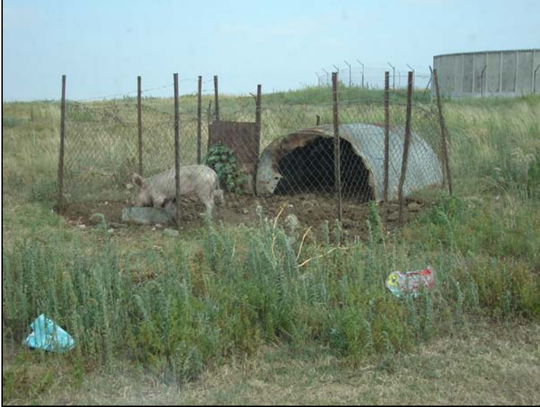
Fig.9 Cattle and small stock are kept by the inmates of the township.