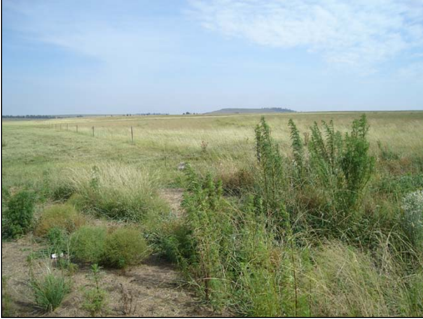
Fig.5 View from point D.