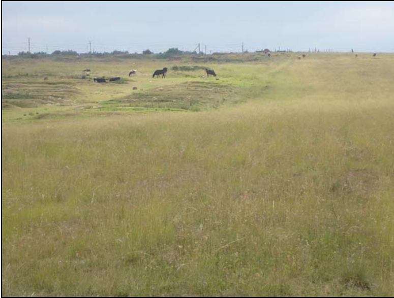
Fig.7 The remains of old sewer dams.