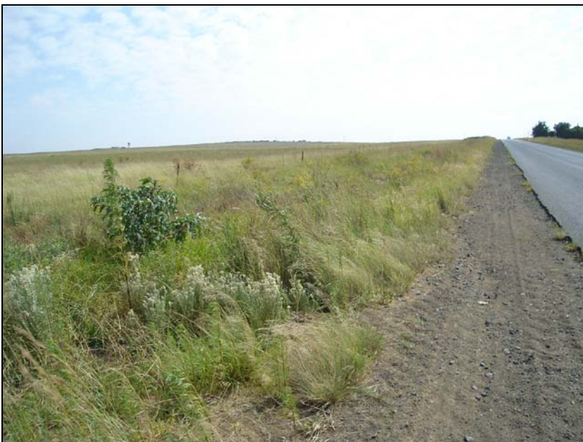
Fig.4 View from point D along the R707 road to Lindley.