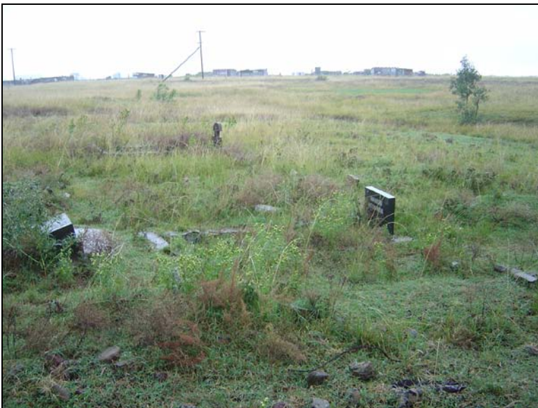
Fig.2 Grave yard at Port Arlington 114, Arlington.