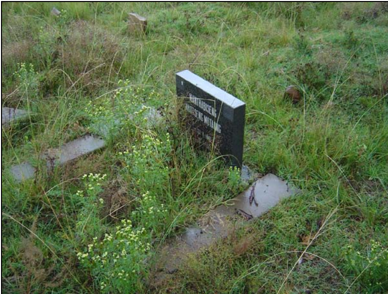
Fig.3 Grave at Port Arlington 114, Arlington.