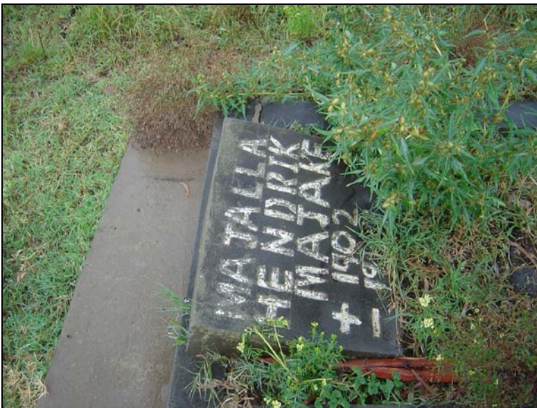
Fig.4 Another grave at Port Arlington 114.