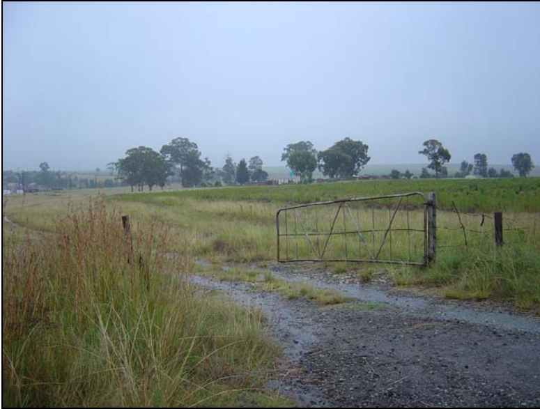
Fig.1 Entrance to the proposed area of residential development on Port Arlington114.