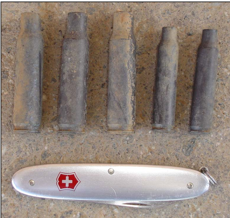
Fig.11 Fired cartridge shells from the rifle range. From left 7,62 R1 rifle, 1970 & 1979, and ,223 1986 & 1988.