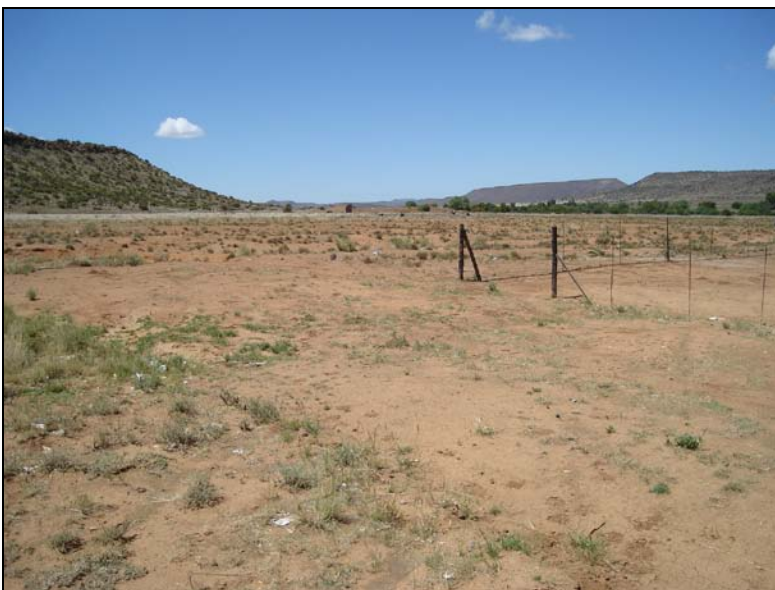
Fig.2 View of the site at Poding-Tse-Rolo facing south.