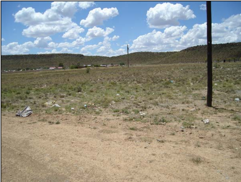
Fig.1 View across the proposed site of development at Poding-Tse-Rolo.