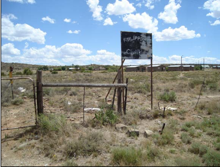
Fig.5 View of the site at Bergmanshoogte from the R717 road to Colesberg.