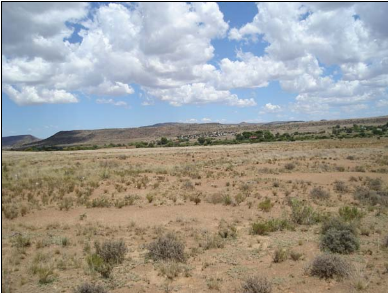
Fig.3 Facing from Poding-Tse-Rolo toward Bergmanshoogte.