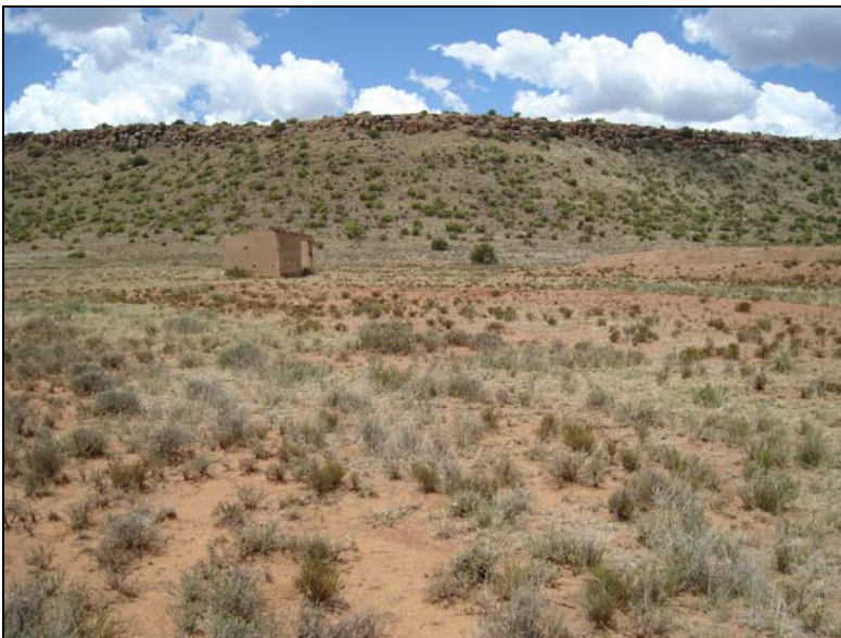
Fig.4 View of the rifle range facing east.