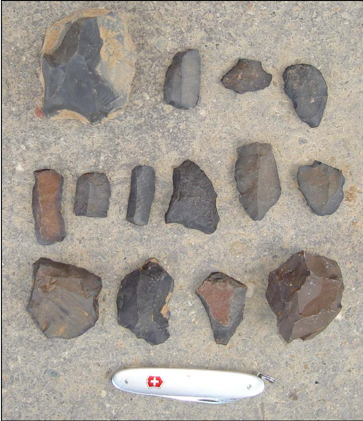
Fig.7 Later Stone Age scrapers and flakes from the dongas near Poding-Tse-Rolo.