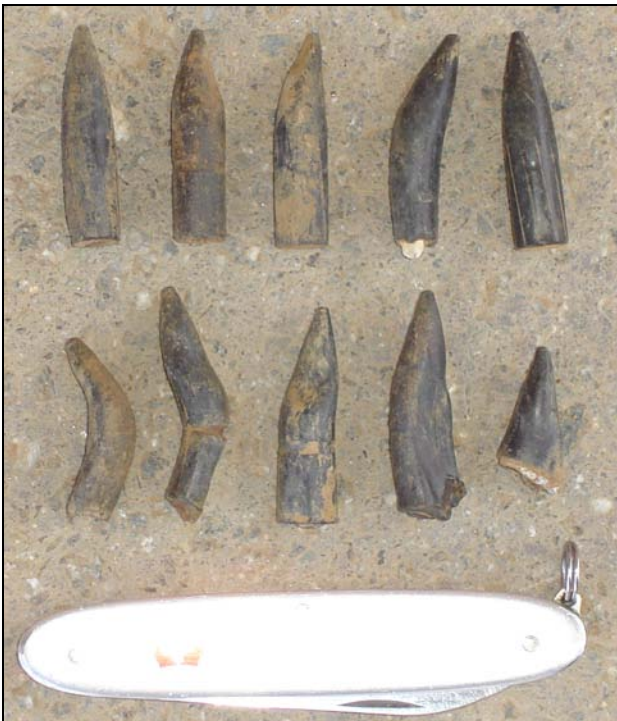
Fig.10 .303 bullets found in the dongas near Poding-Tse-Rolo.