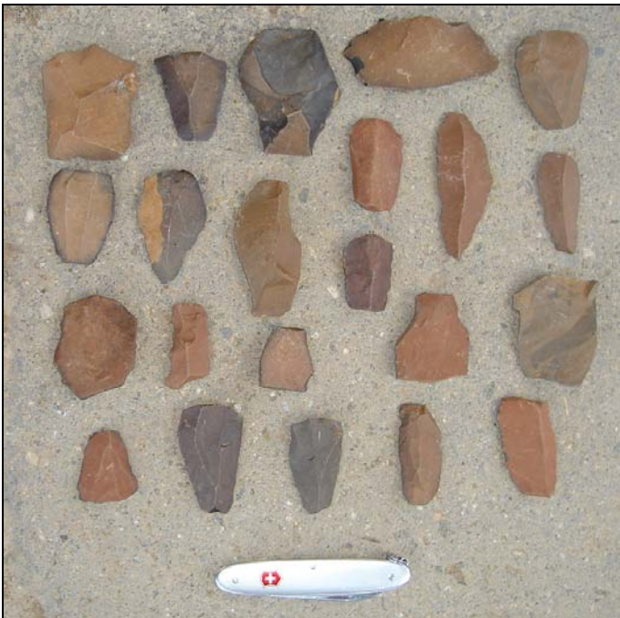
Fig.8 Patinated Later Stone Age tools and flakes from the dongas near Poding-Tse-Rolo.