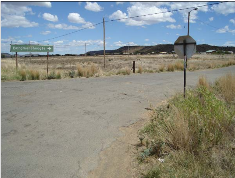
Fig.6 View of the site at Bergmanshoogte facing south.