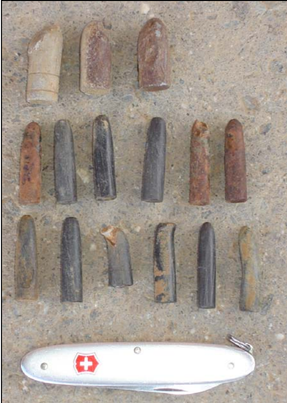
Fig.9 Bullets found in the dongas at Poding-Tse-Rolo. Top row from left: 577/450 Martini-Henry lead bullet and Musket No 1. Second row: ,303 Anglo-Boer War. Third row: ,303 Anglo-Boer War. Bullets 5&6 far right 6,5x55mm Krag Jörgensen, Anglo-Boer War