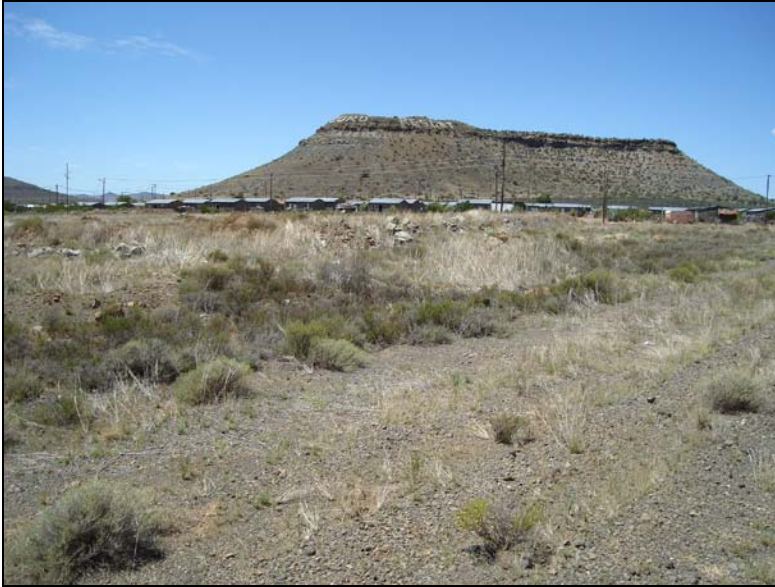
Fig.5 View of the site facing south from point C.