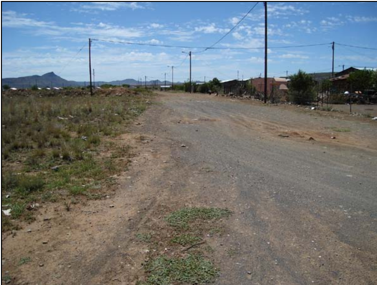
Fig.3 View from point B along the outskirts of Hydro Park.