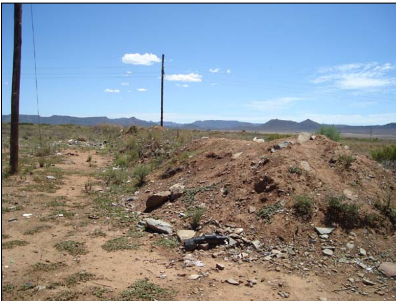
Fig.6 Disturbance of the soil surface during trenching operations.