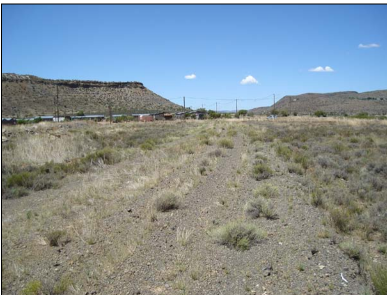
Fig.4 View from point C along the area of development.