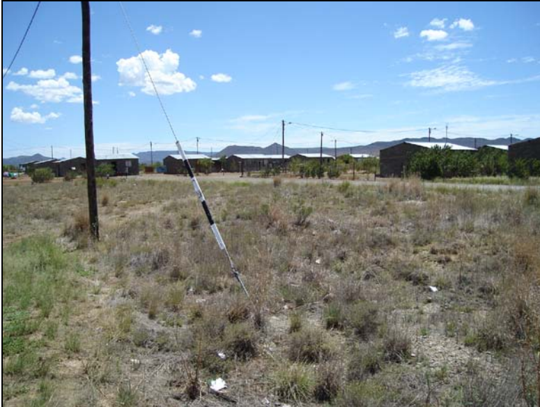
Fig.1 View across the proposed site of development at Hydro Park, Gariep Dam (Point A).