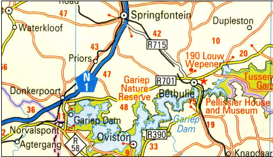
Map 1 Gariep Dam in relation to Bethulie and Springfontein.