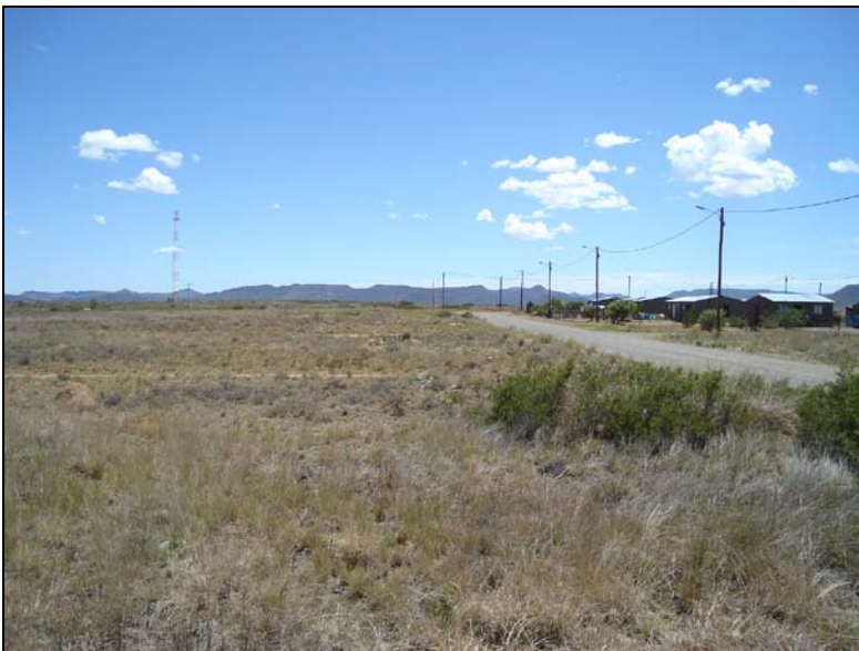
Fig.2 View along the airfield road adjacent to Hydro Park, Gariep Dam.