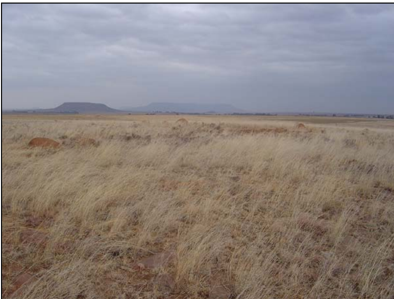
Fig.10 View across BP 12 at Zyferfontein 246 Senekal.