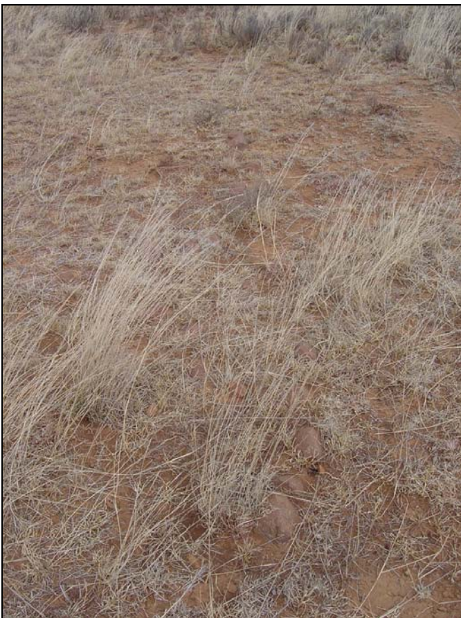
Fig.12 Remains of a stone wall near BP12 on Zyferfontein Senekal.