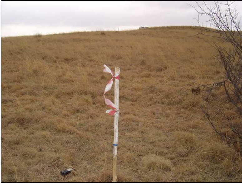
Fig.3 BP 11 on the farm Oriel 1220, Senekal facing north.