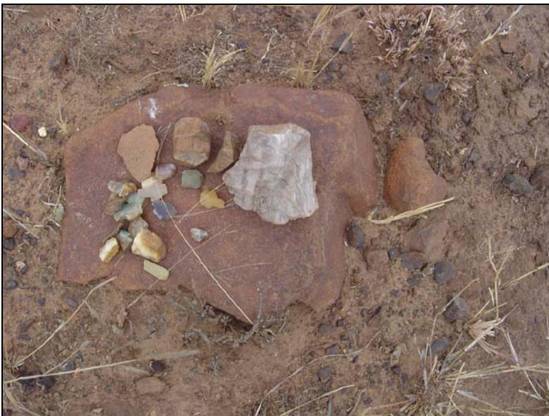
Fig.6 Microlithic scrapers and flakes and Dadoxylon fossils from BP 11 at Oriel 1220, Senekal.