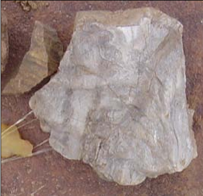
Fig.7 Dadoxylon fossils from BP 11 at Oriel 1220, Senekal