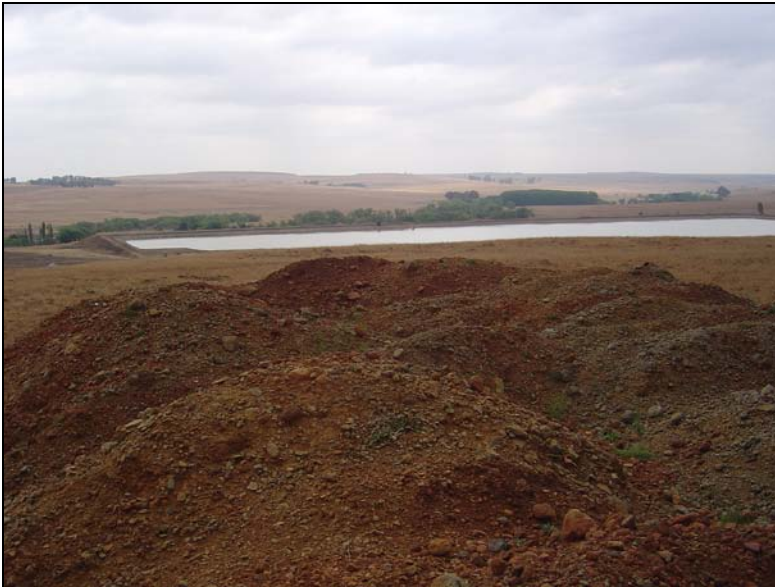
Fig.11 View from BP12 on Zyferfontein Senekal. Cyferfontein Dam at the back.