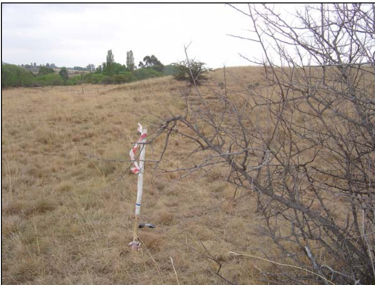
Fig.4 BP 11 on the farm Oriel 1220, Senekal facing west.