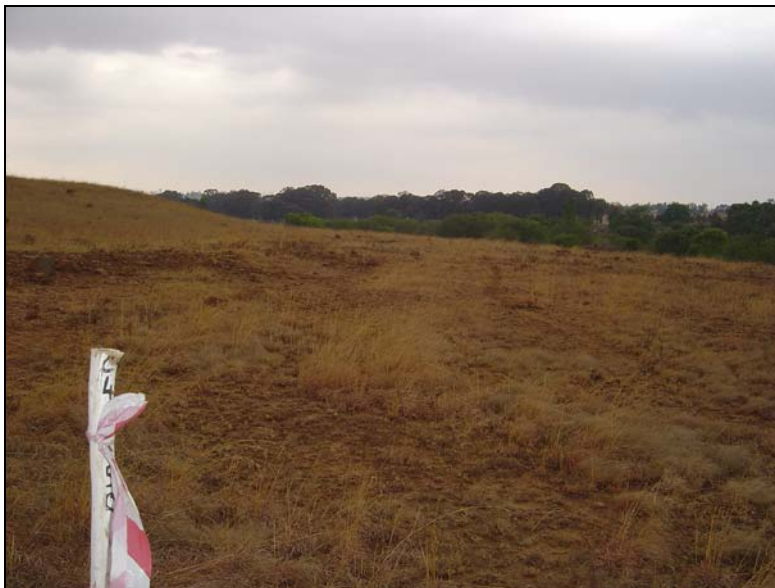
Fig.2 View of the proposed site BP 11 on the farm Oriël 1220, Senekal, facing east.