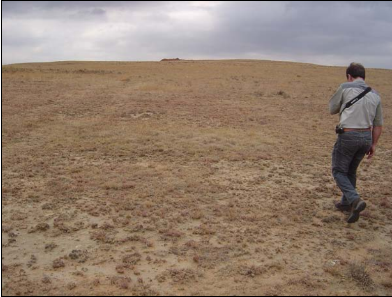
Fig.9 BP 12 at Zyferfontein 246 Senekal.