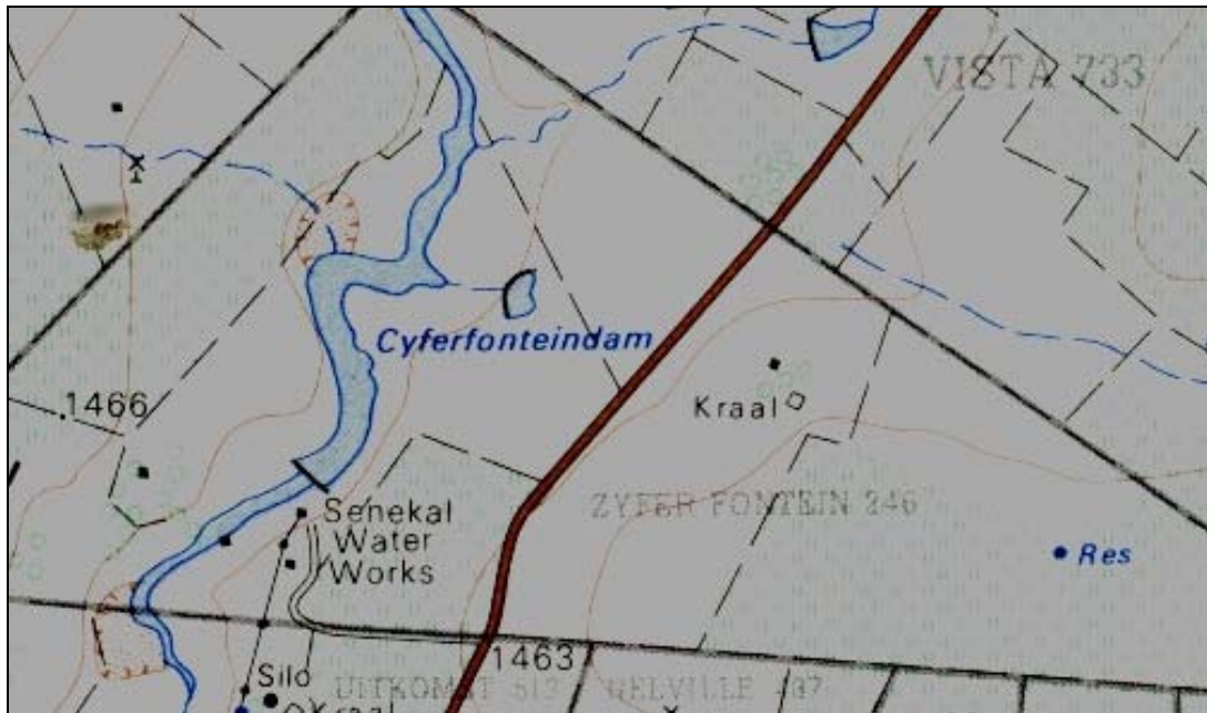
Map 2 Locality of the farm Zyferfontein 246 near Senekal.