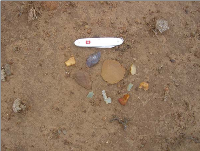
Fig.5 Microlithic scrapers and flakes from BP 11 at Oriel 1220, Senekal.