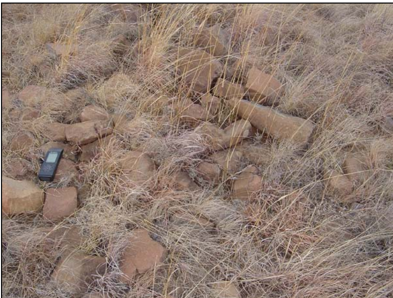
Fig.8 Remains of a stone wall on top of the hill at Oriel 1220, Senekal.