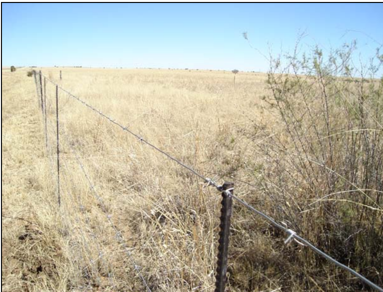
Fig.4 N1 west at 73,2 S km facing south.