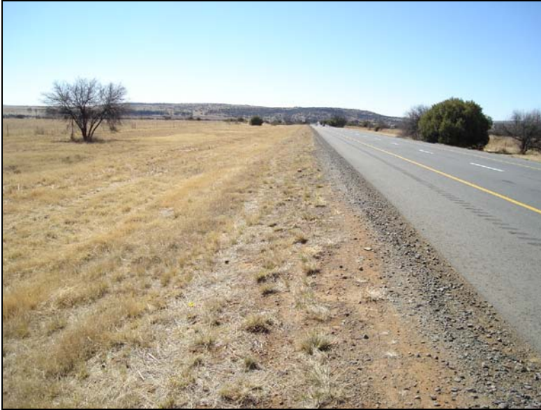
Fig.5 N1 at 73,2 S km outside Winburg facing north.