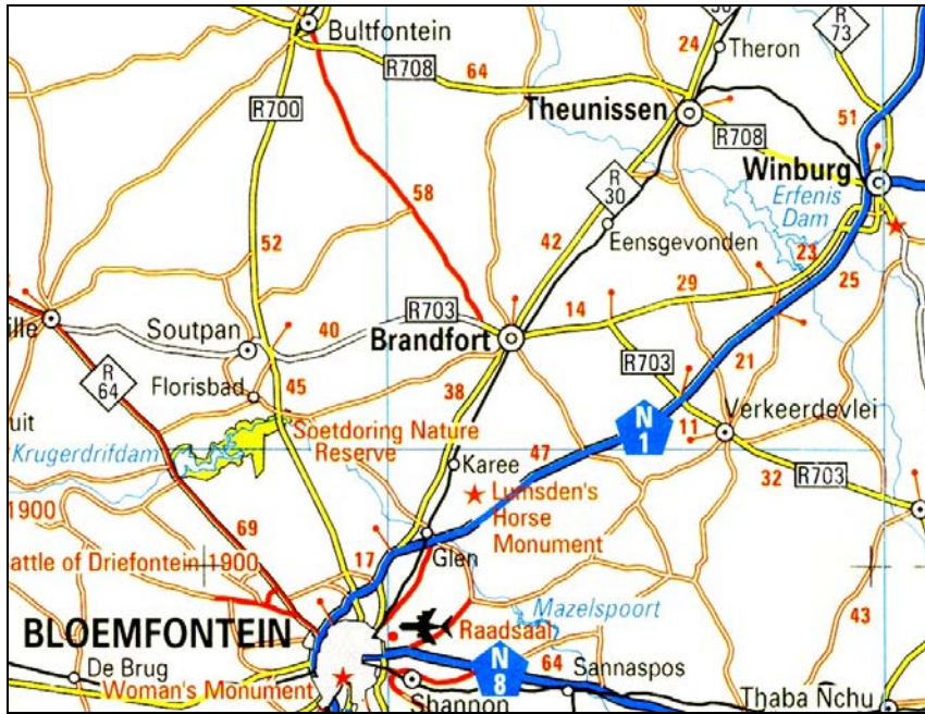
Map 1 Locality of Winburg to the N1 and Bloemfontein.