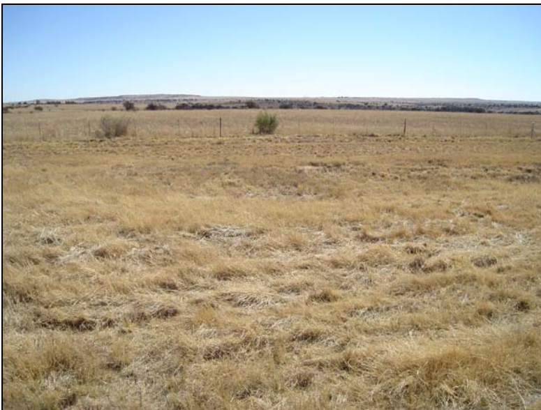
Fig.2 N1 east at 73,2 S km facing east.