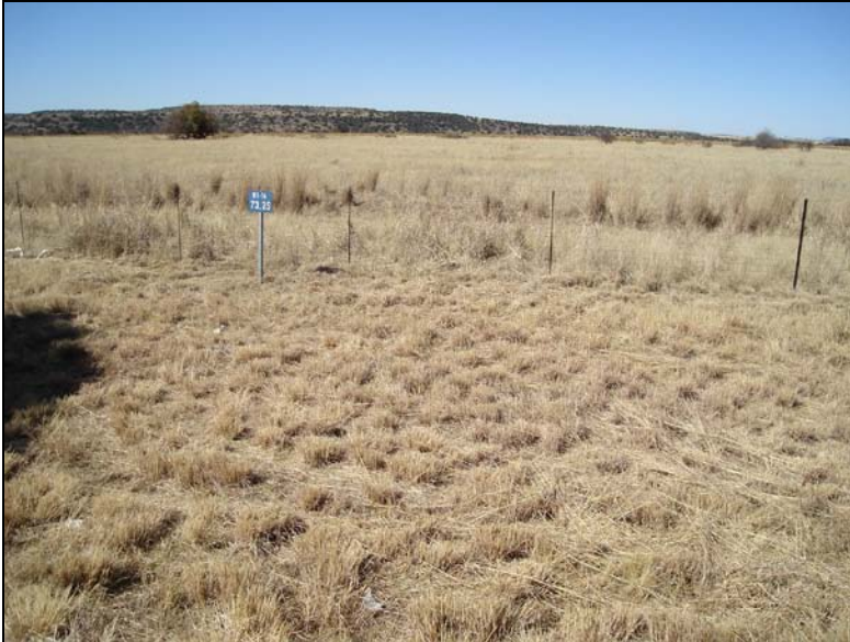
Fig.1 N1 east at 73,2 S km.