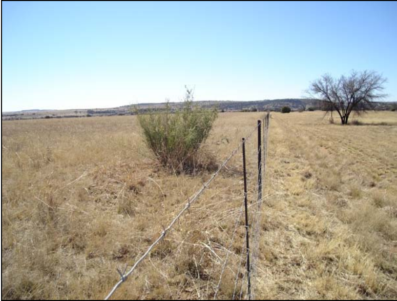
Fig.3 N1 west at 73,2 S km facing north.