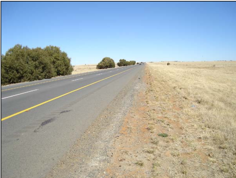
Fig.6 N1 at 73,2 S km outside Winburg facing south.