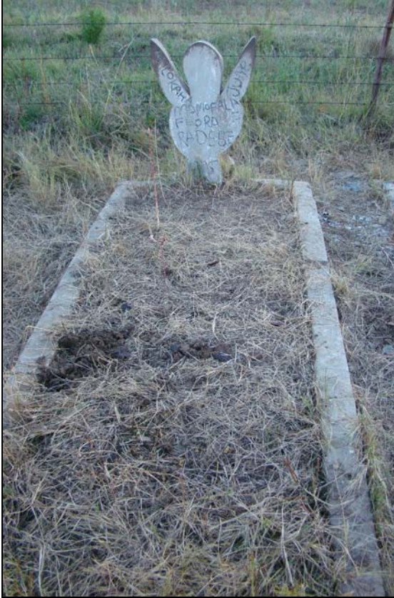
Fig.5 Grave of Mamofala Flora Radebe at Roodekraal 474, Senekal.