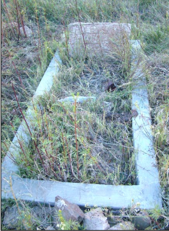
Fig.7 Grave of Thole Radebe at Roodekraal 474, Senekal.