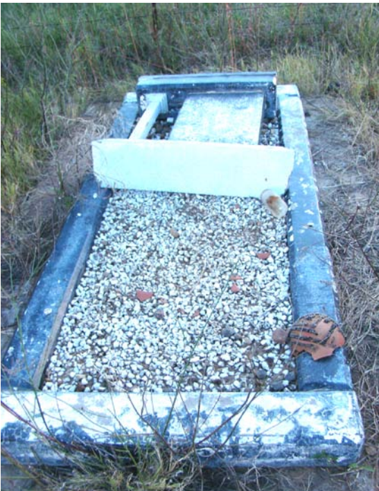
Fig.6 Grave at Roodekraal 474, Senekal.