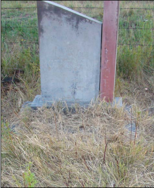
Fig.11 Another headstone of grave at Roodekraal 474, Senekal.