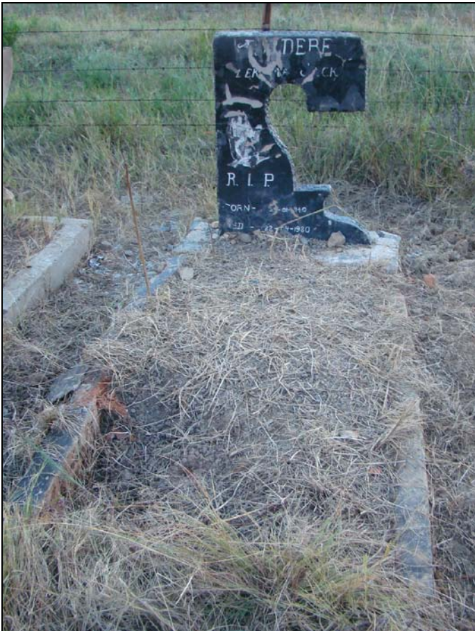
Fig.4 Grave with head stone at Roodekraal 474, Senekal.