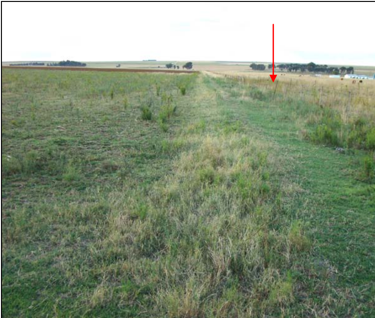
Fig.1 Point A at Roodekraal 474, Senekal facing west. Red arrow indicates position of graves.