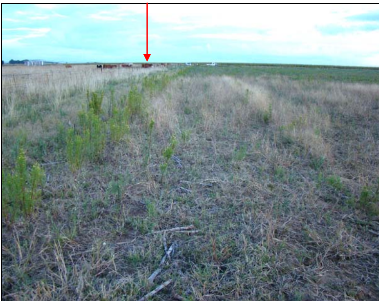
Fig.2 Point B at Roodekraal 474, Senekal facing east. Red arrow indicates position of graves.