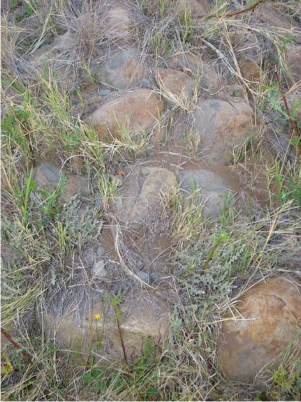
Fig.9 Stone covered grave at Roodekraal 474, Senekal.