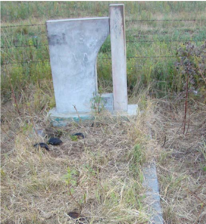
Fig.10 Headstone of grave at Roodekraal 474, Senekal.