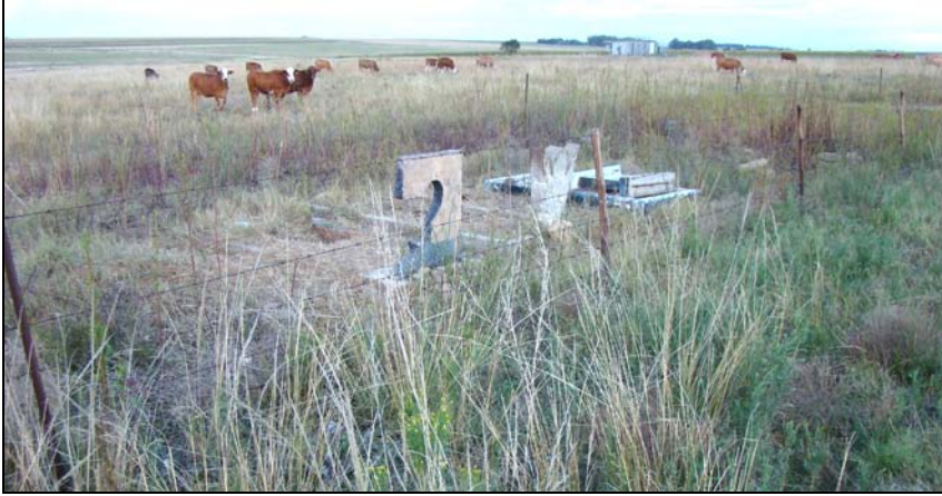
Fig.3 A cemetery containing about 15 graves were found at Roodekraal 474, Senekal.