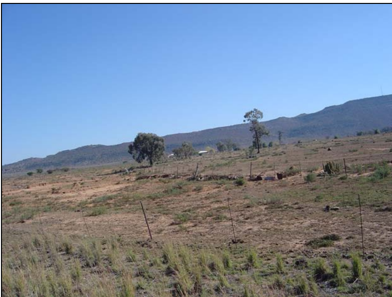
Fig.7 View along the R701 facing in the direction of Bethulie.