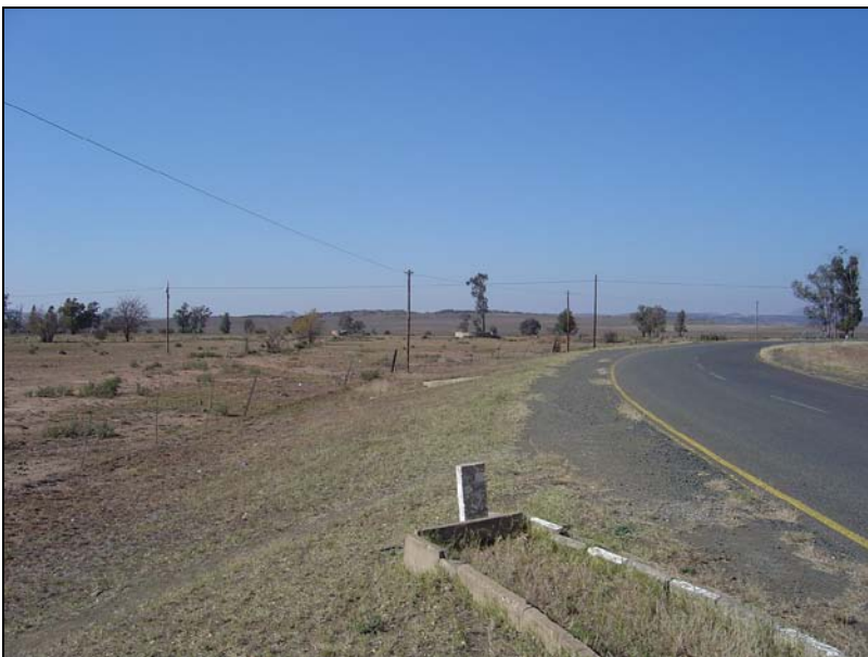
Fig.8 View from the road towards the existing houses in the township.