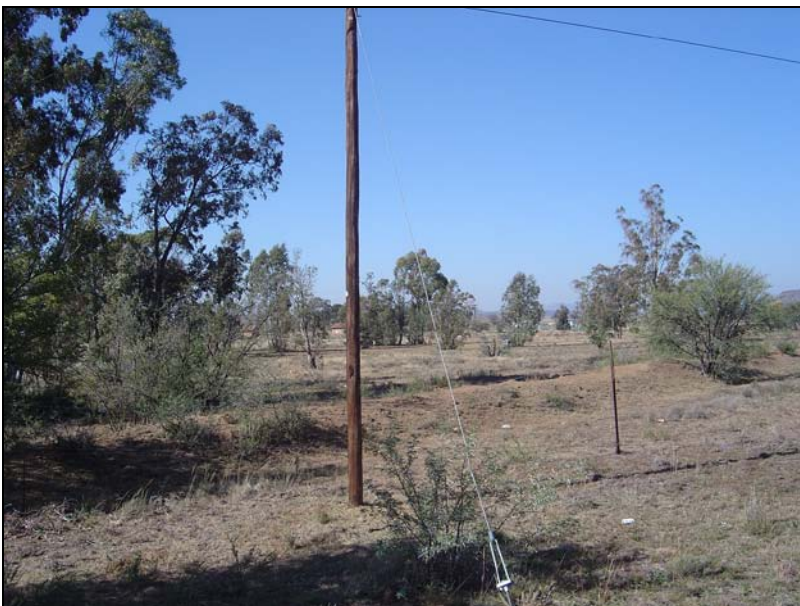
Fig.5 View across the land from the corner of Theunissen & Voortrekker Streets.