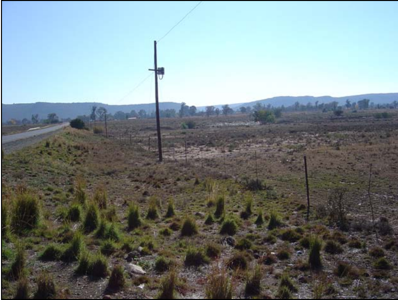
Fig.2 View from the R701 towards town.