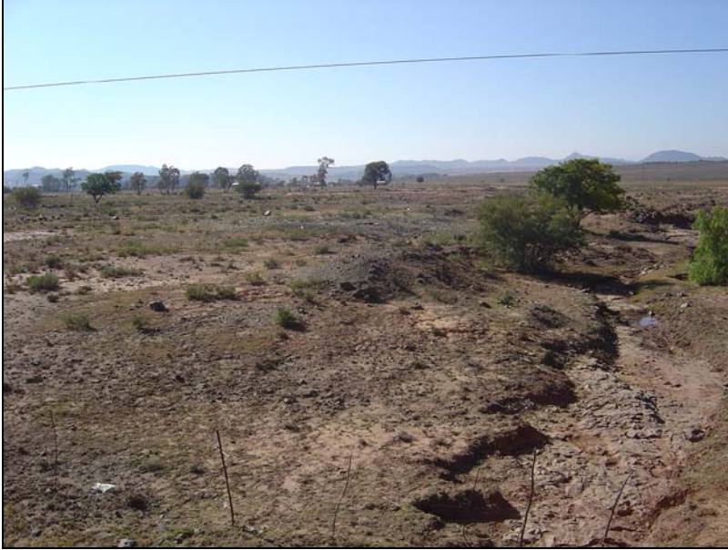
Fig.4 The rough and damaged area along the river.