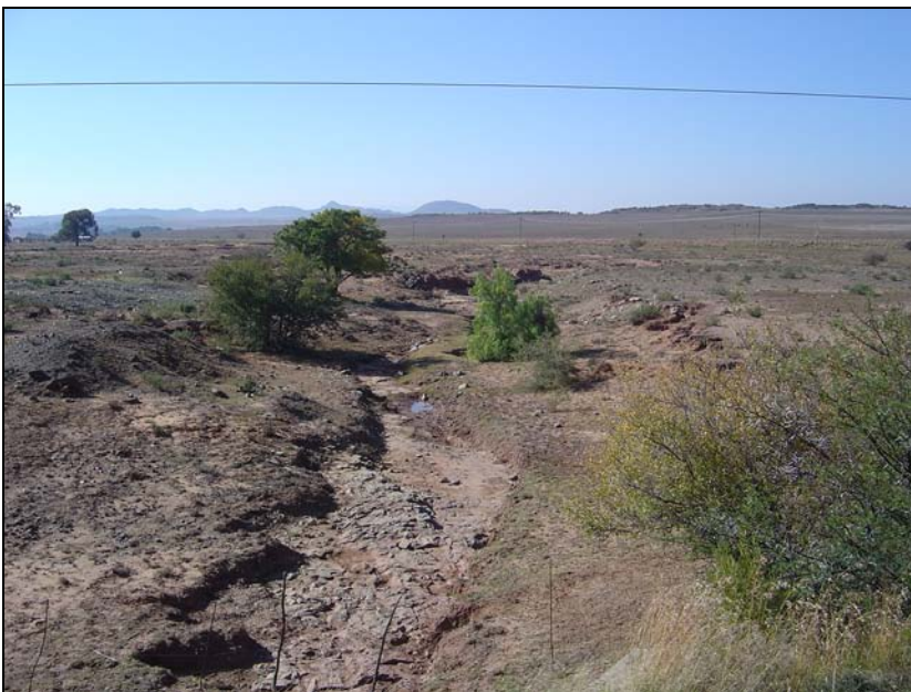
Fig.3 A river runs through the area of development.