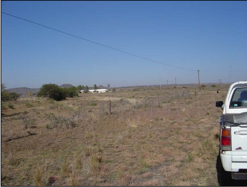
Fig.6 View from the corner of Theunissed & Voortrekker Streets towards the hospital.