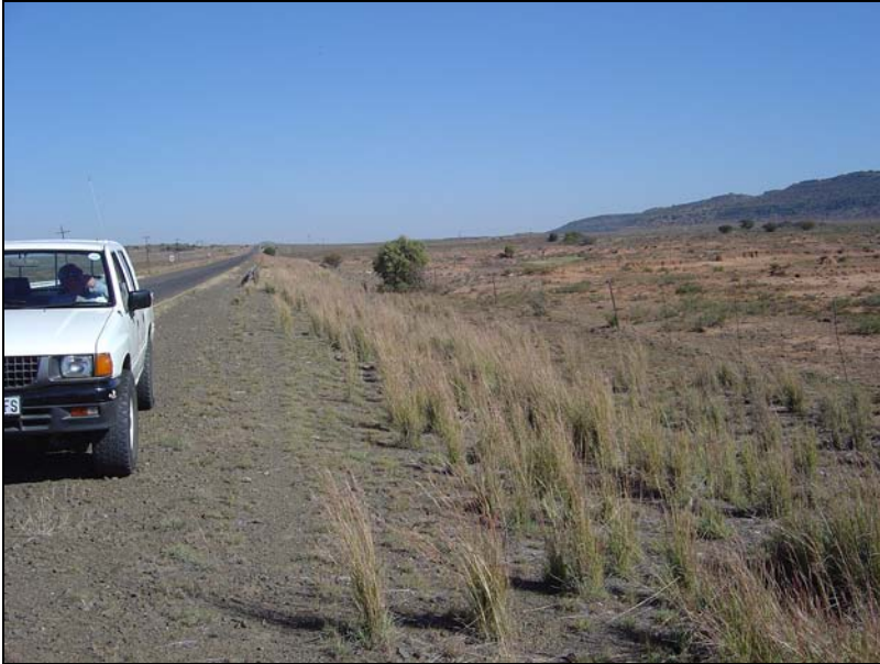
Fig.8 View along the R701 facing back in the direction of Smithfield.