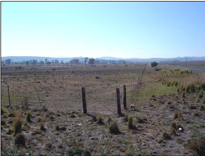
Fig.1 View of the proposed area at the corner between the entrance road to Smithfield from the R701 to Bethulie.