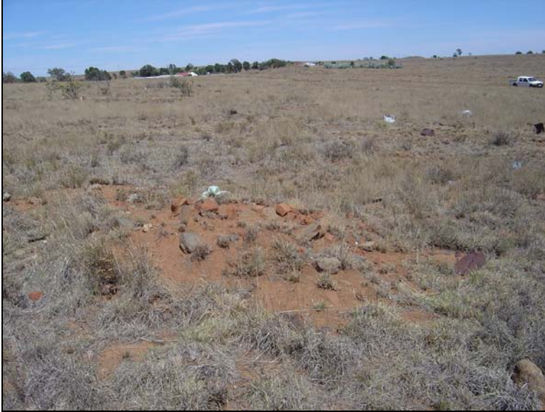
Fig.7 Remains of old houses in the area of development.