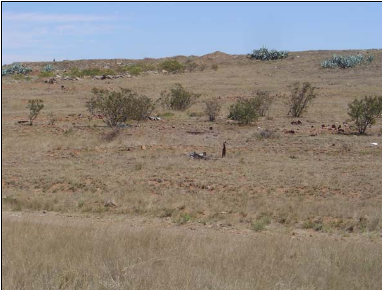
Fig.9 A rubble dump and aloe (garingboom) plants.