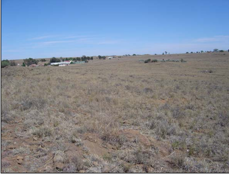
Fig.3 Facing south from the beacon towards the Trompsburg - Philippolis Road.