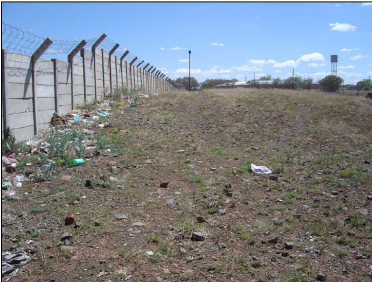
Fig.8 View along the wall of the sport stadium.