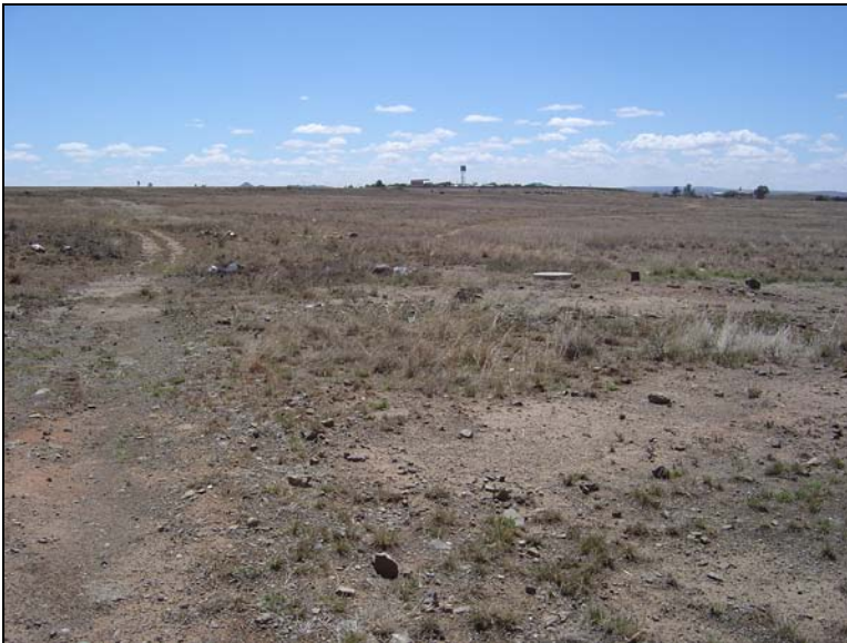
Fig.12 General view of the proposed area from the Philippolis road towards Madikhetla township. Provincial Traffic Department across the road.