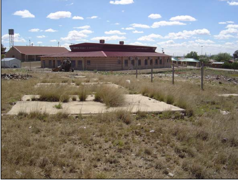
Fig.5 The Community Centre at the entrance to Madikhetla Township.