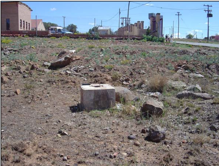
Fig.6 Bore hole near the community centre at the entrance of the township.