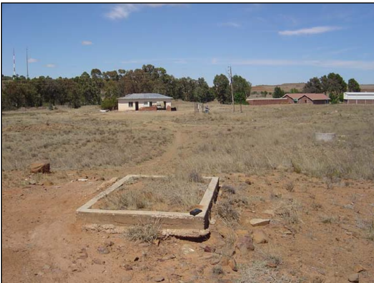
Fig.10 Concrete foundation and old house. Facing towards the Philippolis road