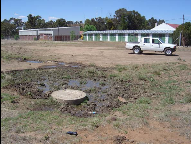
Fig.11 Depot of the Provincial Roads Department. Leaking sewer pipe in the foreground.