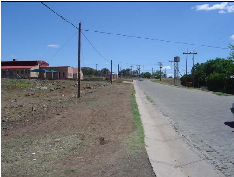
Fig.4 Road into Madikhetla with the Community Centre on the left.