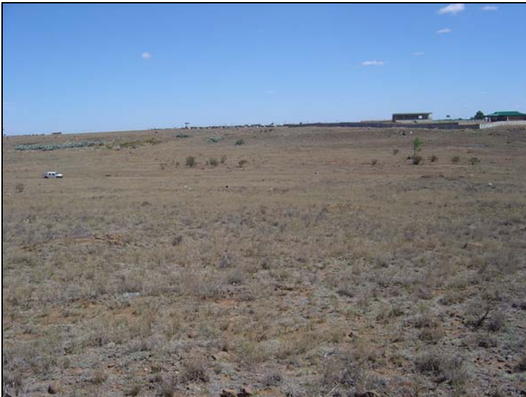
Fig.2 General view from the trig-beacon towards the sport stadium.