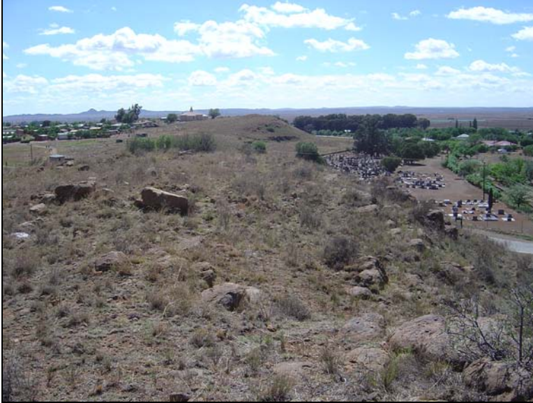
Fig.1 View along the hill facing north. Trompsburg is on the right and Madikhetla lies to the left.