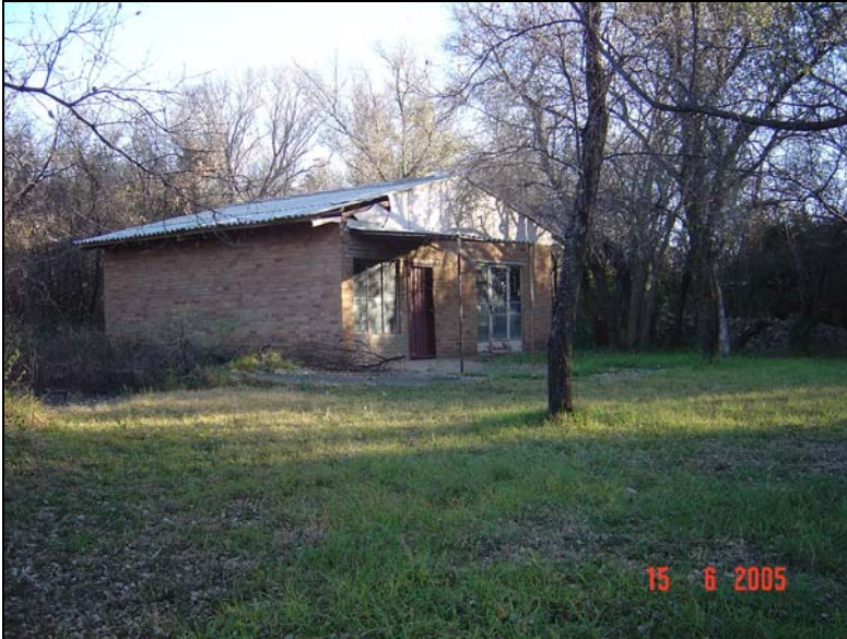
Fig.3 The shop.