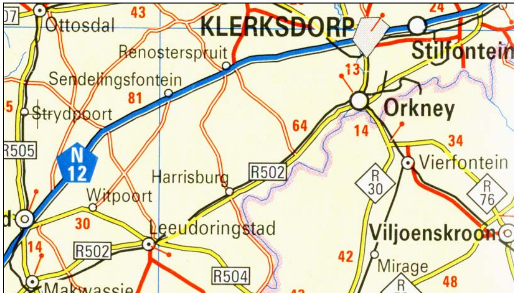
Map1 The locality of Orkney, Vierfontein and Viljoenskroon.