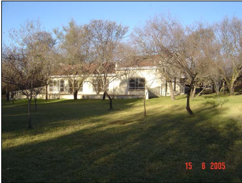
Fig.1 The residential house.