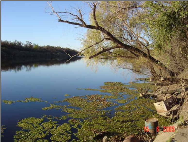
Fig.6 View of the riverfront facing east.