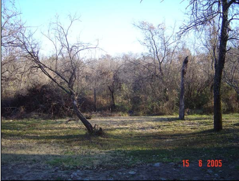
Fig.5 Natural vegetation around the house.