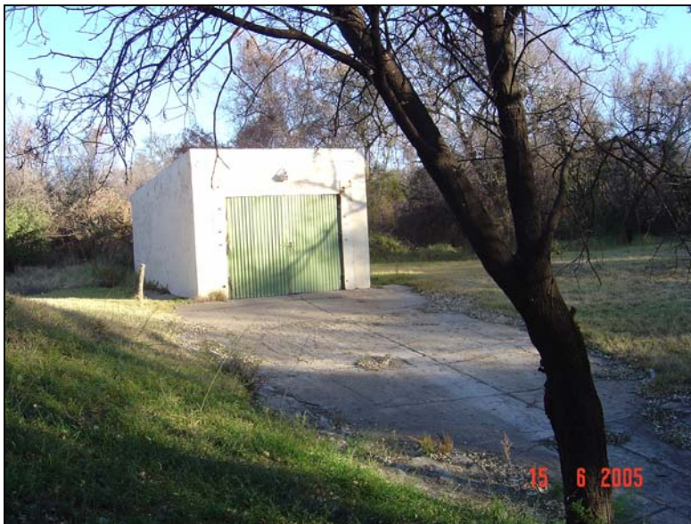
Fig.2 The boat house.