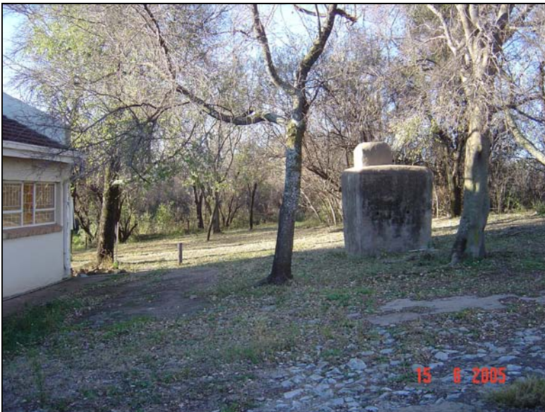
Fig.4 Vegetation behind the house.