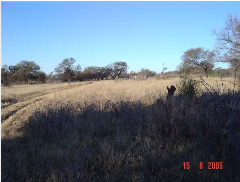
Fig.8 View from the house facing towards the entrance gate.