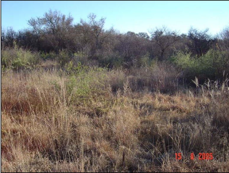
Fig.7 Vegetation away from the river.