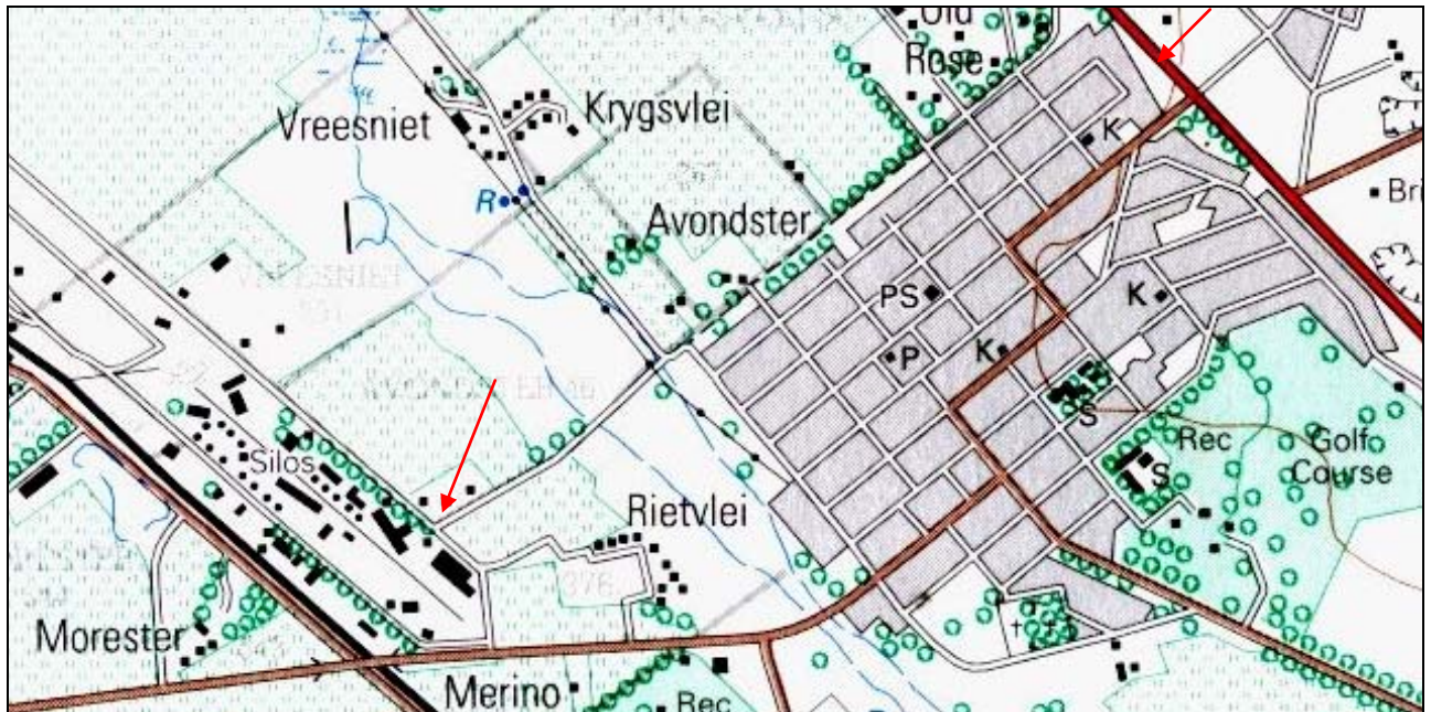
Map 2 The water supply line will enter Viljoenskroon from Rammulotsi Township to the industrial area.