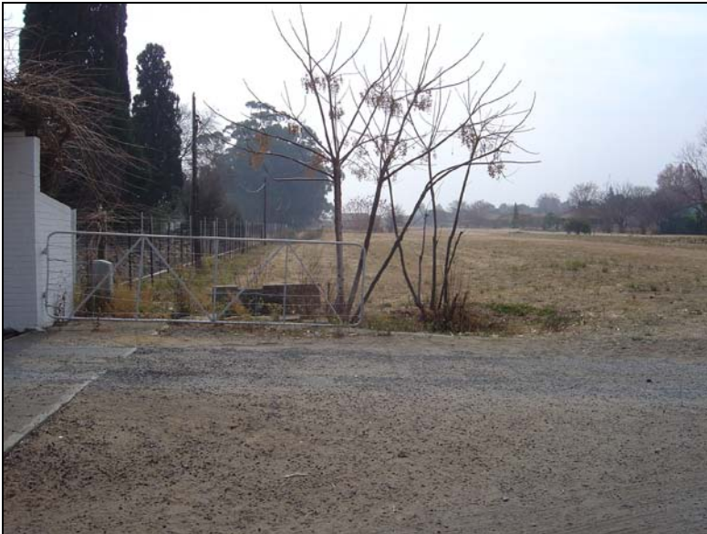
Fig.4 A view along the pipeline route facing northeast.