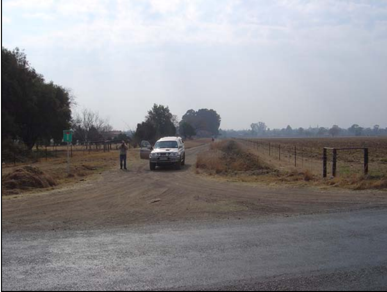
Fig.11 At the intersection of the pipeline with the road through the industrial area facing north.