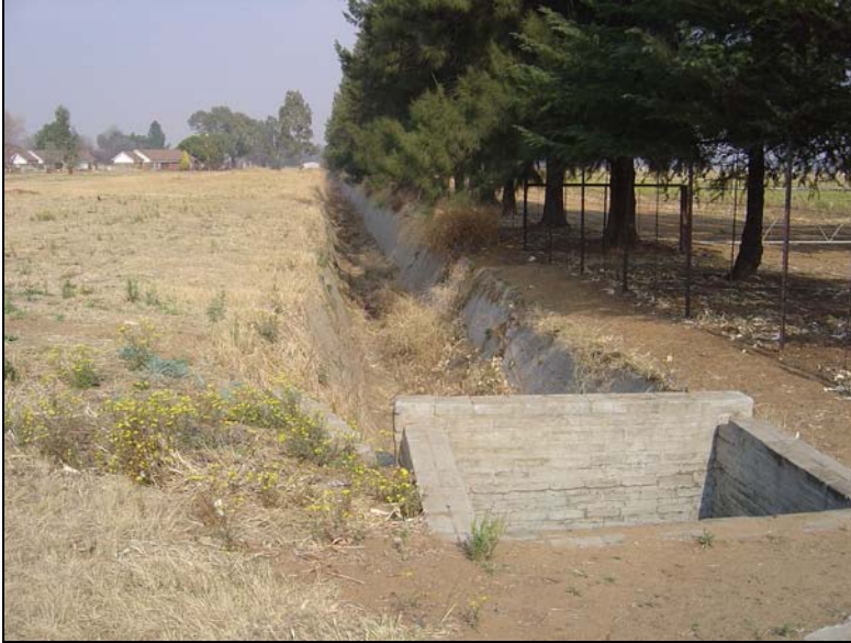
Fig.3 The pipeline route will run adjacent to the floodwater channel on the outskirts of Viljoenskroon.