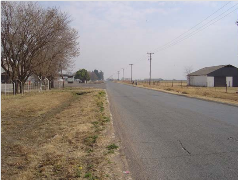
Fig.12 Road through the industrial area at Viljoenskroon facing east.