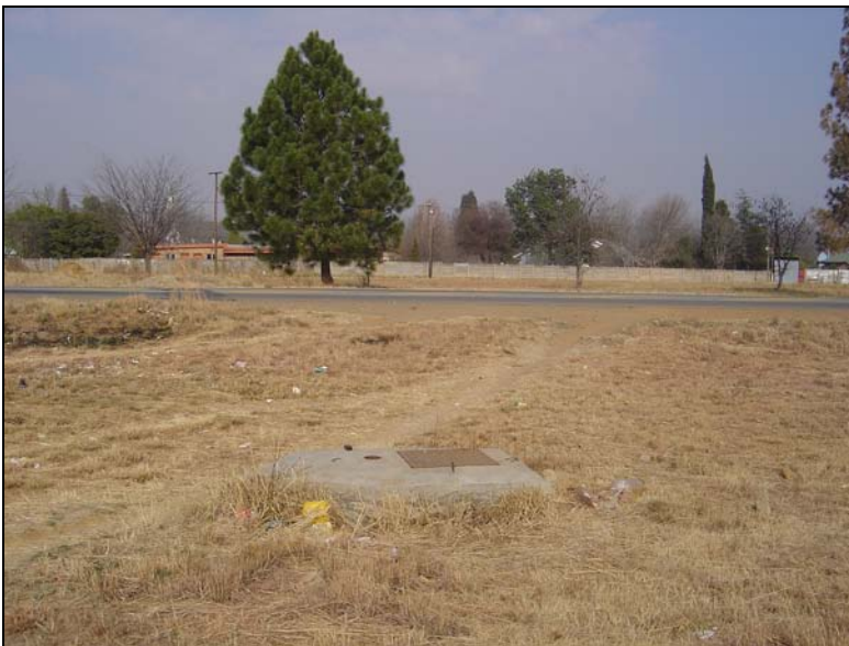
Fig.2 View from Rammulotsi towards Viljoenskroon indicating the direction the pipeline will follow. R76 road Kroonstad-Orkney in centre.