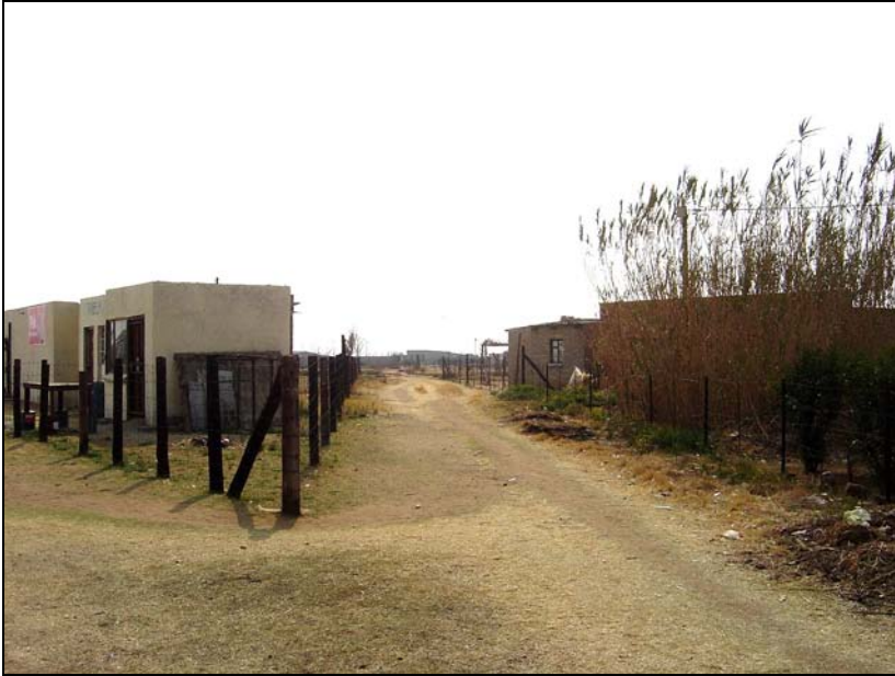
Fig.1 Pipeline entrance into the township of Rammulotsi at Viljoenskroon.