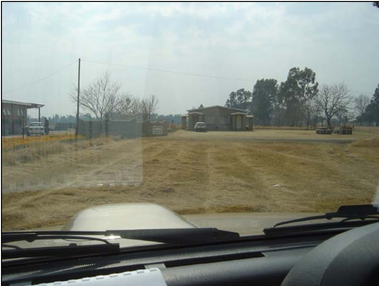
Fig.10 Overnight accommodation along the proposed pipeline route.