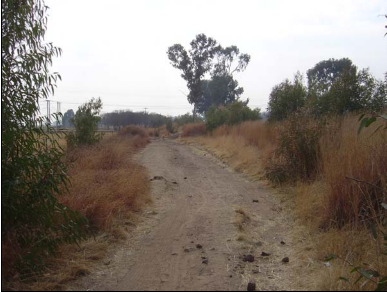
Fig.7 The pipeline route facing north.