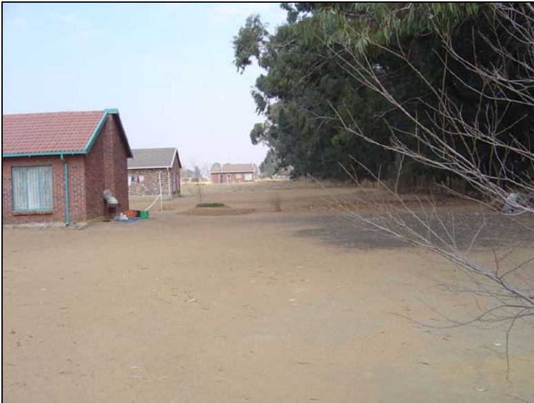
Fig.8 The water supply pipe will by-pass a housing scheme on its way.