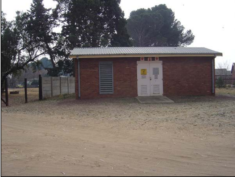
Fig.9 Eskom substation along the proposed pipeline route.