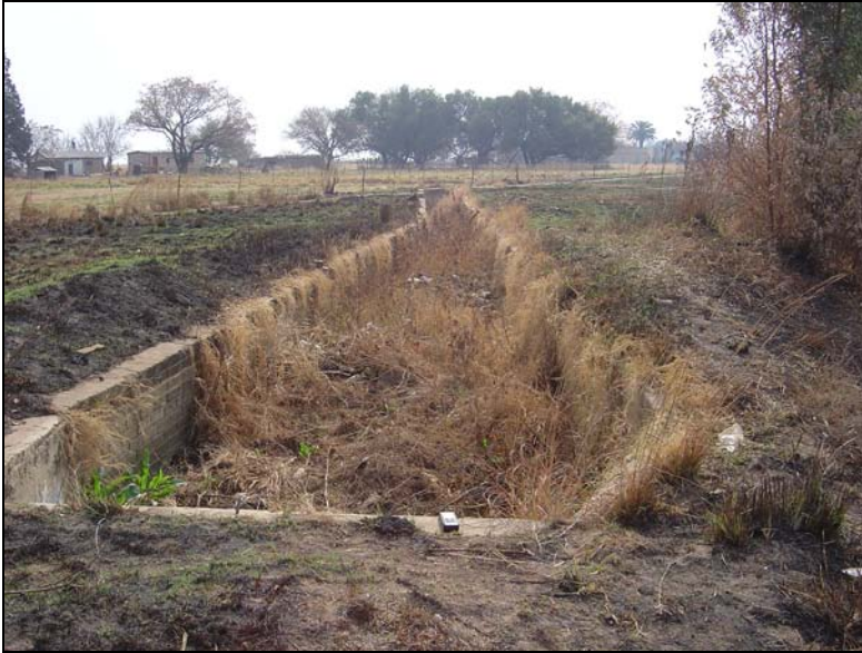
Fig.5 The floodwater channel near its southern end facing north.