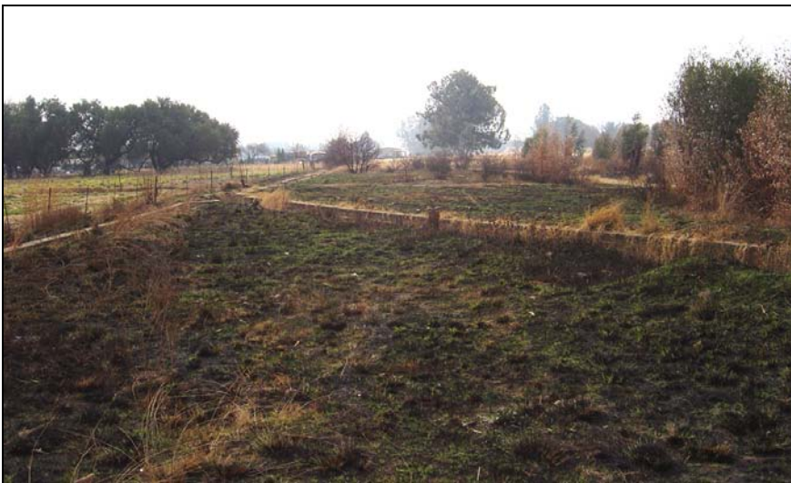
Fig.6 A wider perspective of the floodwater channel near its southern end.