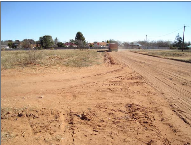
Fig.7 Point B facing towards the residential area of Viljoenskroon (Map 3).