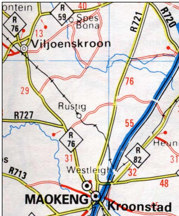
Map 1 Locality of Viljoenskroon in relation to Kroonstad.