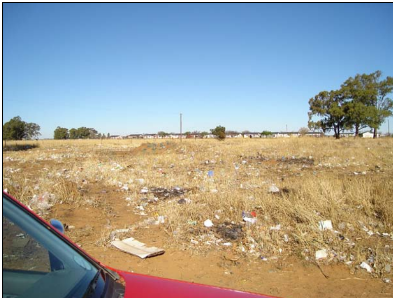
Fig.1 View of the proposed area of development at Rammulotsi.