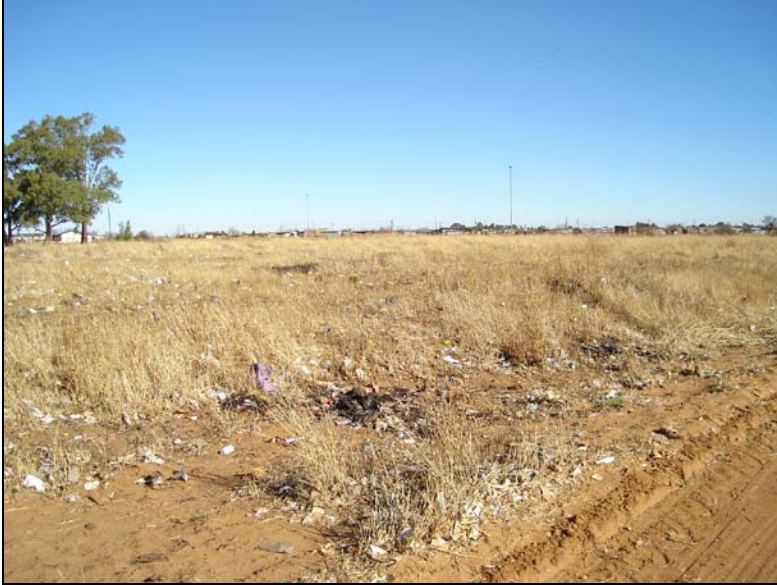
Fig.2 The proposed area of development facing towards the existing township.