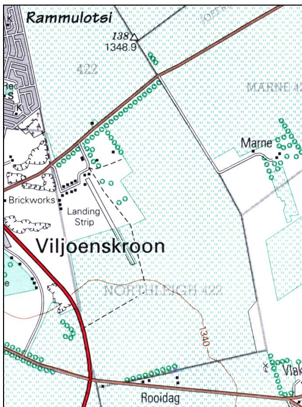
Map 2 Locality of Northleigh 422 outside Viljoenskroon. (2726BB).