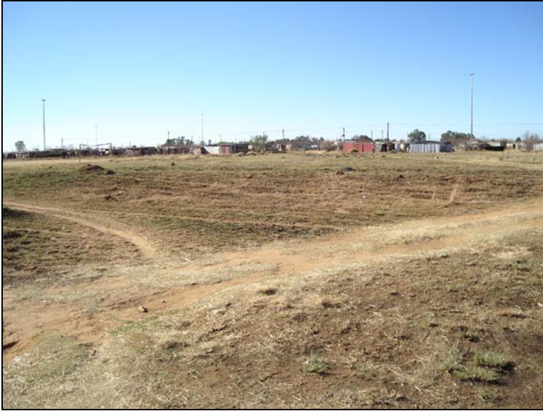
Fig.6 Second view of the site from Point B facing the existing township (Map 3).