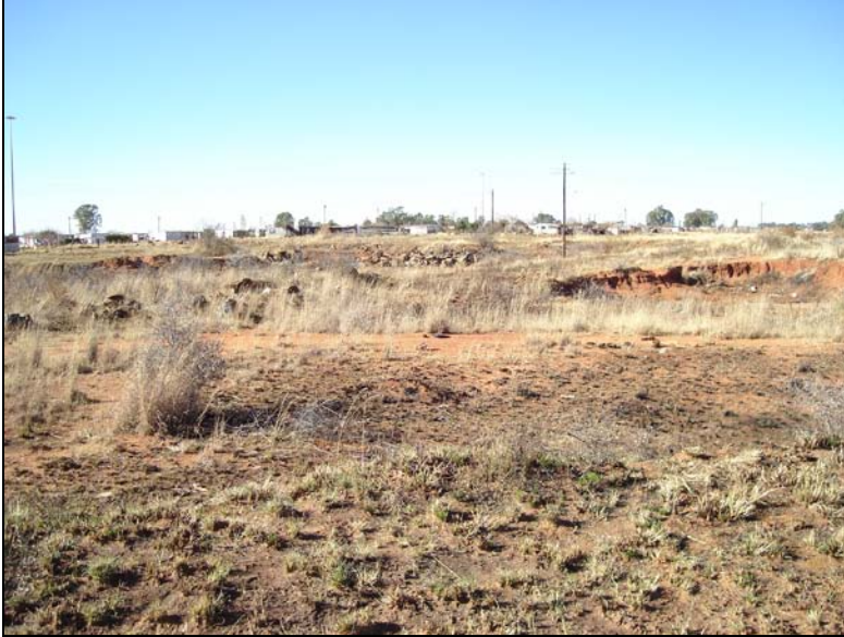
Fig.8 The proposed area of development facing towards the existing township from Point C (Map 3).