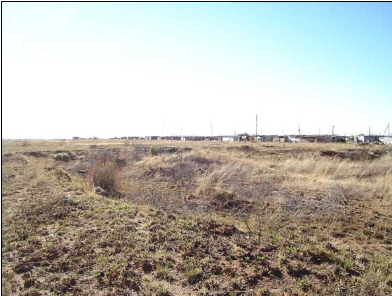
Fig.9 View from Point C facing north (Map 3).