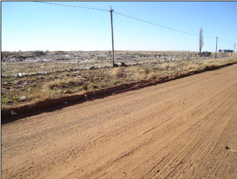
Fig.3 The proposed area as seen from point A (Map 3).