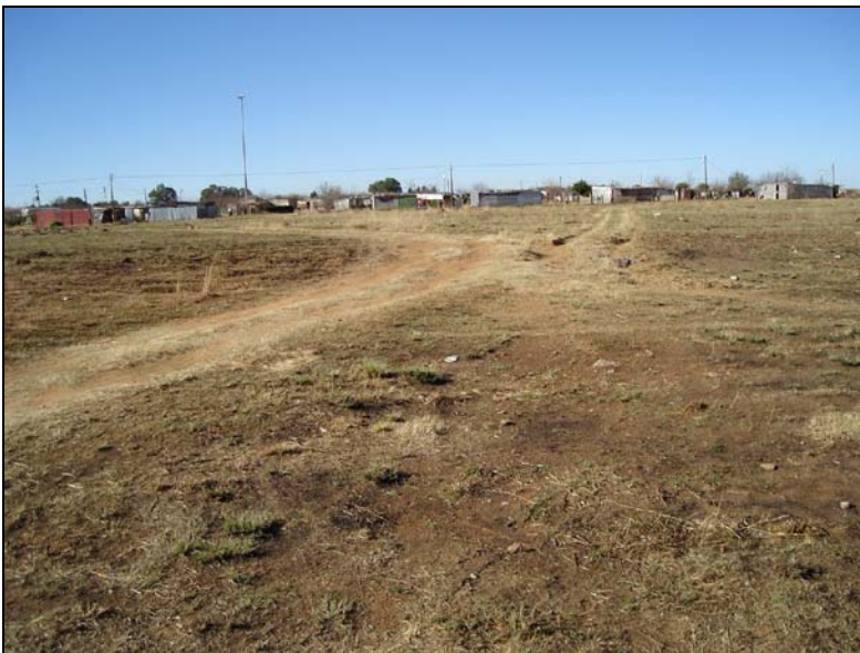
Fig.5 View of the site from Point B (Map 3).