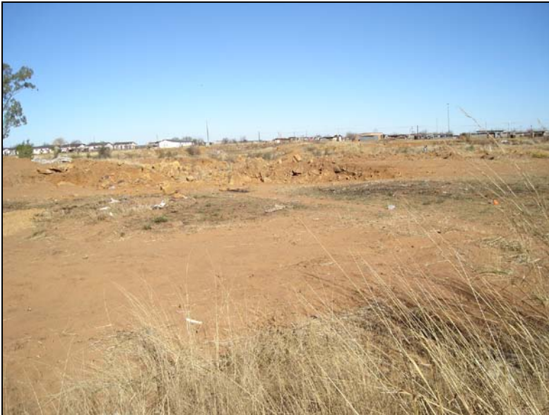
Fig.4 Another view from Point A (Map 3).