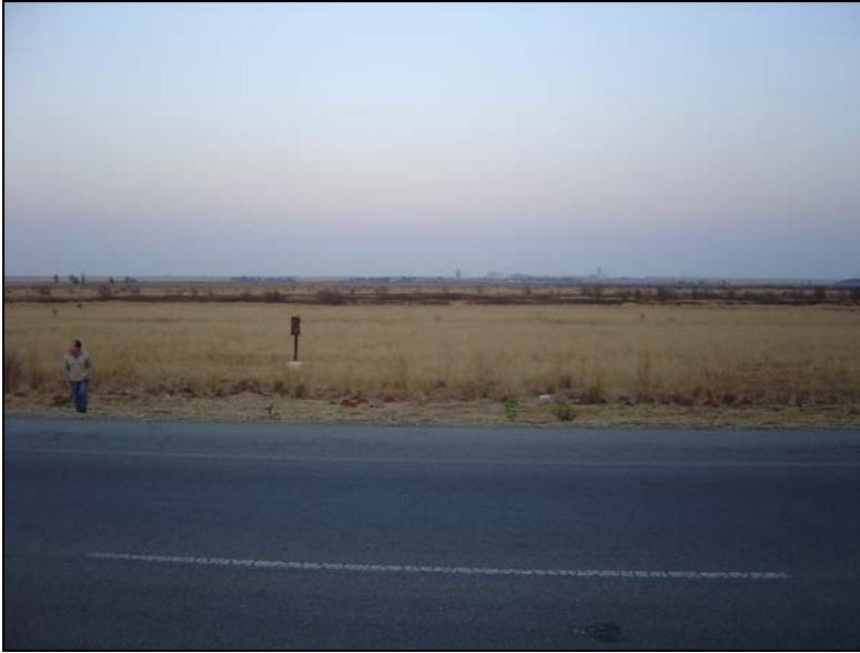
Fig.1 View of the area proposed for the development of a filling station at Virginia. Picture was taken facing west towards the farm Video, Virginia.