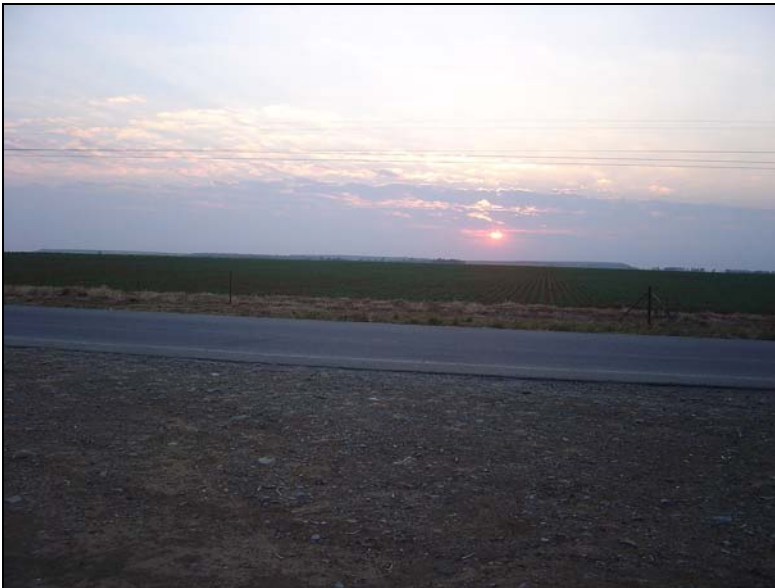
Fig.2 Facing east across the area of the proposed filling station at Virginia. Picture was taken facing east towards the La Riviera, Virginia.