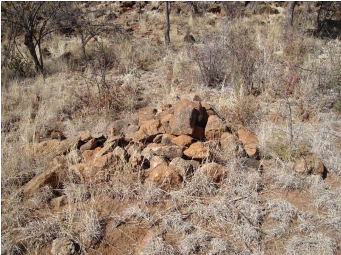
No. 4 Possible grave