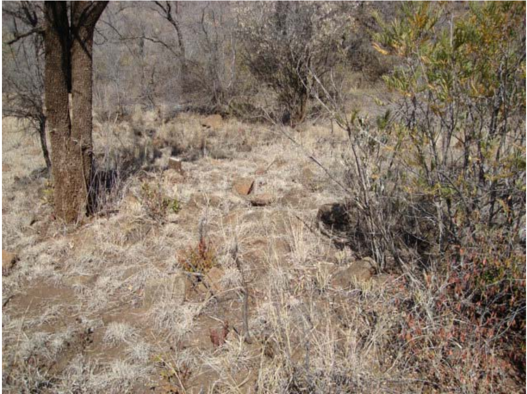
No. 3 Low stonewall of circular enclosure