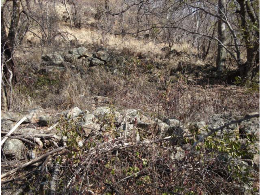
No. 1 Small stonewall circle