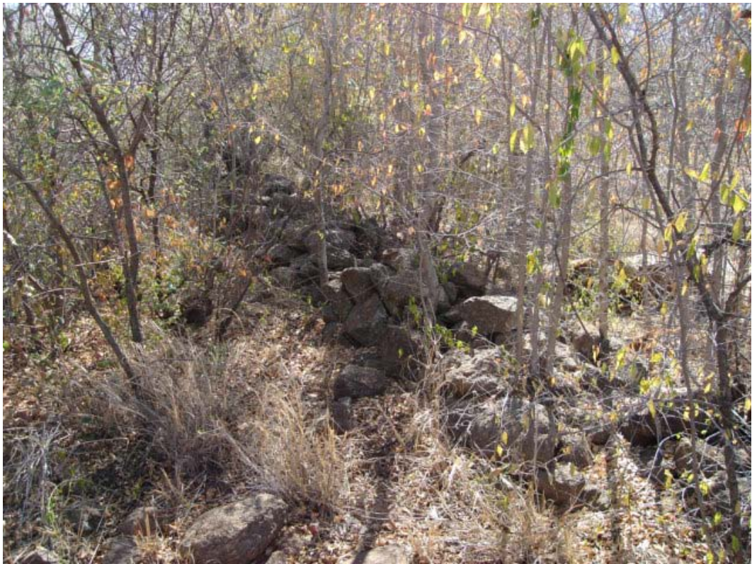
No. 2 Single stonewall twenty metres long