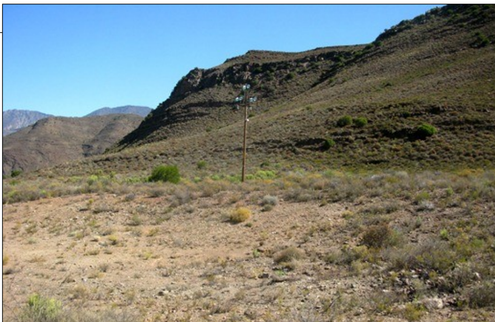
Figure 2: View south-westwards across the existing borrow pit (Almond 2013: 5)