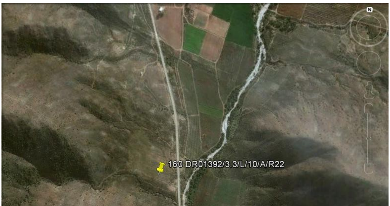
Figure 4: Aerial view of potential borrow pit (Google earth image, February 2013) 3