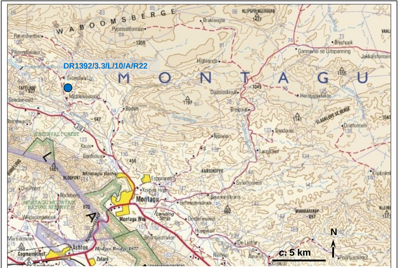
Figure 1: Extract from topographical sheet 3320 Ladismith (extracted Almond 2013: 2)

Proposal is for an extension of an existing borrow pit DR1392/3.3/L/10/A/R22 located along the unsealed DR1392 road approximately 13 km northwest of Montagu, Western Cape. The source of wearing course gravel is located within an existing borrow. Grass, shrubs and trees within and surround the borrow pit. The site is situated on the gentle east-facing footslopes of a low mountain range (Geewelkrans area south of the Waboomberge Range) on Portion 2 of Montagu Farm No.87 (Middel Voetpad) in private ownership of Wilem Gerhardus Beetge. Borrow pit co-ordinates are 33° 41' 12.2" S, 20° 03' 33.9" E