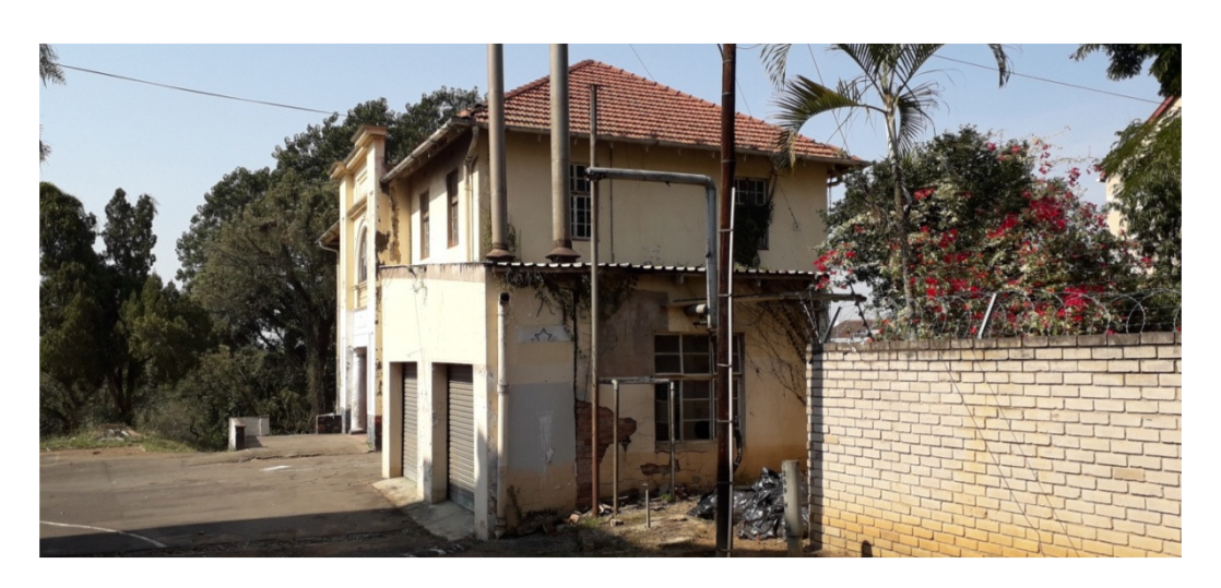
BUILDING G + H : The old X-Ray dpt and stores