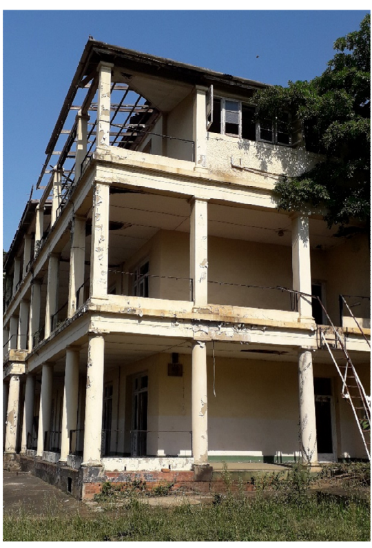
HERITAGE IMPACT ASSESSMENT(2) - Proposed KZN-MUSEUM at 96 Jabu-Ndlovu st Pmb Photographic record June 2021