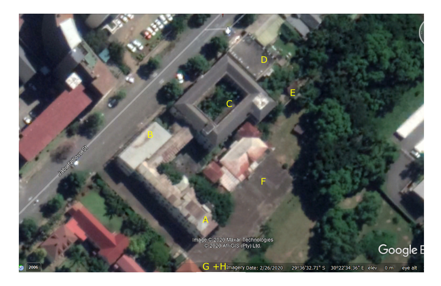
Aerial photo Reference