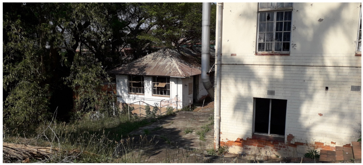
HERITAGE IMPACT ASSESSMENT(2) - Proposed KZN-MUSEUM at 96 Jabu-Ndlovu st Pmb Photographic record June 2021