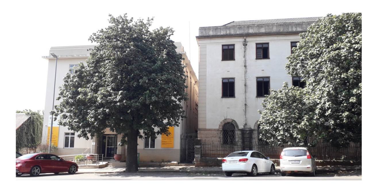
BUILDING D : Old Nurses Lodge