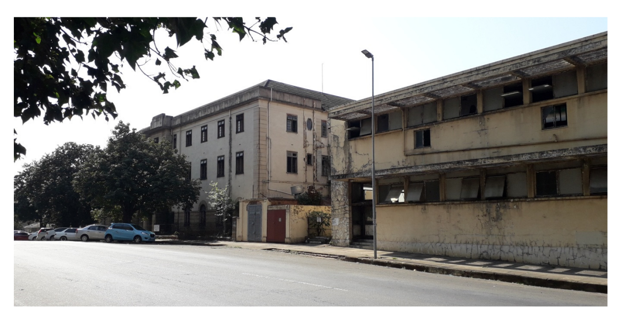
HERITAGE IMPACT ASSESSMENT(2) - Proposed KZN-MUSEUM at 96 Jabu-Ndlovu st Pmb Photographic record June 2021