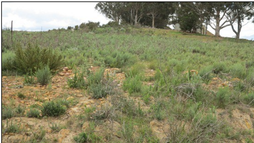
Figure 2: view towards the northeast with gravelly colluvium visible in the foreground (Tusenius 2012: 7)