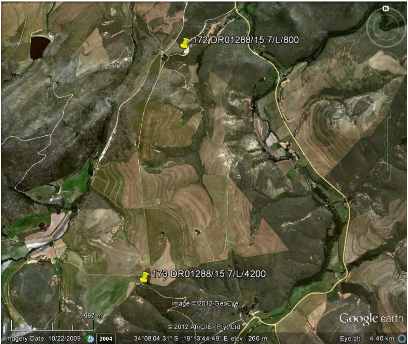
Figure 3: Aerial view of existing borrow pit locations (Google earth image, October 2012)