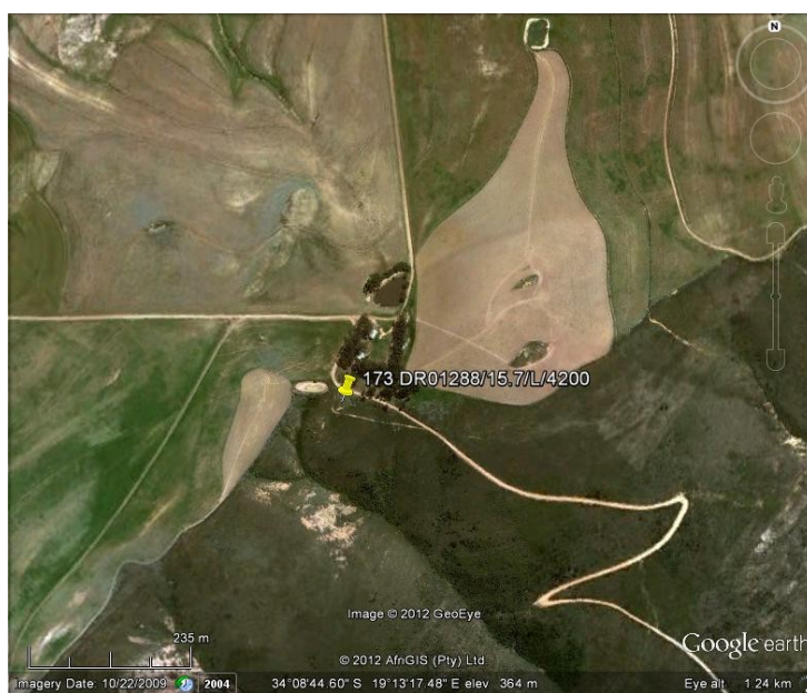
Figure 4: Aerial view of existing borrow pit and expropriation area (Google earth image, October 2012)