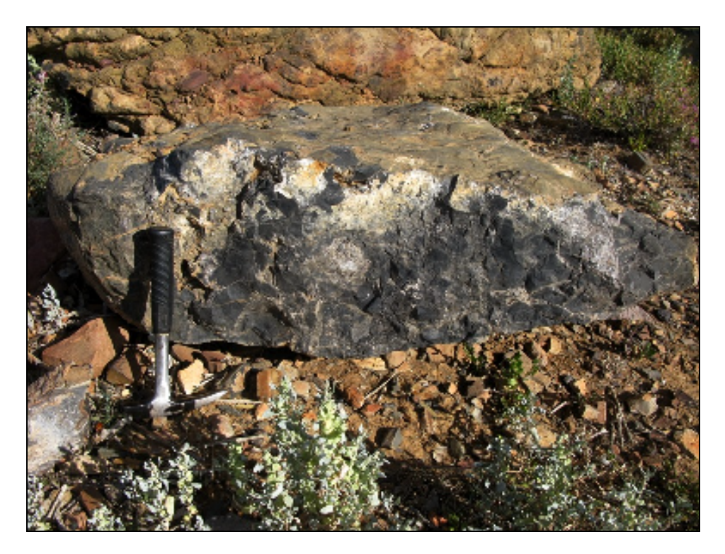
Fig. 8. Large dolomitic nodule with a brecciated fabric excavated from the Whitehill Formation (Hammer = 27 cm). Some Whitehill dolomite nodules in Prince Albert region are highly fossiliferous (e.g. crustaceans).