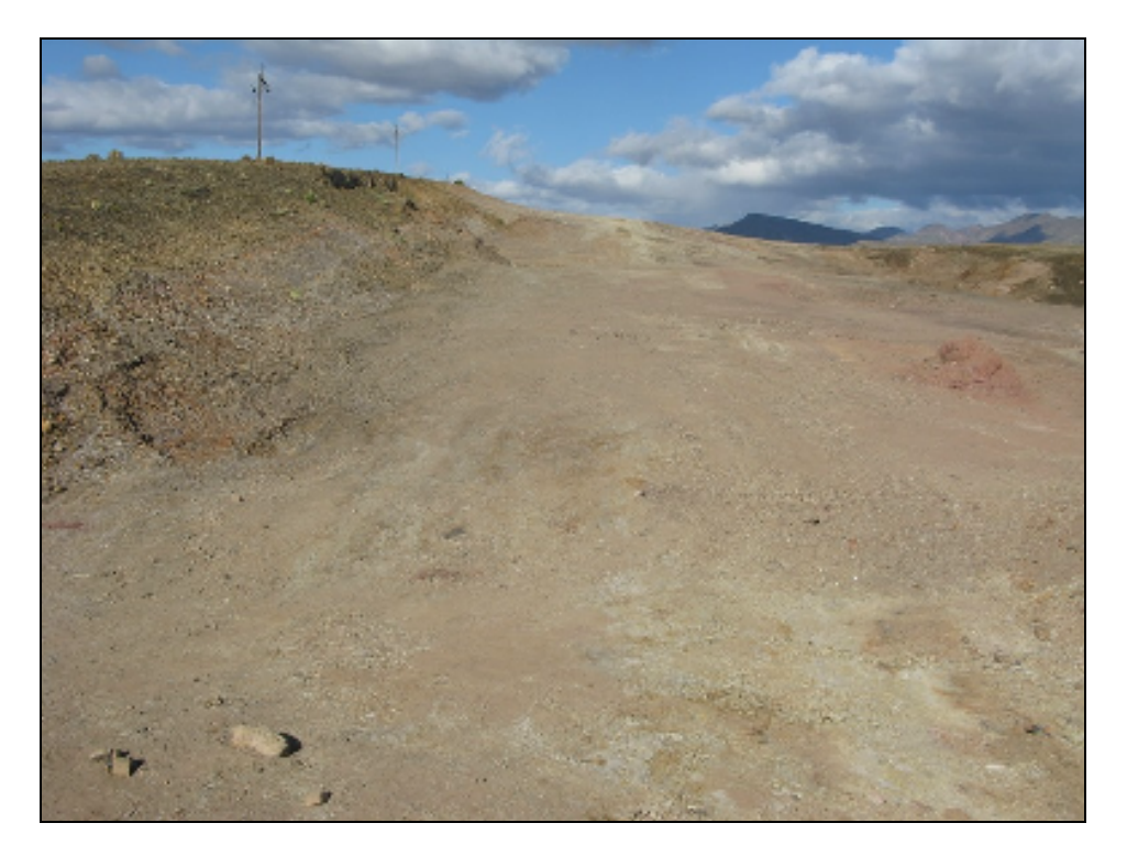
Fig. 4. View eastwards along the length of the large existing DR01725/0.6/0.02R borrow pit in the Prince Albert townlands. Dark mudrocks in the south (RHS) belong to the Prince Albert Formation. The main pit area is excavated into pale Whitehill Formation mudrocks (centre). The ridge in the north is built of more resistant sediments of the Collingham Formation (LHS).