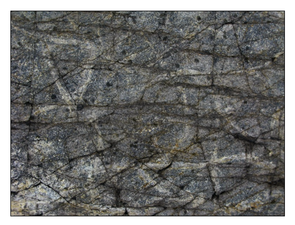
Fig. 12. Close-up of freshly broken surfaces within mudrocks of the Collingham Formation showing dense assemblages of horizontal endichnial burrows at two different scales (Pale larger burrows are c . 1 cm across).