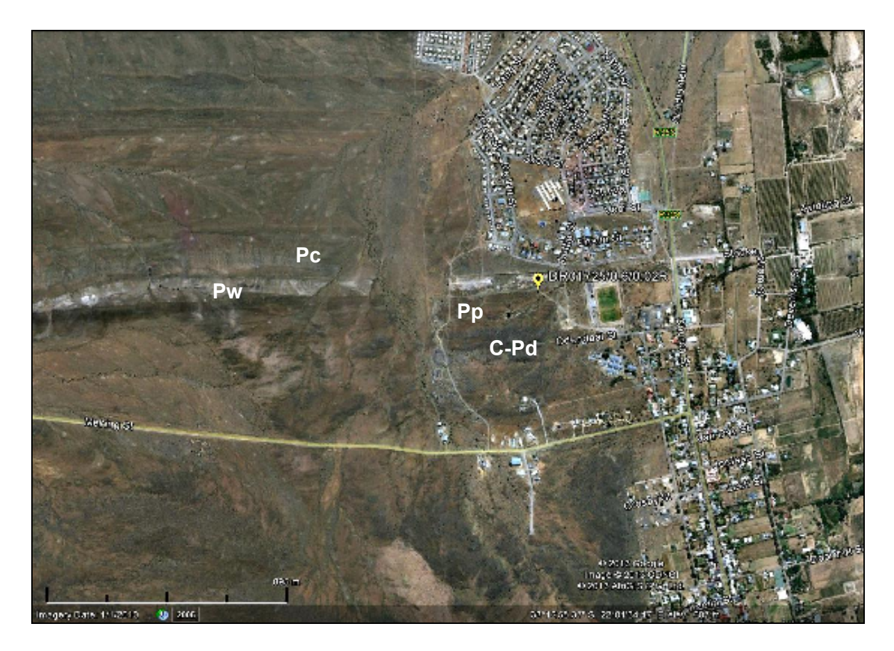
Fig. 2. 2005 Google earth© satellite image of the study area in the Prince Albert Townlands showing the location of the large existing DR01725/0.6/0.02R borrow pit along the DR1725 (yellow symbol). Note the east-west striking outcrop areas of the Dwyka (C-Pd), Prince Albert (Pp), Whitehill (Pw) and Collingham Formations (Pc) as well as the minor stream running N-S on the western side of the pit.