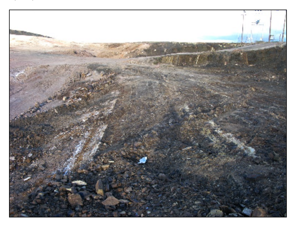
Fig. 5. View eastwards along strike of the Prince Albert Formation exposure along the southern margin of the DR01725/0.6/0.02R pit. The pale stripes are thin tuff (volcanic ash) horizons.

Fig. 4. View eastwards along the length of the large existing DR01725/0.6/0.02R borrow pit in the Prince Albert townlands. Dark mudrocks in the south (RHS) belong to the Prince Albert Formation. The main pit area is excavated into pale Whitehill Formation mudrocks (centre). The ridge in the north is built of more resistant sediments of the Collingham Formation (LHS).