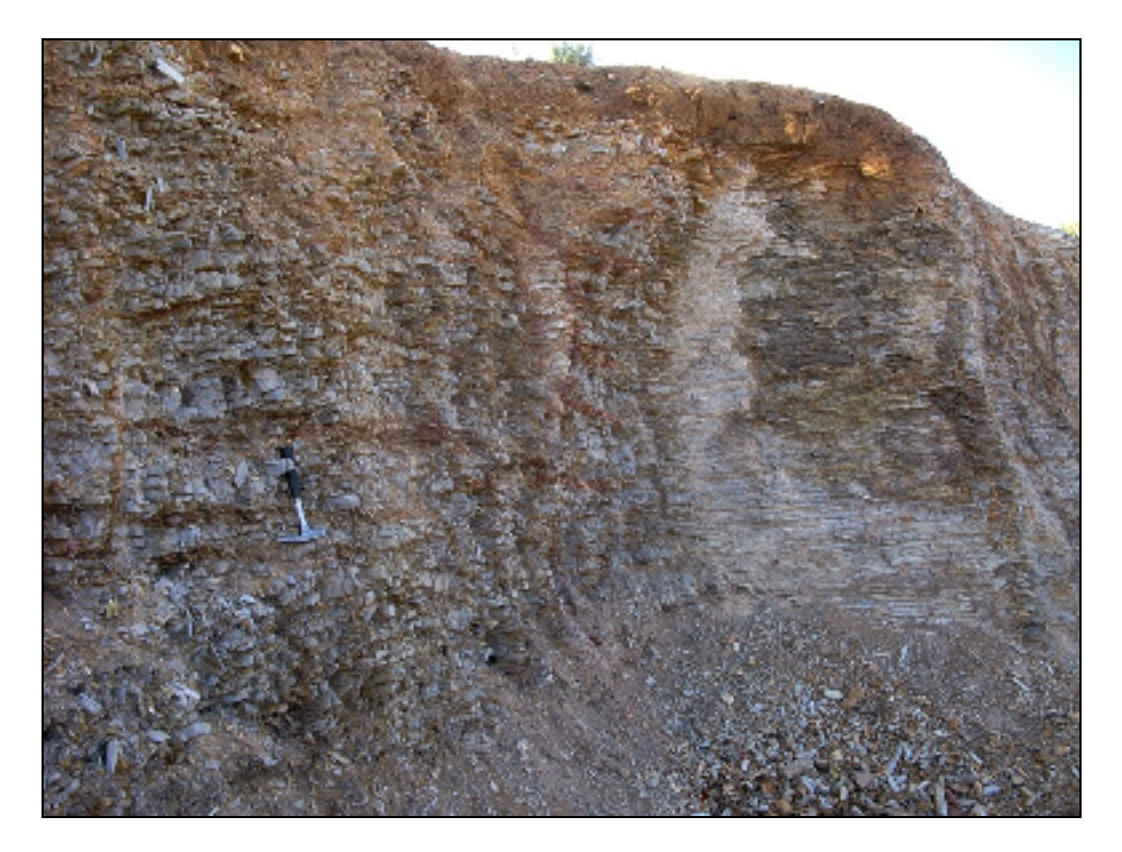
Fig. 7. Cut face of weathered and highly cleaved, pale grey mudrocks of the Whitehill Formation (Hammer = 27 cm). The bedding here dips very steeply north (towards the observer) while the more prominent cleavage is subhorizontal.

Fig. 6. Close-up of unusually coarse-grained tuff from an ash layer within the Prince Albert Formation. The block on the left is c . 7 cm across.