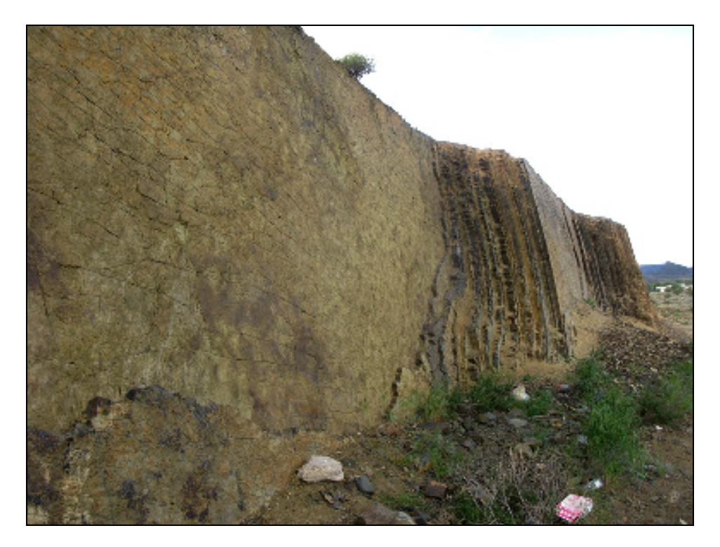
Fig. 9. Tabular, subvertical beds of the Collingham Formation exposed along the northern face of the existing DR01725/0.6/0.02R pit. The succession comprises alternating beds of silicified mudrock and pale yellow, crumbly tuff (volcanic ash).

Fig. 8. Large dolomitic nodule with a brecciated fabric excavated from the Whitehill Formation (Hammer = 27 cm). Some Whitehill dolomite nodules in Prince Albert region are highly fossiliferous (e.g. crustaceans).