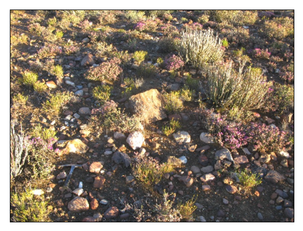
Fig. 11. Downwasted gravels mantling the lower Ecca mudrock outcrop area. The poorlysorted polymict gravels consist of quartzite, sandstone, vein quartz and a wide range of exotic rock types weathered out from the Dwyka Group tillites (Hammer = 27 cm).

Fig. 10. View westwards along the crest of the ridge running along the northern edge of the existing DR01725/0.6/0.02R borrow pit. The prominent-weathering tabular bed seen here is the well-known Matjiesfontein Member chert band within the lower Collingham Formation. The bedding here is overturned towards the north.