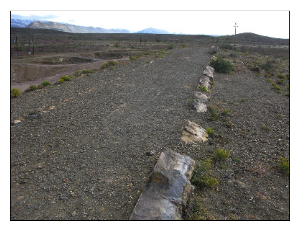
Fig. 10. View westwards along the crest of the ridge running along the northern edge of the existing DR01725/0.6/0.02R borrow pit. The prominent-weathering tabular bed seen here is the well-known Matjiesfontein Member chert band within the lower Collingham Formation. The bedding here is overturned towards the north.