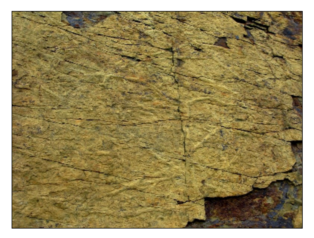
Fig. 13. Bedding plane (sole surface) exposure within the Collingham Formation showing dense assemblages of horizontal burrows ( c . 1 cm across) at the interface of pale yellowish tuff and dark grey mudrock.

Fig. 12. Close-up of freshly broken surfaces within mudrocks of the Collingham Formation showing dense assemblages of horizontal endichnial burrows at two different scales (Pale larger burrows are c . 1 cm across).