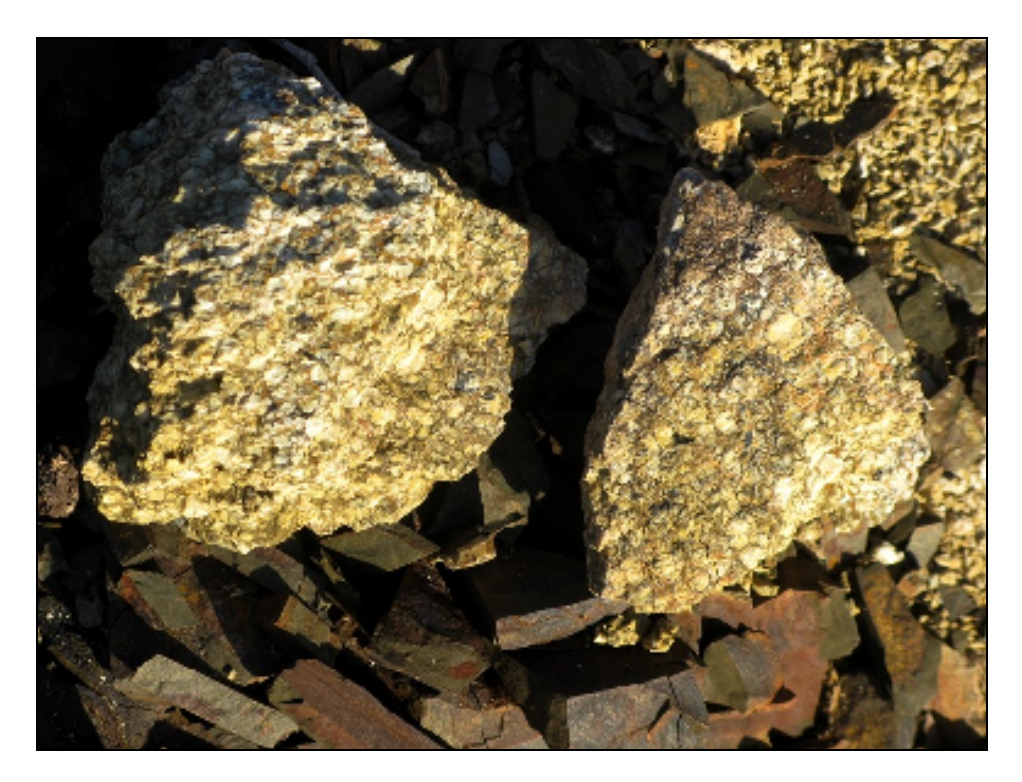
Fig. 6. Close-up of unusually coarse-grained tuff from an ash layer within the Prince Albert Formation. The block on the left is c . 7 cm across.