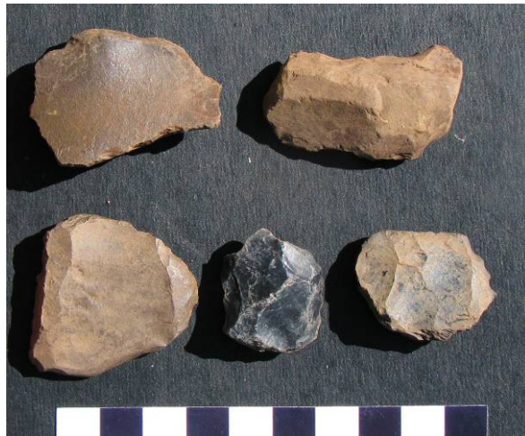
Artefacts from the talus slope below the shelter.