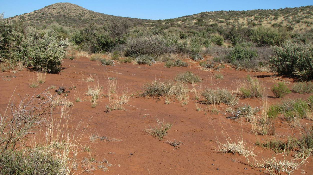
Sandy deposit in the bottom of the valley