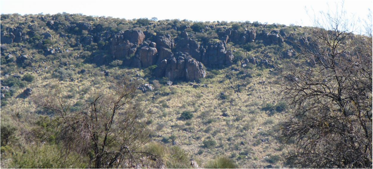
View of the shelter from the opposite side of the valley.