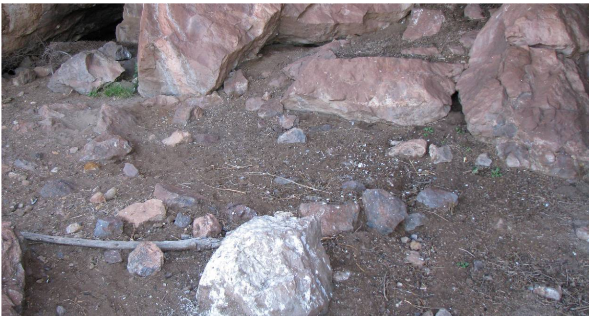
Shelter floor (above) and ostrich eggshell pieces and trimmed point (below)