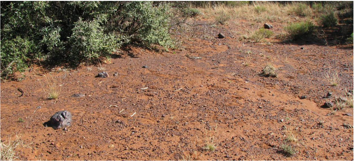
Colluvial fan deposit containing artefacts (below)