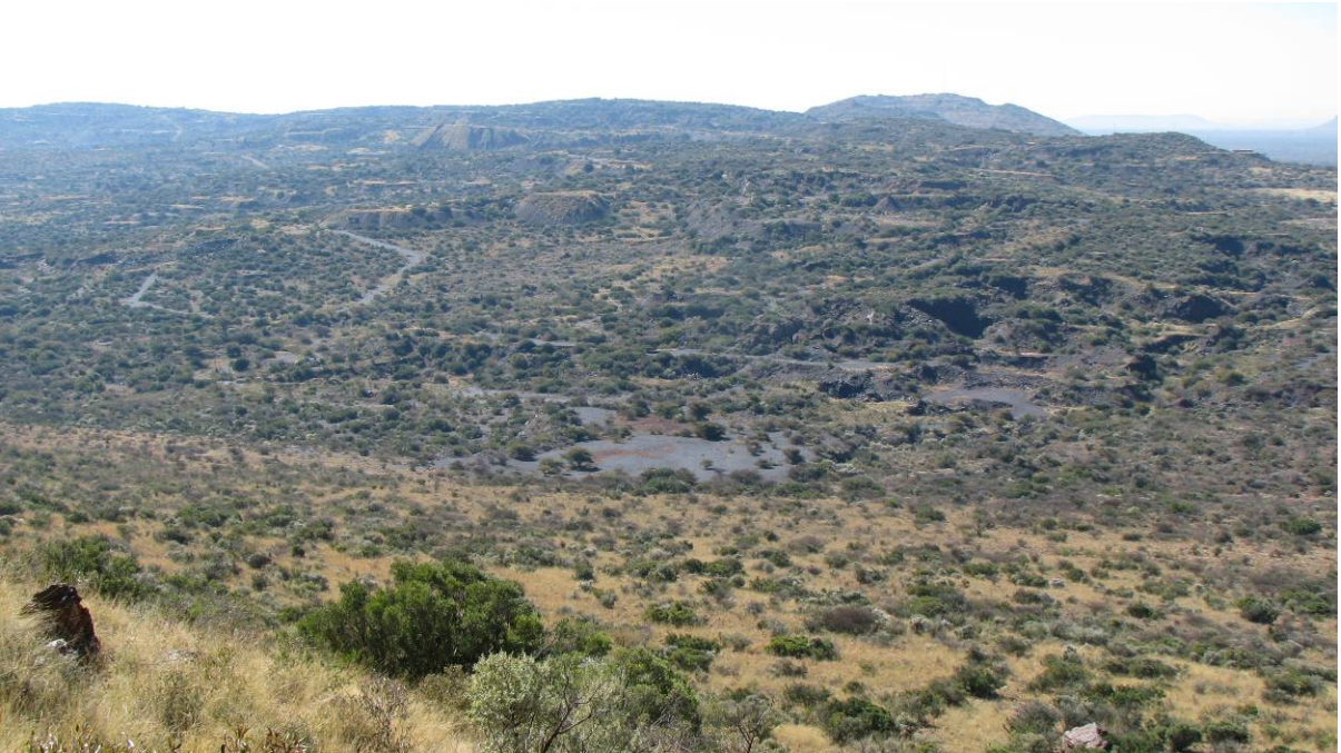
View eastwards from the talus area below the shelter – note previous mining damage on the opposite side of the valley.