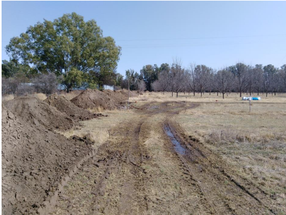
Figure 10: Earthworks along the route.