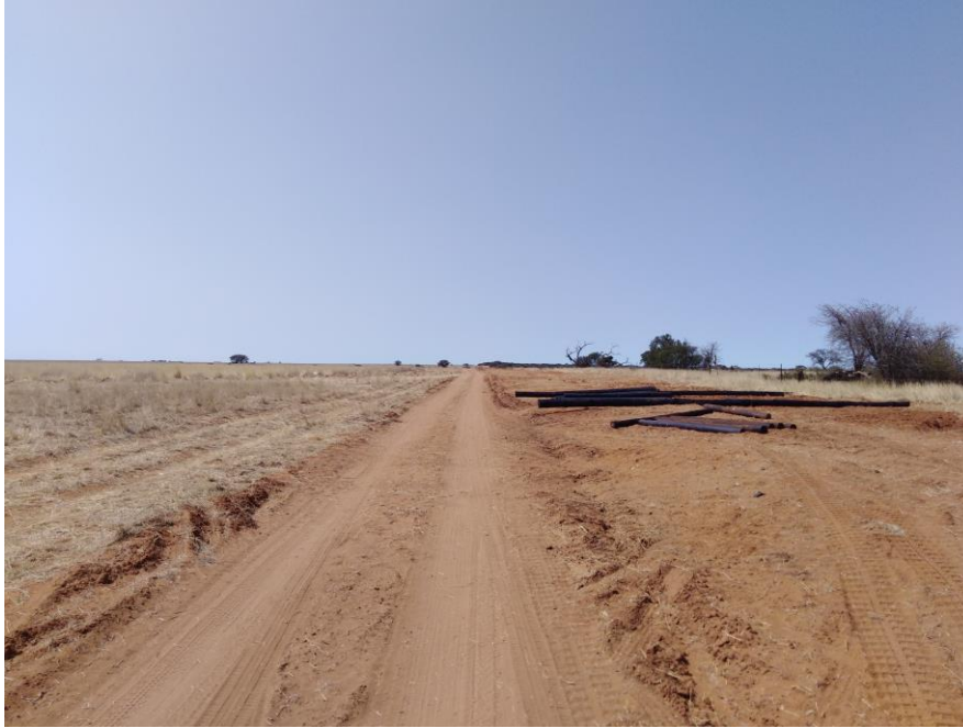
Figure 18: Point where the line ends.