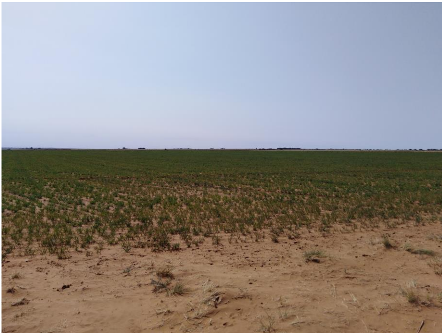
Figure 17: Agricultural field along the route.