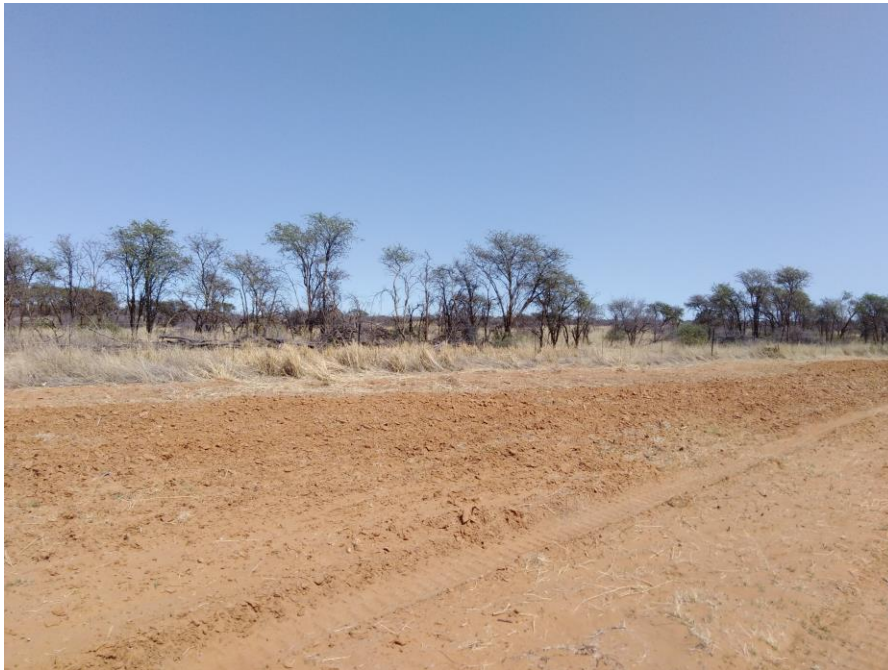
Figure 15: Agricultural fields along the route.