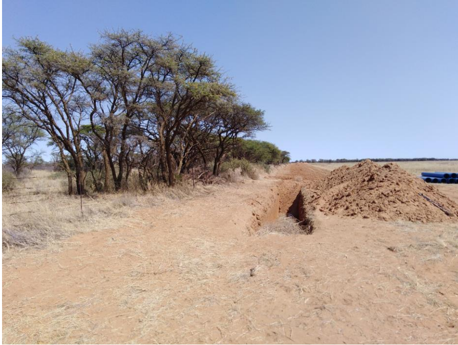
Figure 14: Trenches along the route.