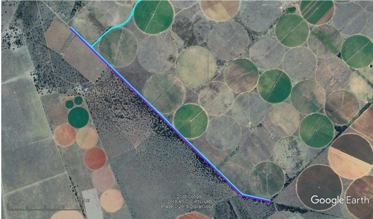
Figure 6: GPS track of the 4 km line. North reference is to the top.