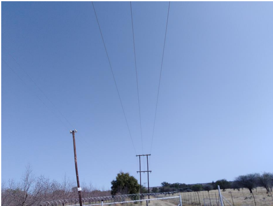
Figure 7: Area where the power line route starts.

From the starting point, the route runs in a north-western direction. It runs along farm roads (Figure 13), with minimal vegetation cover. Again the route is entirely disturbed by agricultural activities. This include trenches, agricultural fields and open areas (Figure 14-18).