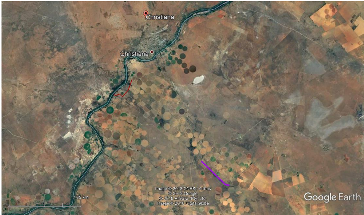
Figure 2: Location of two proposed power lines (red and purple lines) in relation to Christiana.