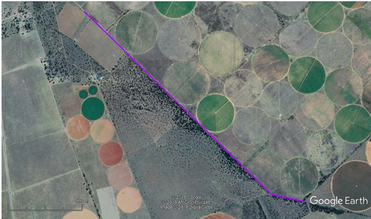
Figure 4: Zoomed in Google Earth image of the surveyed route for the 4 km line.