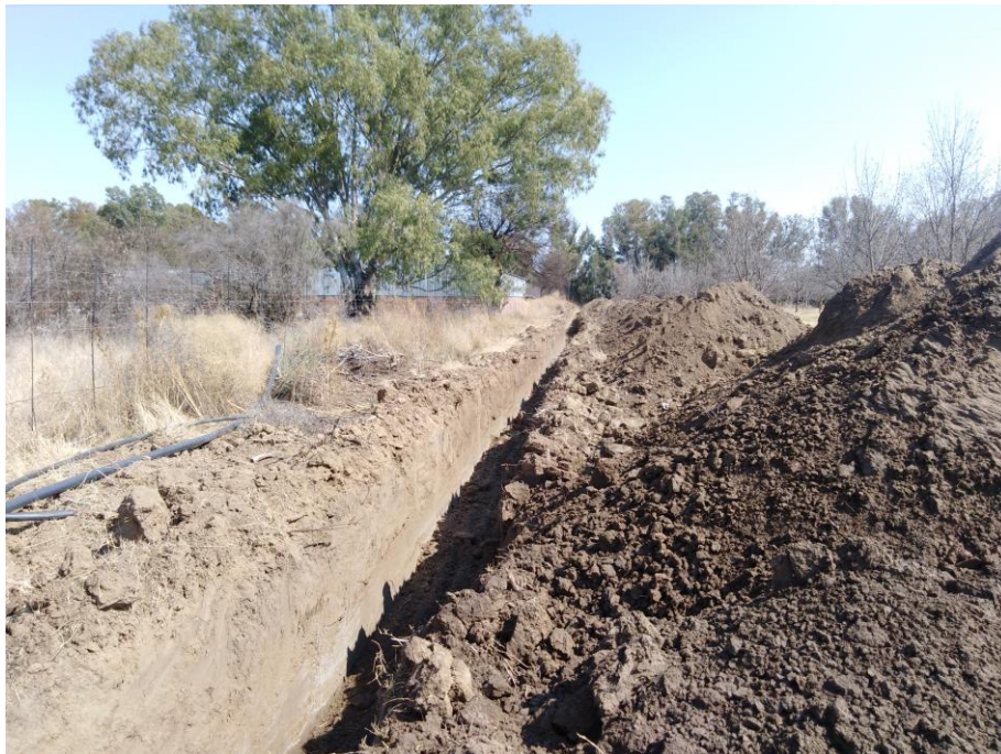
Figure 9: Trenches close to the end of the route.