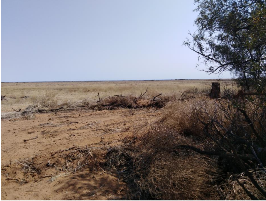
Figure 16: Low vegetation along the route.