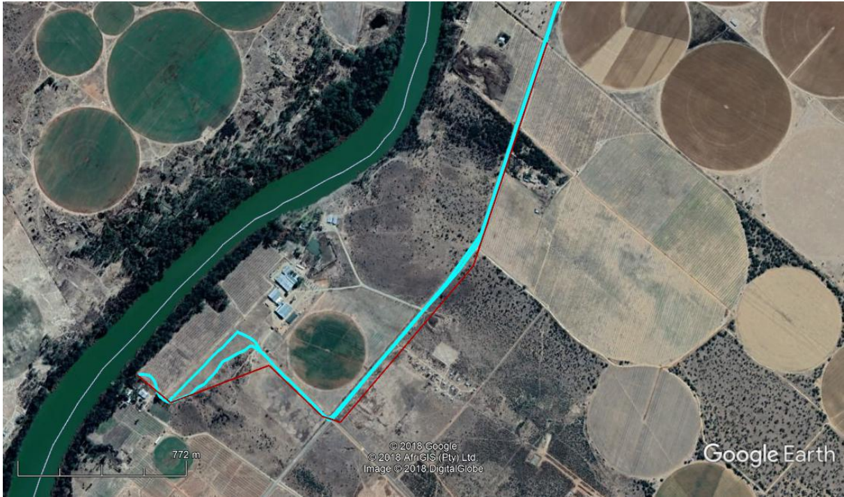
Figure 5: GPS track of the 3 km line. North reference is to the top.