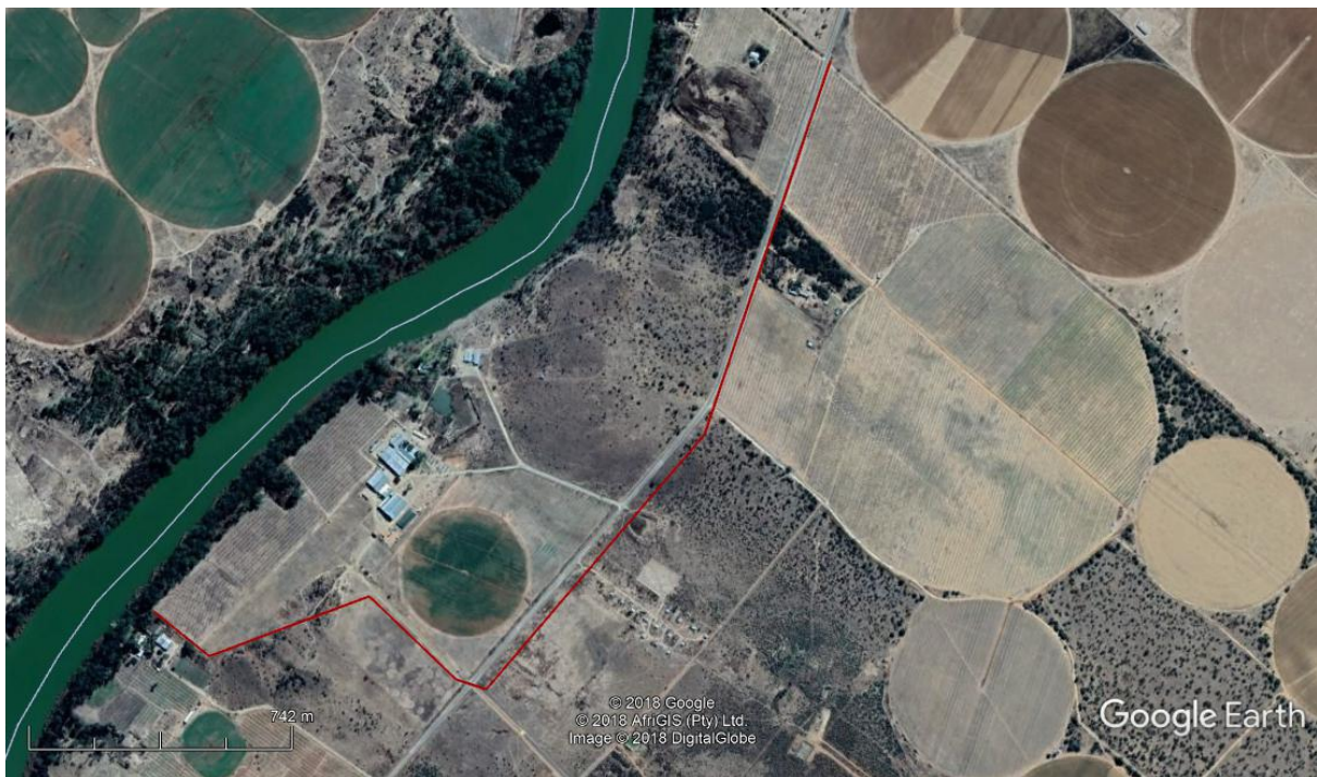
Figure 3: Zoomed in Google Earth image of the surveyed route for the 3 km line.