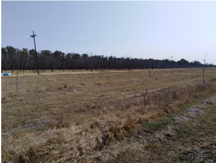
Figure 12: Orchard along the route.