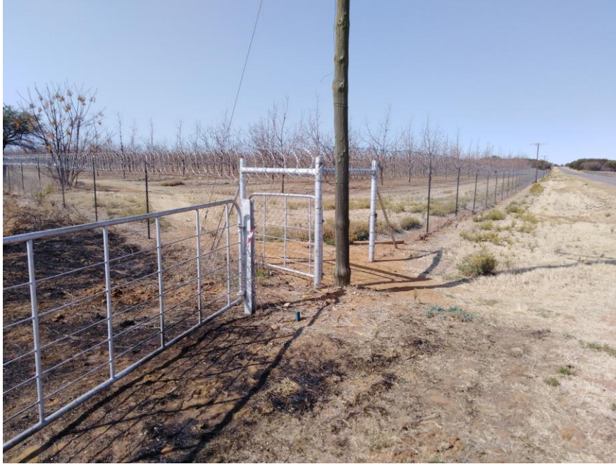
Figure 8: Point where the line starts at existing power line.