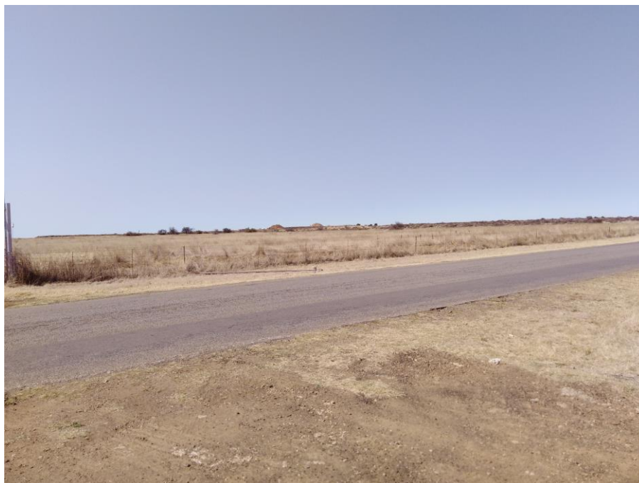
Figure 11: Agricultural fields along the route.