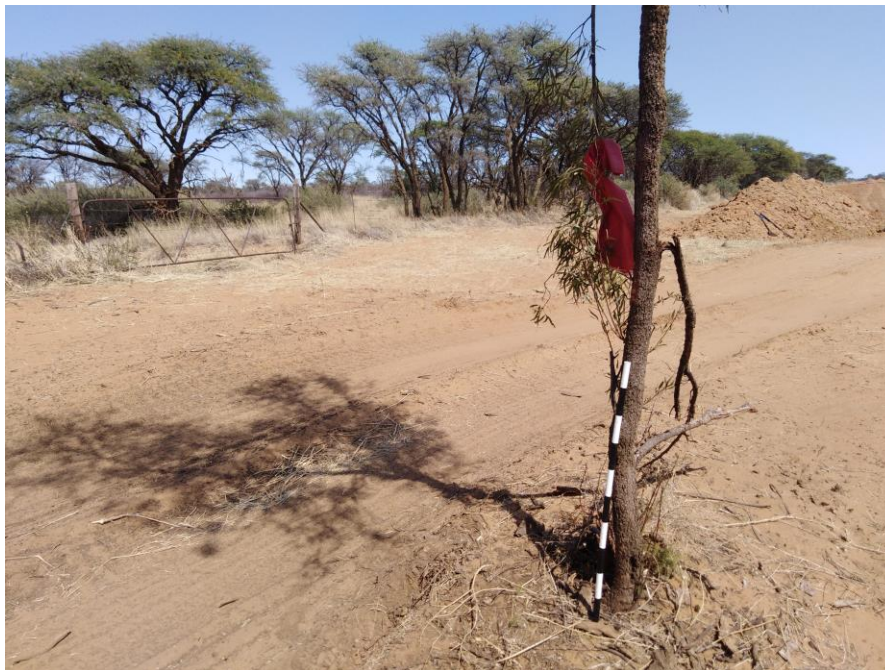
Figure 13: Farm road where the power line route starts.