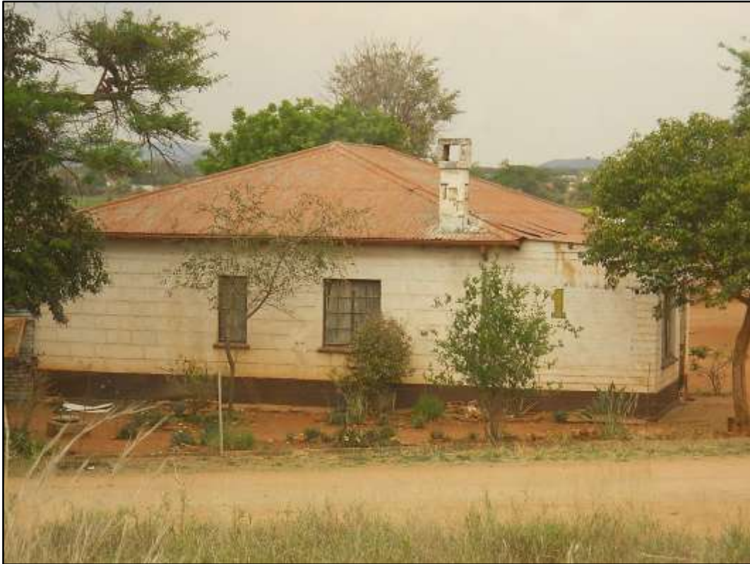
Figure 1. House mentioned under point 4.4.