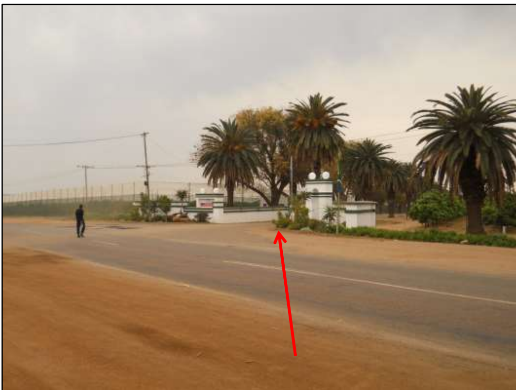
Figure 2. Most northern point on N11 at Schoeman Boerdery.