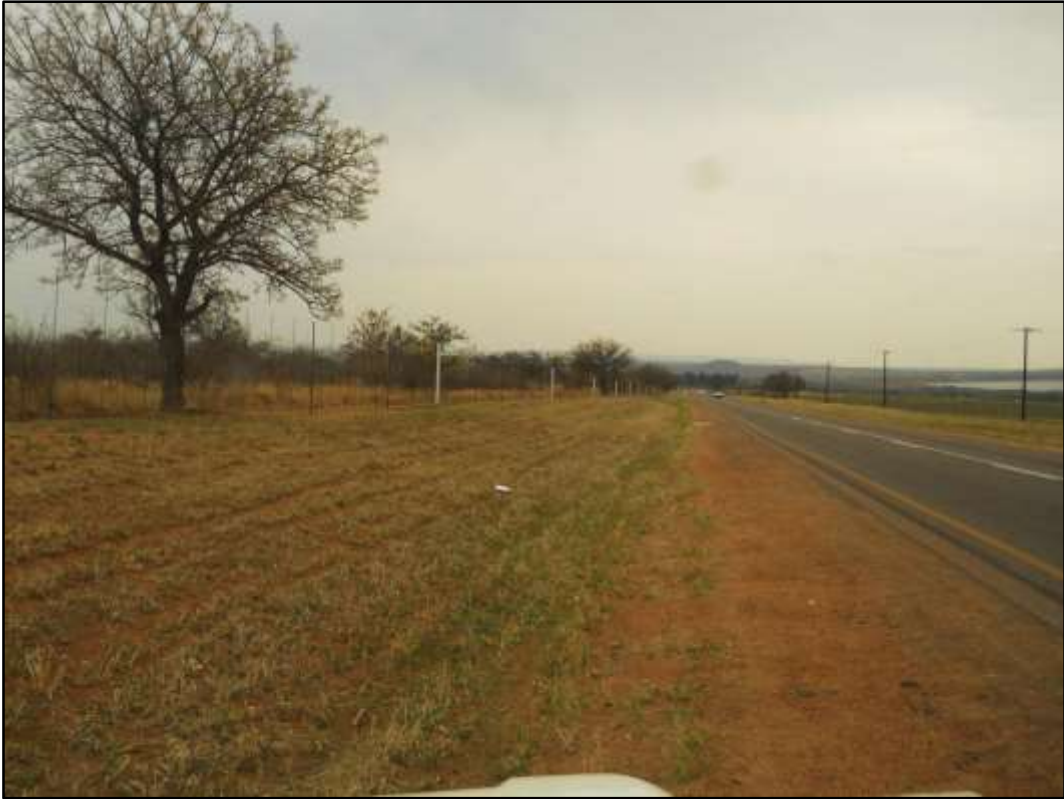
Figure 3. View long N11 – northerly direction.