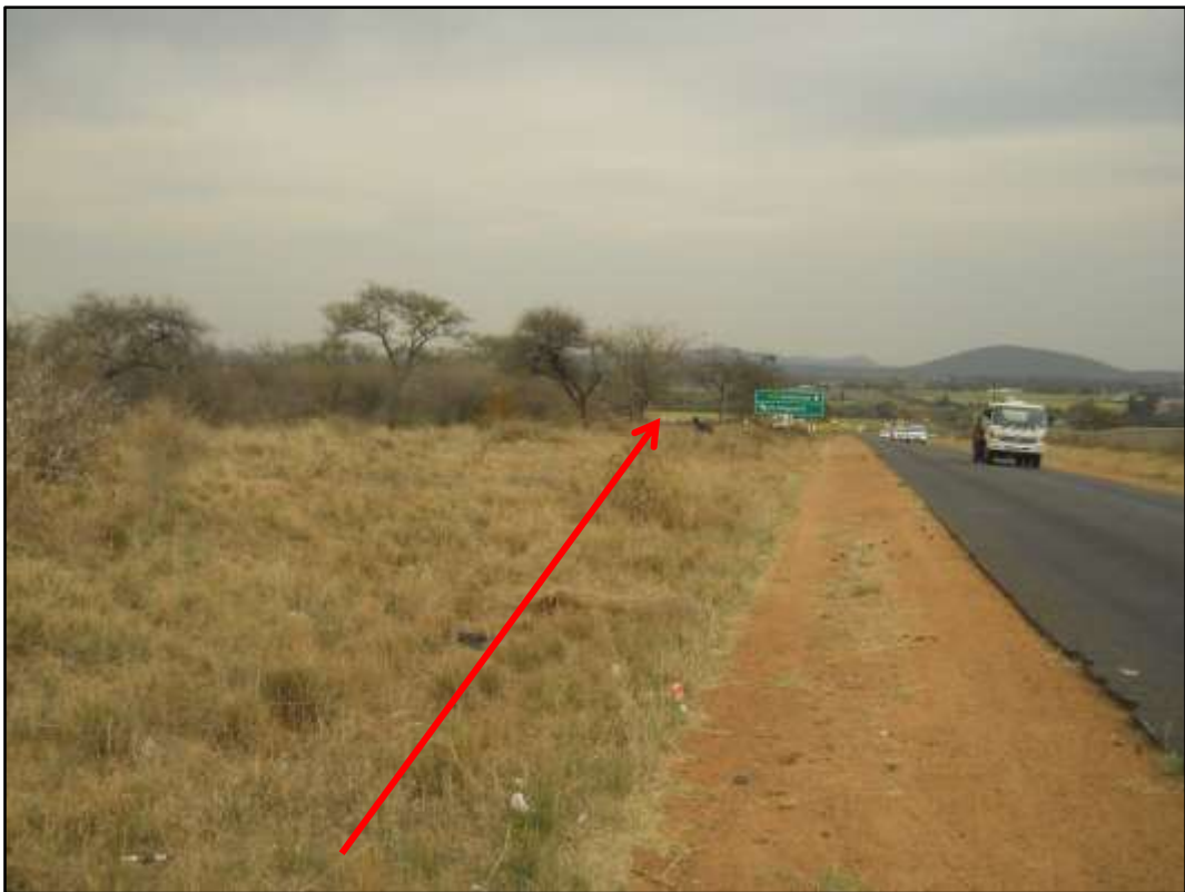
Figure 8. View of road reserve on R33 – westerly direction.