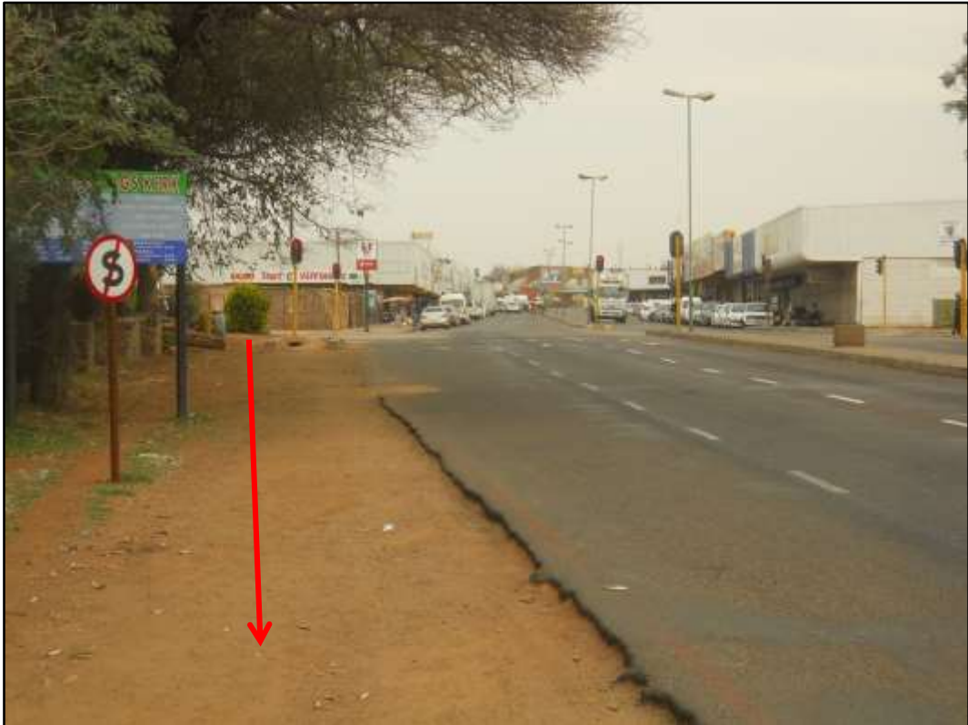
Figure 7. View where project commences on R33 in Groblersdal.