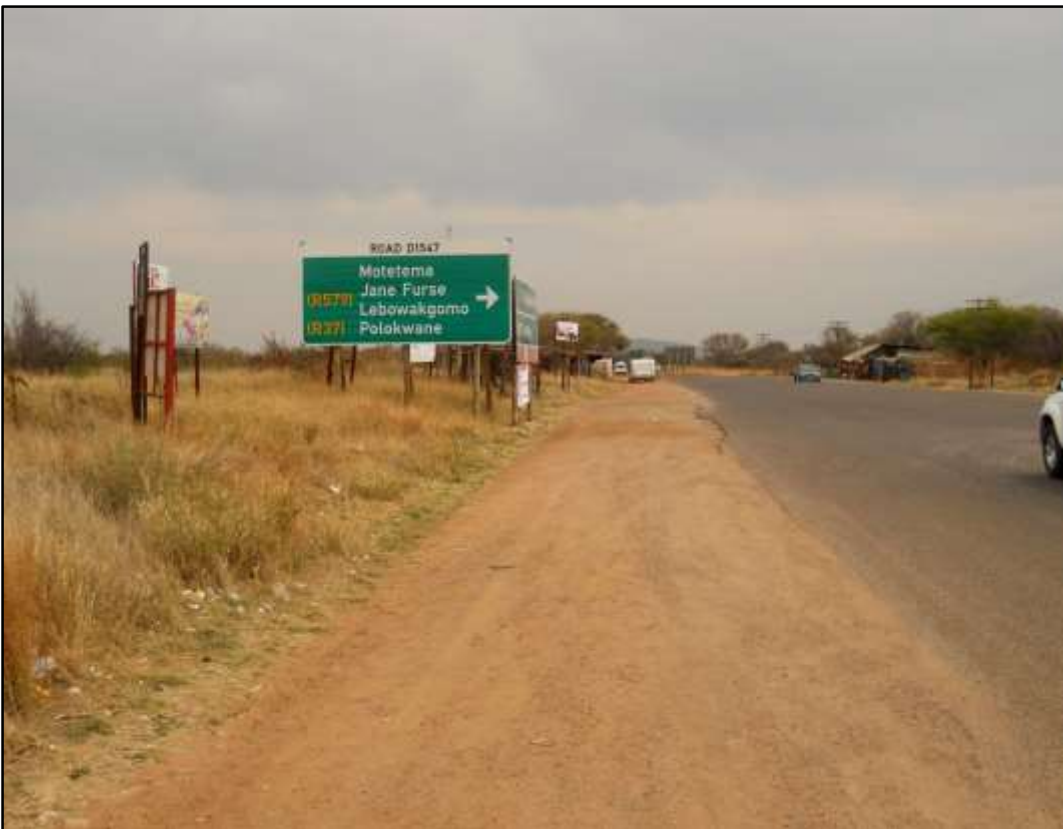
Figure 10. View of junction R33 and R579.