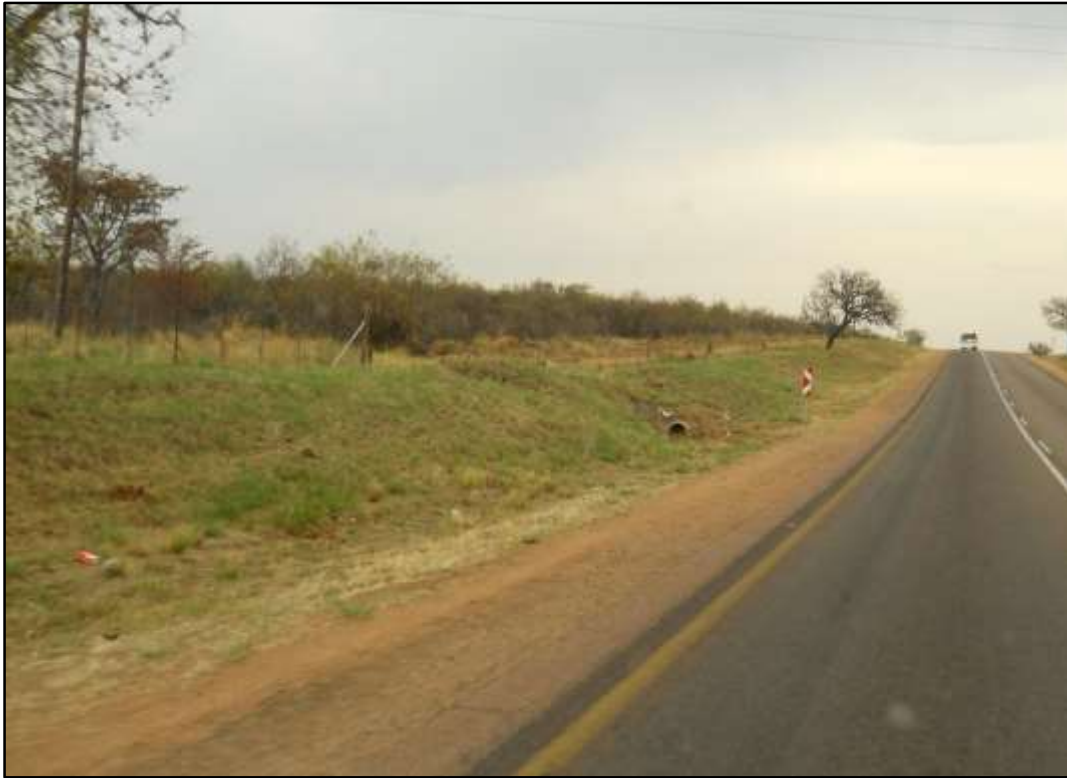
Figure 5. View along N11 – note disturbed road reserve.