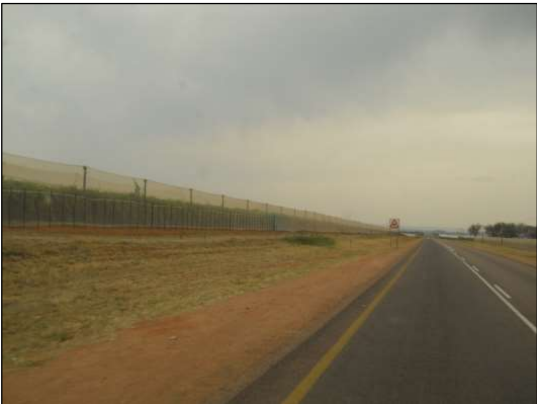
Figure 4. View along N11 – note agriculture.