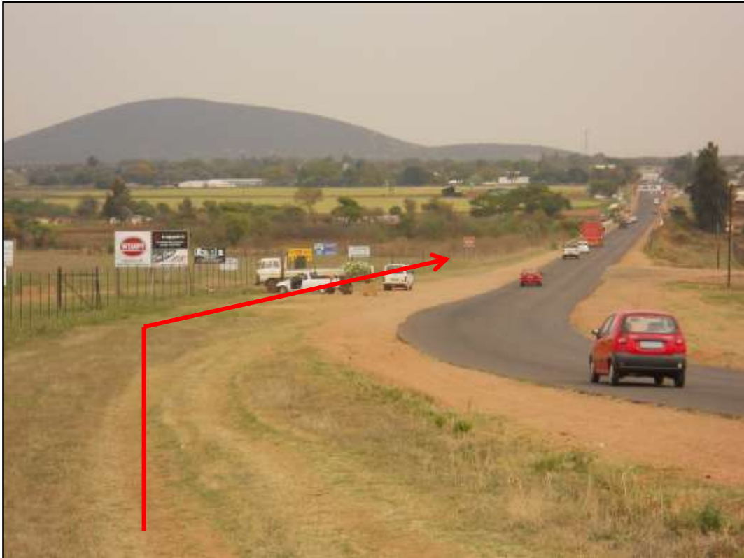
Figure 9. View of project route along R33 before entering Groblersdal.