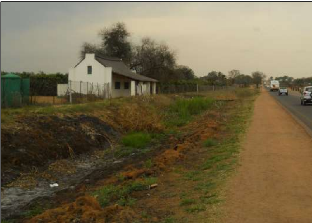
Figure 6. View along N11 – Note modern farm stall.