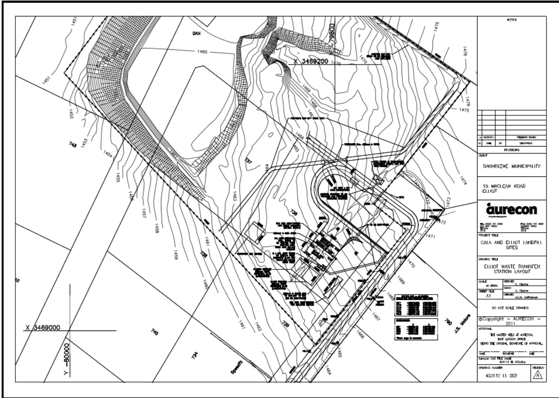
Figure 3: Proposed development layout of the Elliot Landfill study site