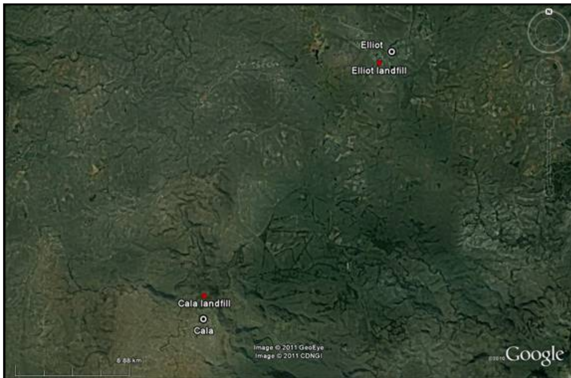
Figure 4: General localities of the proposed Cala and Elliot Landfill study sites, Eastern Cape

A low density of Middle Stone Age (MSA) artefacts were discovered within the exposed eroded area towards the north-west of the proposed Elliot Landfill study site. Particularly low artefact ratios (artefacts: m 2 ) in secondary context and in association with fairly poor technological standards, inferred to be a direct result of the raw material used, resulted in a SAHRA Low Significance site assignment. It is recommended that the proposed development proceeds as applied for provided the developer applies for a SAHRA Site Destruction Permit prior to development impact in order to legally impact on, or destroy the Site E1 low density MSA feature locale.