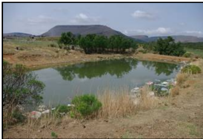
Figure 10: View of the south-western part of the Cala Landfill study site