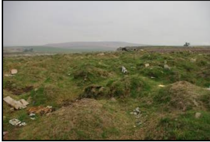
Figure 13: Surface disturbance characterizing the northern part of the Elliot Landfill study site