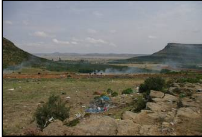
Figure 8: General view of the Cala Landfill study site from the north-eastern rocky ridge