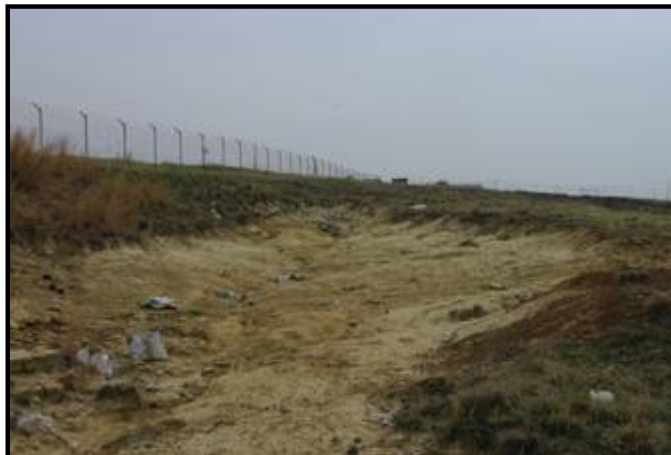
Figure 15: General view of Site E1