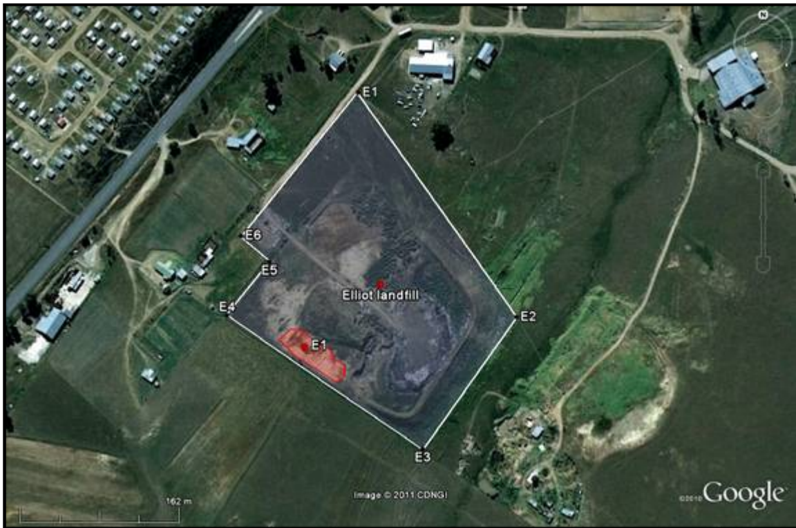
Figure 11: The Elliot Landfill study site – Phase 1 AIA assessment findings

A low density of Middle Stone Age (MSA) artefacts characterized a portion of the south-western part of the Elliot Landfill study site. The low density feature is described in more detail under Site E1. Aside from Stone Age artefacts identified in the Site E1 area the remainder of the study site proved to be anthropically sterile. No archaeological or cultural heritage resources or artefacts were found across the remainder of the surface of the site, including also the shallow eroded areas towards the north-west and further north of Site E1. Large exposed sections at the current cell yielded no clear cultural stratigraphic member and no cultural material was found in inspected mounds, characterizing much of the northern part of the study site.