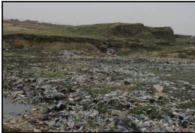
Figure 14: View of the Elliot Landfill waste cell with shallow eroded exposures (Site E1) visible towards the left background of the image