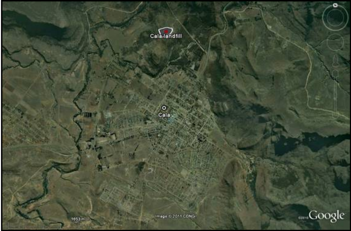
Figure 5: Locality of the Cala Landfill study site in relation to Cala, Eastern Cape