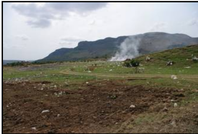
Figure 9: Shallow sub-surface disturbance at the Cala Landfill study site