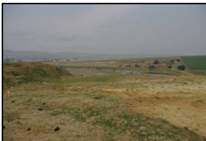
Figure 17: View from site E1 towards the Elliot Landfill waste cell