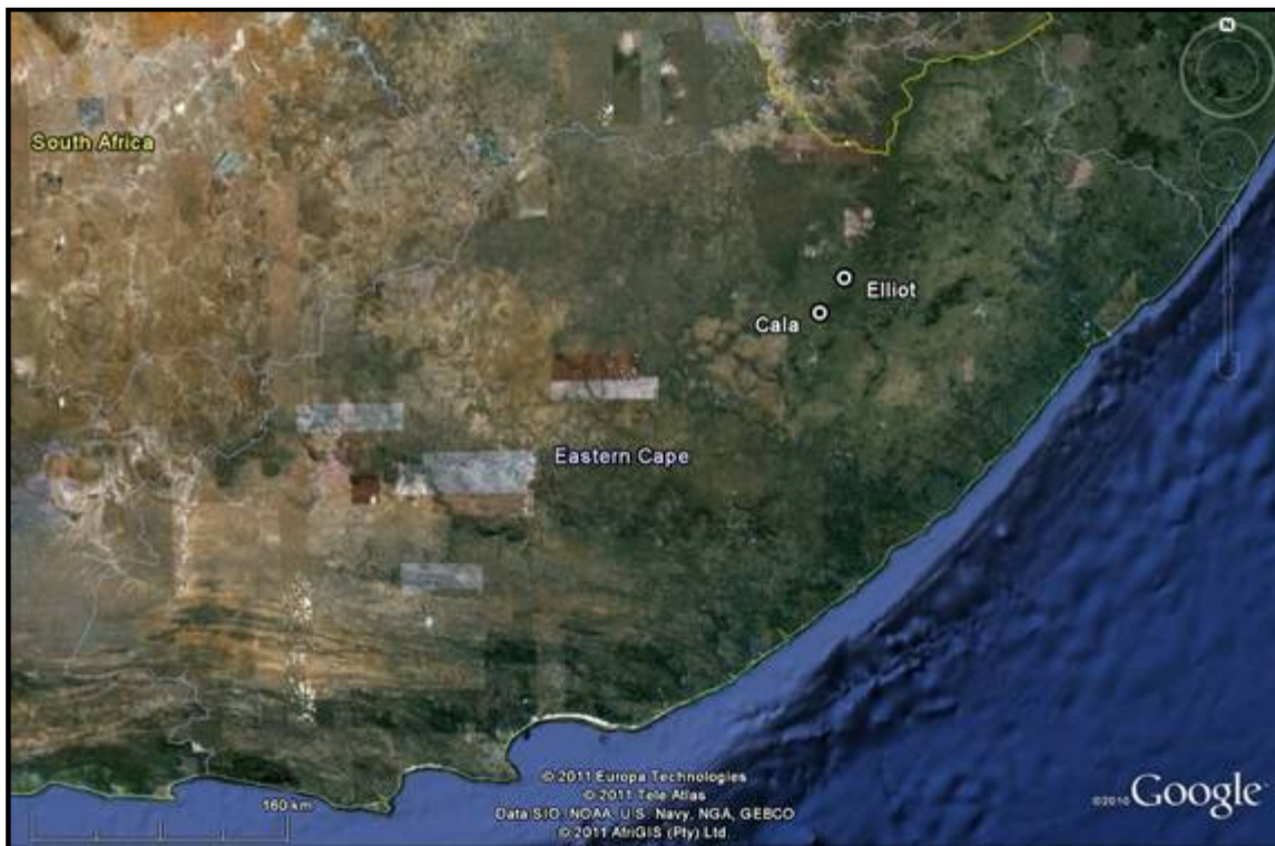
Figure 1: Localities of Cala and Elliot in the Eastern Cape

The proposed project, the Expansion of the Cala Landfill Site, Closure of the Elliot Landfill Site and Establishment of a Waste Transfer Station at Each Site (Eastern Cape) application focuses on the expansion of the Cala Landfill site in a south-westerly direction and the addition of a waste transfer station at the site. The Cala Landfill study site is situated approximately 1.7km north of Cala, with general site co-ordinates being S31°30'22.7"; E27°41'37.5" [1:50,000 map ref – 3127DA] and with the study site measuring 4,8ha in extent. The project also includes the application for the closure of the existing Elliot Landfill site and the development of a waste transfer station at the site. The Elliot Landfill study site is situated approximately 1.4km south-west of Elliot, with general site co-ordinates being S31°20'29.9"; E27°50'21.1" [1:50,000 map ref – 3127BD]. The Elliot Landfill study site comprises a 5,8ha surface area (Terreco 2011).