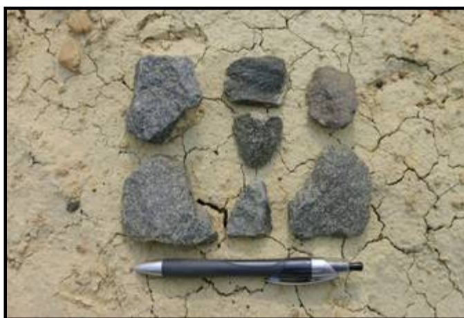
Figure 18: A selection of lithic artefacts from the Site E1 low density MSA feature