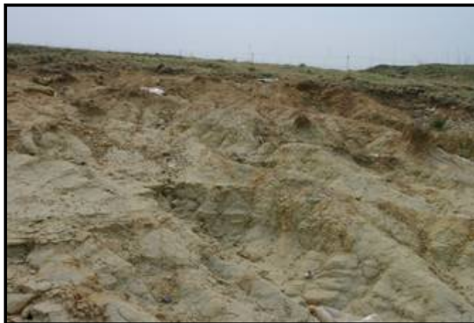
Figure 16: Close-up of a section at Site E1, with the odd in situ artefact visible