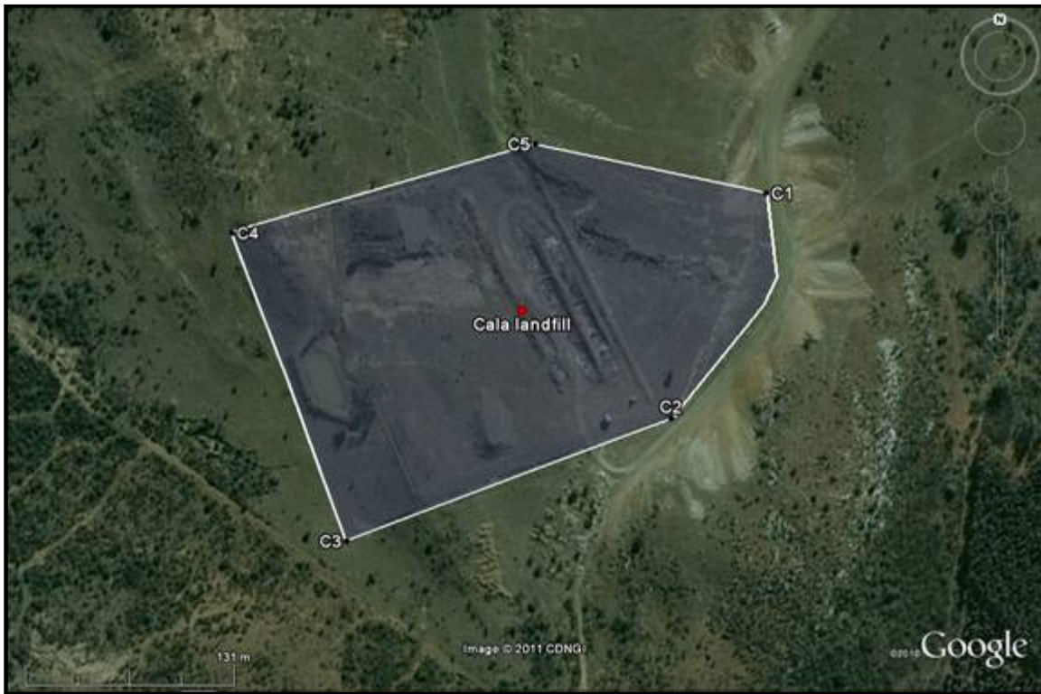
Figure 7: The Cala Landfill study site – Phase 1 AIA assessment findings

No archaeological or cultural heritage resources, as defined and protected by the NHRA 1999, were identified during the Phase 1 AIA assessment of the Cala Landfill study site. The general surface area is to a large degree already disturbed, by both dump material and excavation. The low rising rocky ridge towards the north-east of the site yielded raw material of a sub-standard quality for Stone Age artefact production. Surface anthropic sterility was echoed by limited sub-surface information. The currently used cell is full; no sub-surface sections were exposed for purposes of inspection. However, sub-surface dump material characterize much of the general landfill site, but no archaeological material were identified in dump mounds, either in mounds inferred to be from the site itself or from secondary locations.