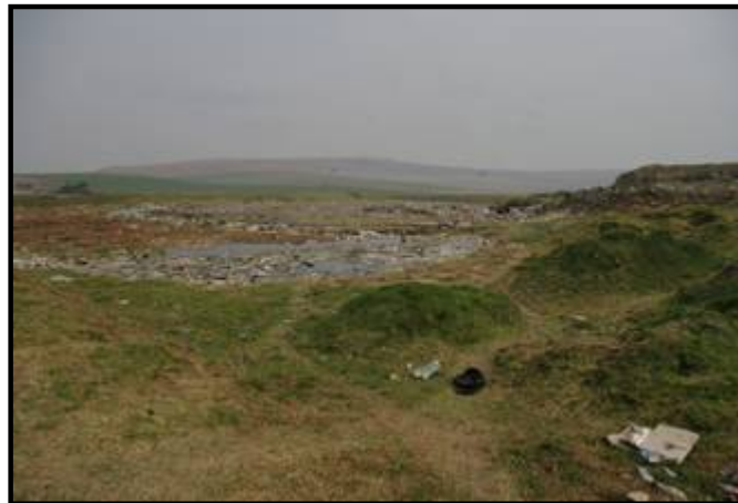
Figure 12: General view of the Elliot Landfill study site

Site E1 (S31°20'32.0"; E27°50'18.2"), a low density MSA feature, is ascribed a SAHRA Low Significance and a Generally Protected C Field Rating . The site is situated along the south-western boundary of the Elliot Landfill study site. It is recommended that Site E1 be destroyed in lieu of the Elliot Landfill (S31°20'29.9"; E27°50'21.1") development, under a SAHRA Site Destruction Permit , to ensure legal impact on, or destruction of Site E1. The SAHRA Site Destruction Permit should be applied for by the project proponent, the Sakhisizwe Local Municipality, and the permit application submitted to the SAHRA APM Unit for approval.