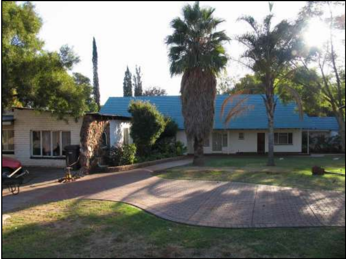
Fig. 2. The house as viewed from the eastern side.