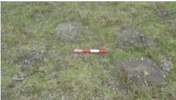
Fig. 33. Close-up of mole hills.