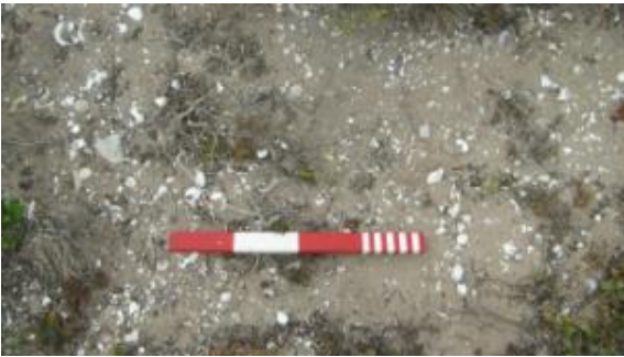
Fig. 7. Shell midden scatter in close proximity of the existing power station.