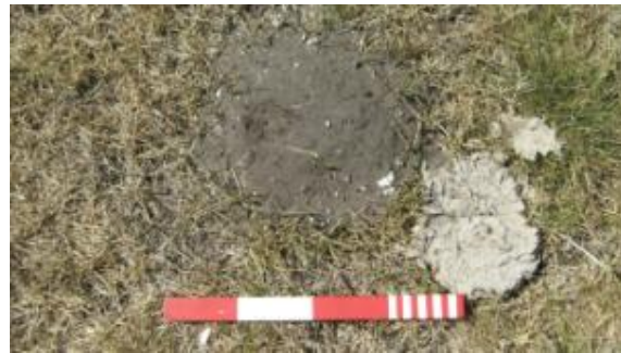
Fig. 22. Close-up of mole hill with exposed fragmented shell.

BP20 (Site 6) [34.01.703S; 25.26.033E] consists of a relative large accumulation of shell exposed in the farm road. The exposed area is approximately 3 m x 5 m, although extends another 30 m north, observed within exposed open areas. The accumulation of fragmentary shell remains is between 15-30 m below the current surface level (Figs 26-27). This marine shell scatter also extends east-west along the farm road until BP21 [34.01.700S; 25.25.790E], which can be observed in the exposed areas in the farm road (Fig. 28).