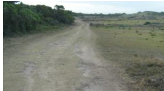
Fig. 28. Exposed shell can be observed from BP21 west along the farm road.