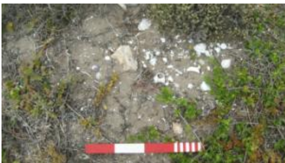
Fig. 11. Shell scatter exposed in a small open area.