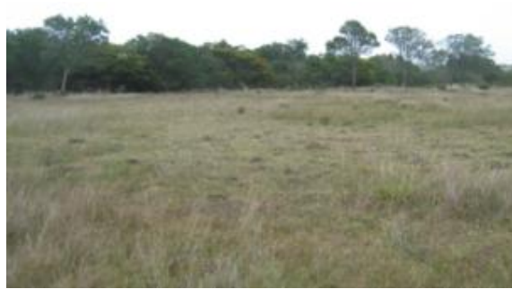
Fig. 30. View of the landscape.