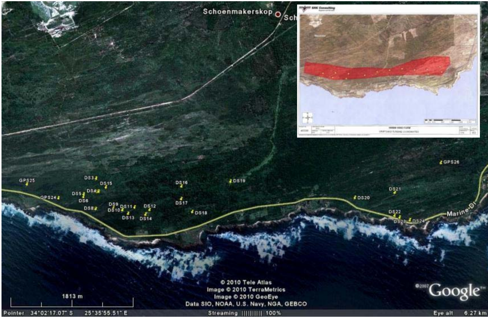
Map 3. Aerial view of Site Alternative 1, Driftsands indicating GPS readings and sites. Red-surface shell scatters; Blue-shell midden scatters; Green-calcrete dune (Insert map courtesy of SRK Consulting indicating the proposed areas for the construction of the wind turbines).