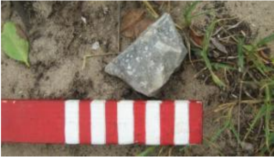
Fig. 19. Quartzite core on the surface of BP9.