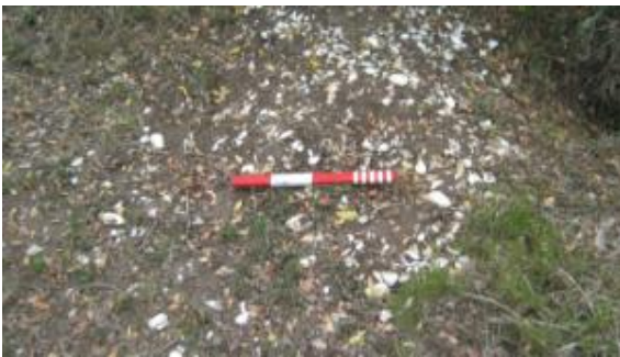
Fig. 31. Burrowed out shell scatter.