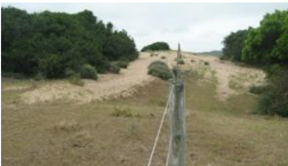
Fig. 17. The exposed dune at BP9 showing the fence running through the area.

BP19 (Site 5) [34.01.613S; 25.26.924E] is a shell scatter that has been exposed in the farm road. The farm road is approximately between 20-30 cm lower than the surface vegetation and the depth of the marine shell scatter can be observed (Fig. 25).