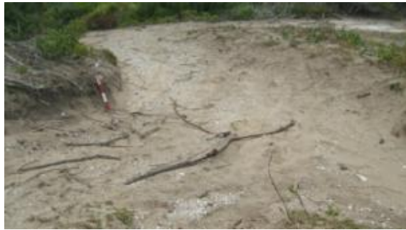
Fig. 8. Profile of the shell midden scatter in close proximity of the existing power station.