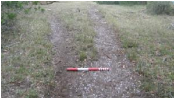
Fig. 34. Exposed shell in farm road.