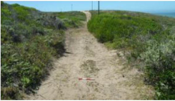
Fig. 5. Shell scatter exposed in one service road, with the telephone poles in the background.