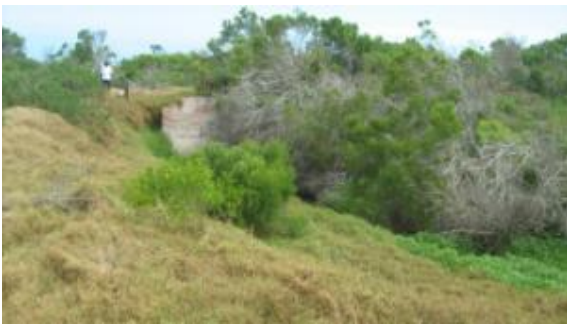
Fig. 9. View of the construction surrounding the watercourse and pipeline.