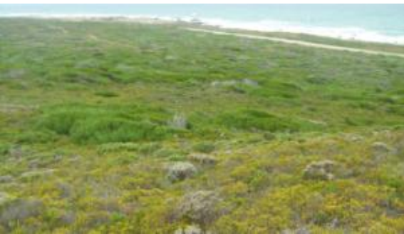
Fig. 3. Eastern view of the low dune vegetation overlooking the close proximity of the coast.