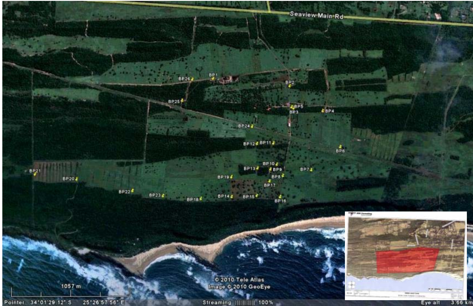
Map 4. Aerial view of Site Alternative 2, Bushy Park Farm, indicating GPS readings and sites. Red-surface shell scatters; Blue shell midden scatters. The proposed area for the construction of the wind turbines is highlighted by the green circle (Insert map courtesy of SRK Consulting indicating the proposed areas for the construction of the wind turbines).