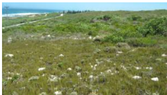
Fig. 4. Western view of the low dune vegetation overlooking the close proximity of the coast.