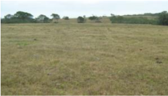
Fig. 29. View of the landscape.