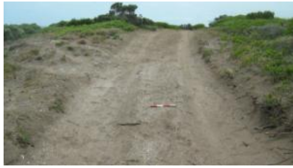
Fig. 6. Shell scatter and midden exposed in a different service road.