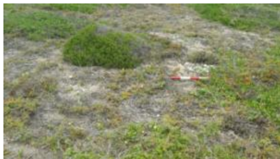
Fig. 12. Exposed shell scatter indicating the possibility of more shell underlying the surface vegetation.