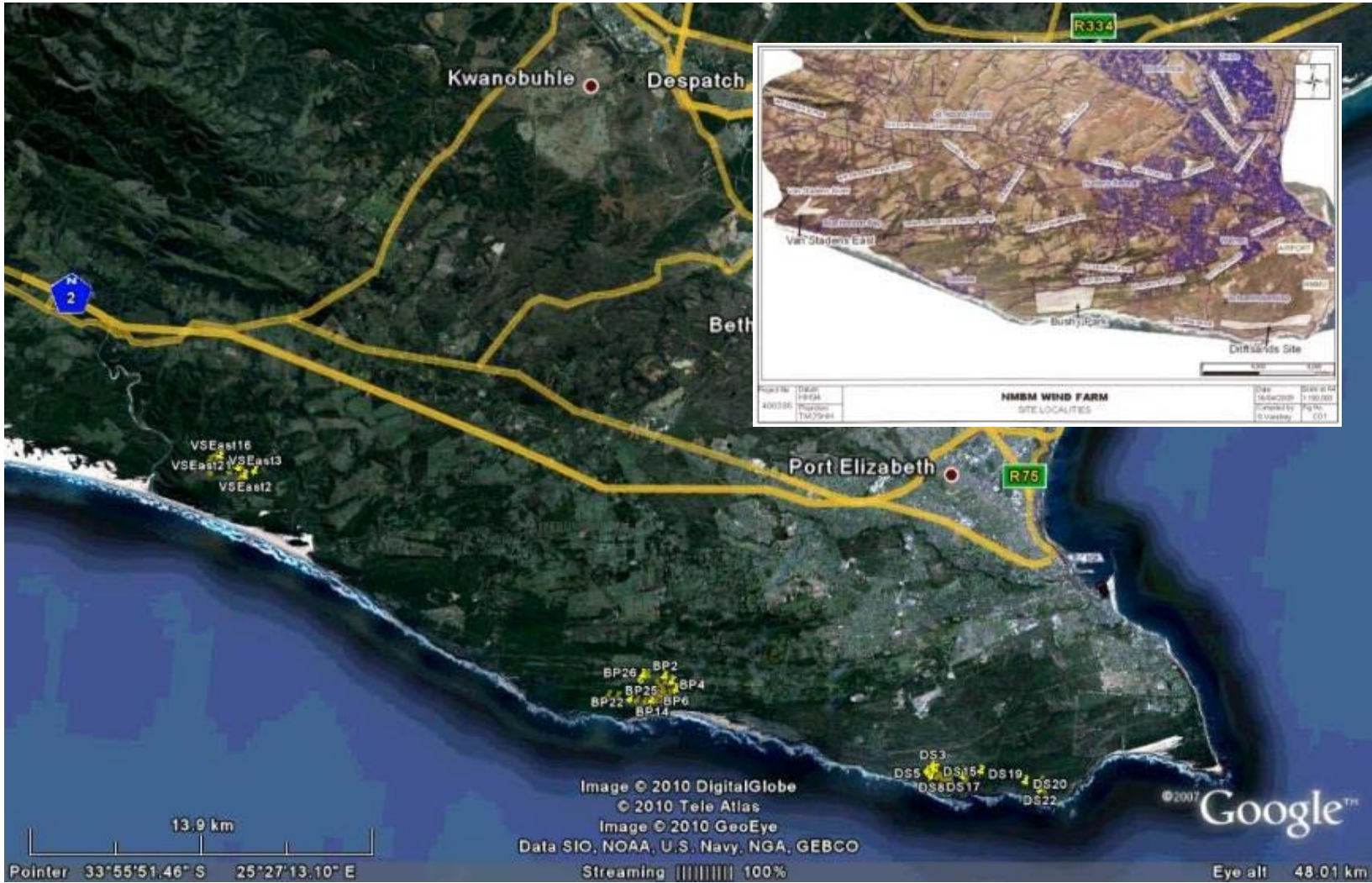
Map 2. Aerial photographs indicating the areas proposed for Site Alternatives 1-3 (Insert map courtesy of SRK Consulting).