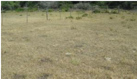
Fig. 21. View of the mole hills at BP18.