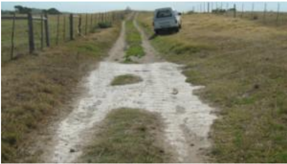
Fig. 25. Hardened clay area exposed in farm road containing shell fragments.