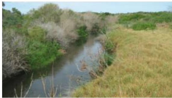
Fig. 10. View of the watercourse running north to south through the proposed area.