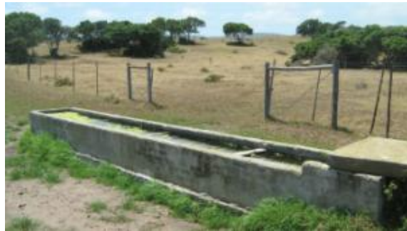
Fig. 16. Grazing lands, fences and a drinking trough around the area of BP6.

There are sporadic occurrences of churned up mole hills between BP14 and BP15 that expose marine shell remains about 8 m running from the fence running parallel to the fence (east-west). Similarly, sporadic occurrences of exposed shell remains in churned up mole hills occurs between BP14 and BP18 (Site 4) [34.01.732S; 25.26.761E] (Figs 23-24).