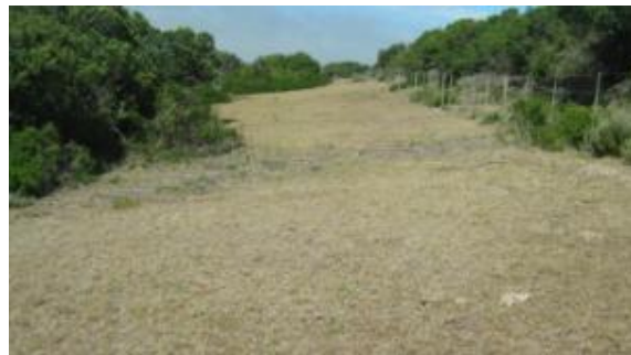
Fig. 24. View to the east showing extent of small open areas with exposed shell remains.