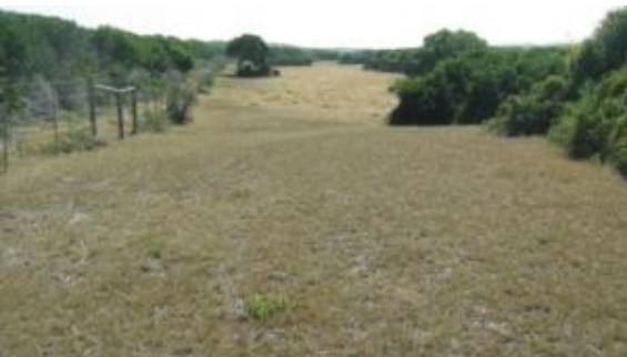
Fig. 23. View to the west showing extent small open areas with exposed shell remains.

BP20 (Site 6) [34.01.703S; 25.26.033E] consists of a relative large accumulation of shell exposed in the farm road. The exposed area is approximately 3 m x 5 m, although extends another 30 m north, observed within exposed open areas. The accumulation of fragmentary shell remains is between 15-30 m below the current surface level (Figs 26-27). This marine shell scatter also extends east-west along the farm road until BP21 [34.01.700S; 25.25.790E], which can be observed in the exposed areas in the farm road (Fig. 28).