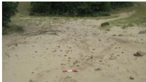
Fig. 18. View of the eastern side of the fence showing the extent of the shell scatter.