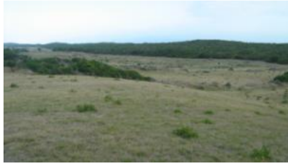
Fig. 14. Grazing lands and dense impenetrable vegetation.