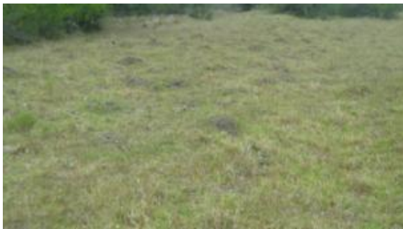
Fig. 32. View of churned up mole hills with exposed shell scatter.