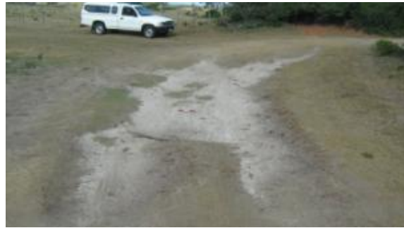
Fig. 26. Exposed shell at BP21.