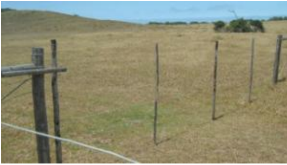
Fig. 13. Grazing lands and fences.