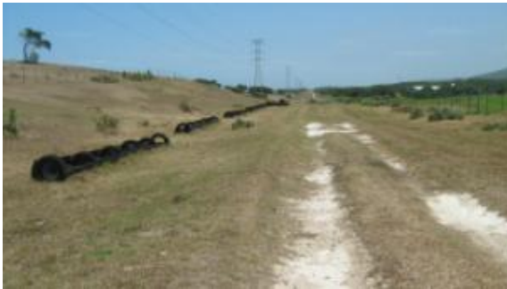
Fig. 15. Farm roads and powerlines.