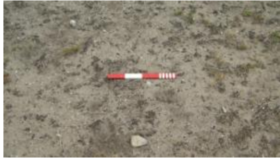
Fig. 20. Possible knapping area at BP10.