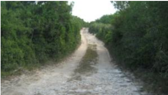
Fig. 27. Hardened clay and exposed shell remains on the road that leads south to the beach.