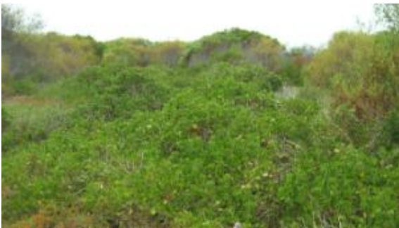
Fig. 1. View into the dense impenetrable alien vegetation.

Most of the proposed area for the construction of the wind turbines is covered in dense impenetrable alien vegetation and low indigenous dune vegetation (Figs 1-4). The proposed area has been heavily disturbed by the construction of power lines and telephone lines, a signal tower, service roads and the Fynbos hiking trail (Figs 5-8). The construction of a prominent watercourse and pipeline runs north to south through the middle of the proposed area (DS19, Map 4). Informal dumping occurs around the pipeline area and sporadically within the proposed area, the grass is very dense around this area making the visibility of archaeological remains difficult. The surface of this area is uneven, probably caused by bulldozing activities during the construction of the pipeline and watercourse (Figs 9-10). The planting of Rooikrans has also contributed to the disturbance of the underlying shell scatters and shell middens. Exposed shell scatters occur within previously disturbed areas and where vegetation is sparsely covered (Figs 11-12). It is likely that shell scatters and middens are covered by the prevalent alien vegetation that occurs over most of the proposed area.