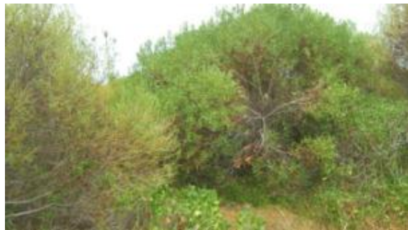
Fig. 2. View into the dense vegetation that covers most of the proposed area.