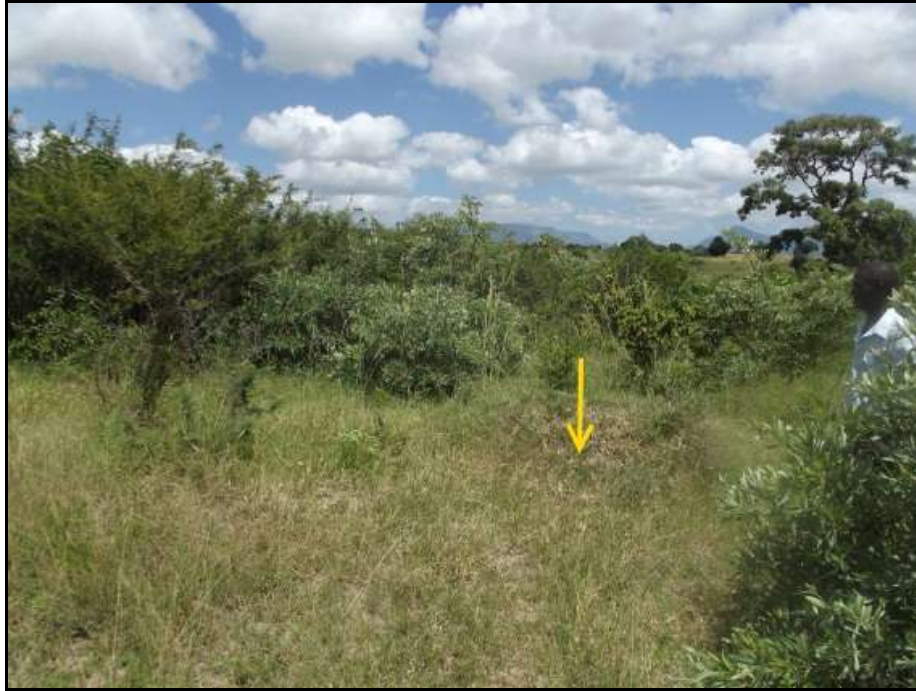
Fig. 3. Site A 2. Arrow indicates where a dwelling used to be. On the right is informant Mr Rexon Mashile.