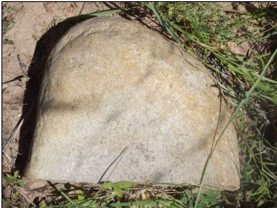
Fig. 2. Site A 1. A section of a lower grinder.