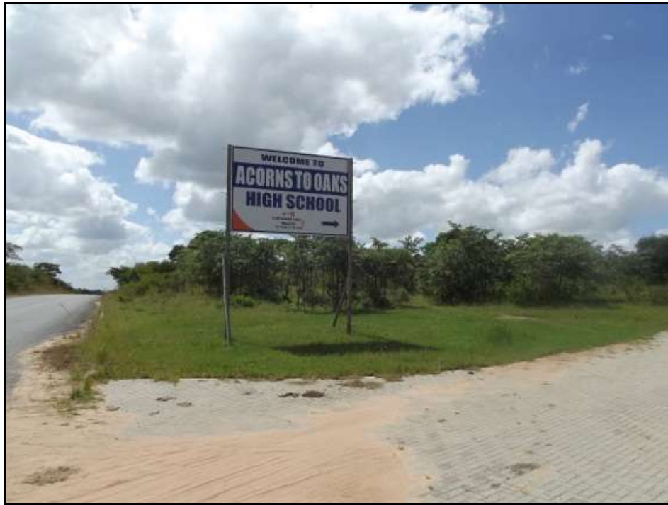
Fig. 1. The entrance to the planned Acorns to Oaks School.