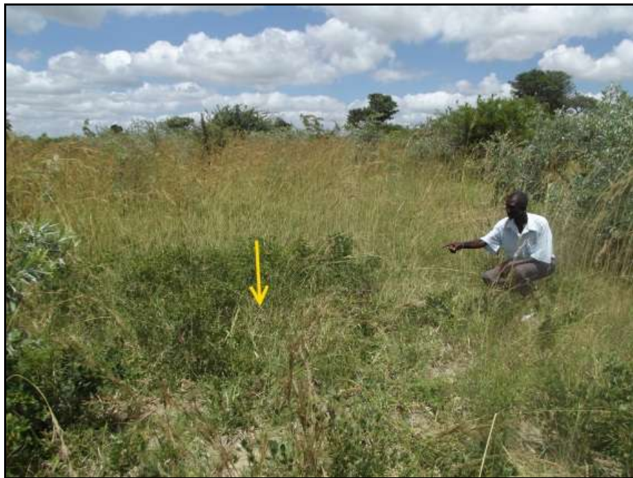
Fig. 4. Site A 3. Arrow indicates area where a dwelling used to be, informant Mr Rexon Mashile also points out the location.