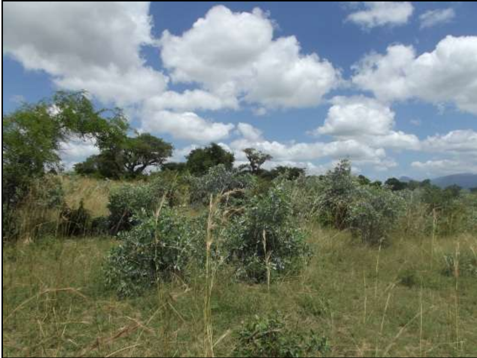
Fig.7. General photo of area taken in western direction.