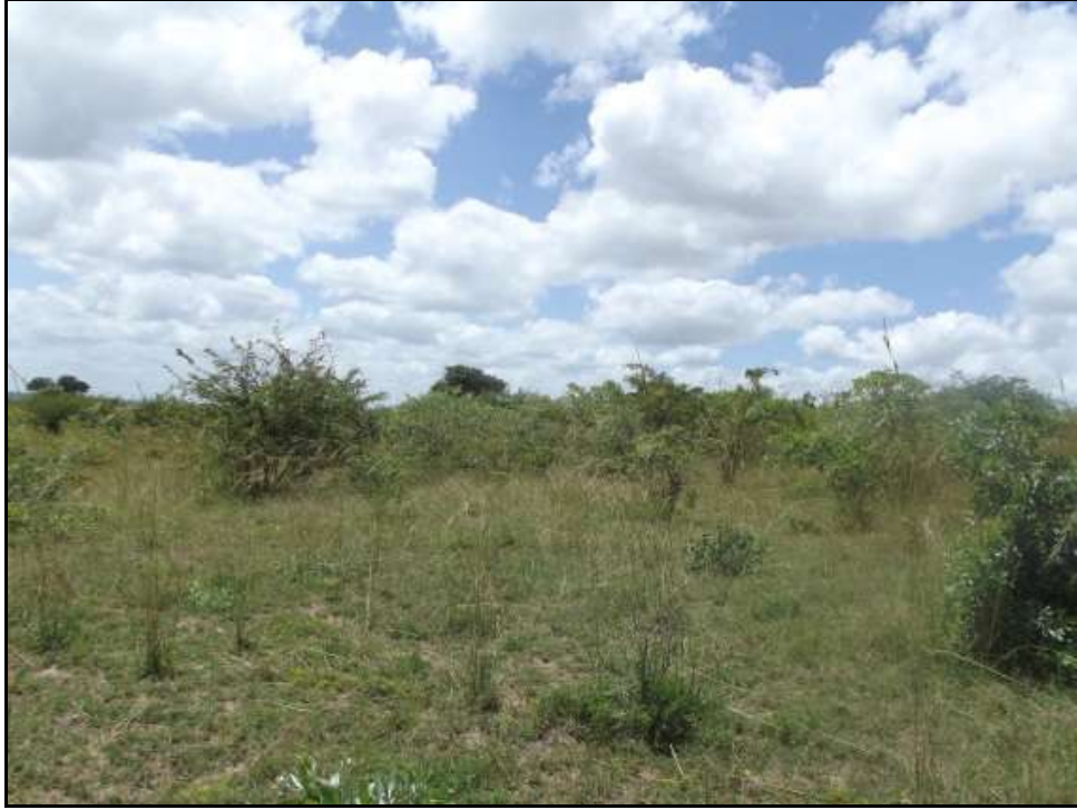
Fig. 5. A general photo of the area, taken in eastern direction.