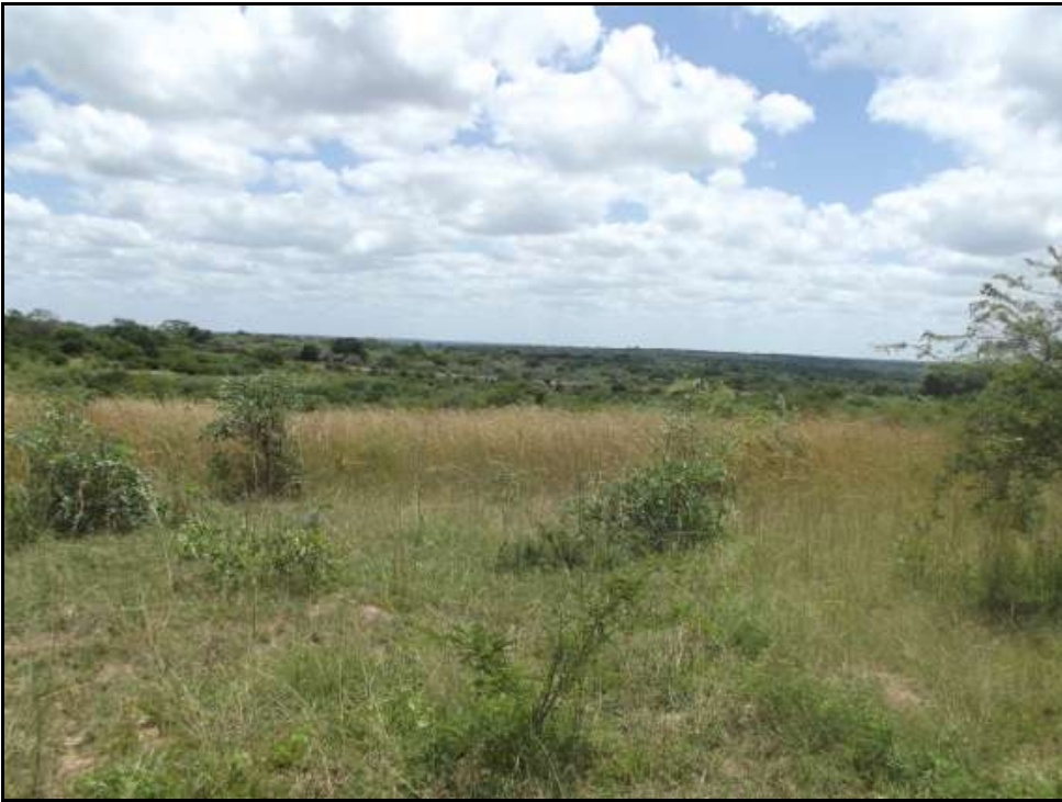
Fig. 6. General photo of the area photo taken in northern direction.