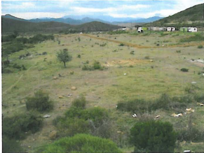
Figure 3. View of the site facing west