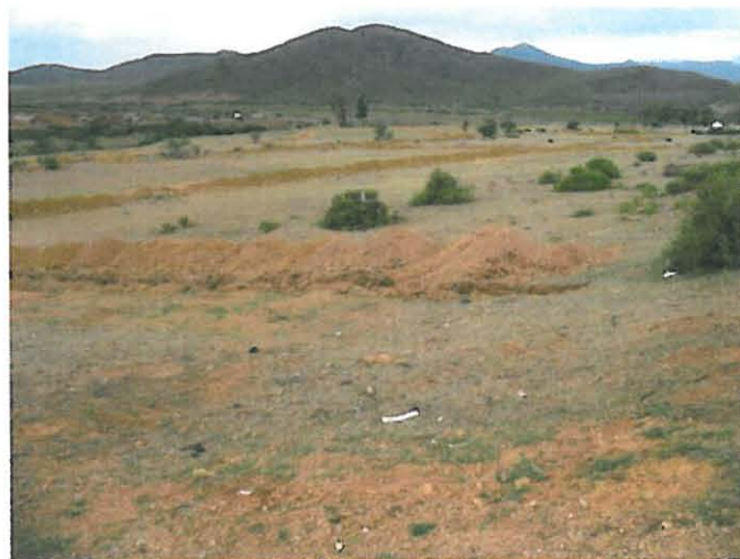
Figure 4. View of the site facing south west