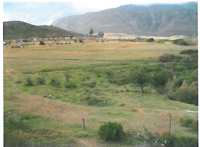
Figure 6. View of the site facing east