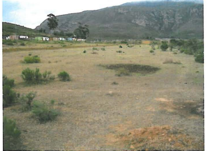
Figure 5. View of the site facing east