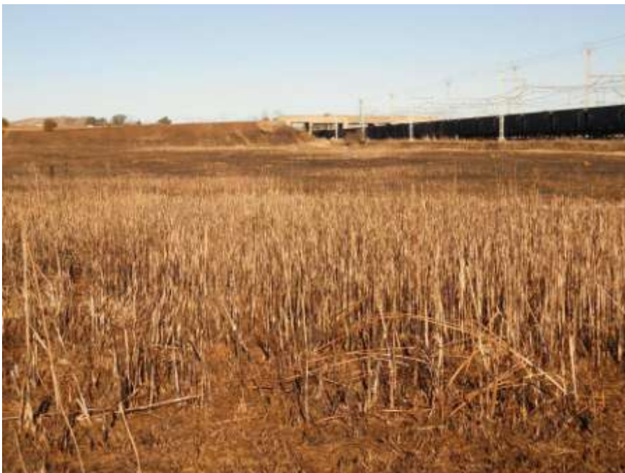
Fig 2. Railway line through the terrain.