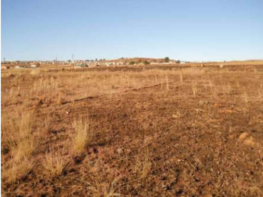
Fig 1. General view of the terrain – note Siyathemba in background.