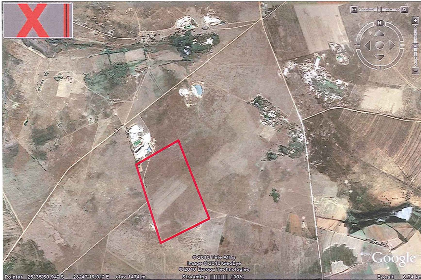
Figure 3. Google Earth Image of site under investigation. One can clearly see the impact of maize farming in general area.