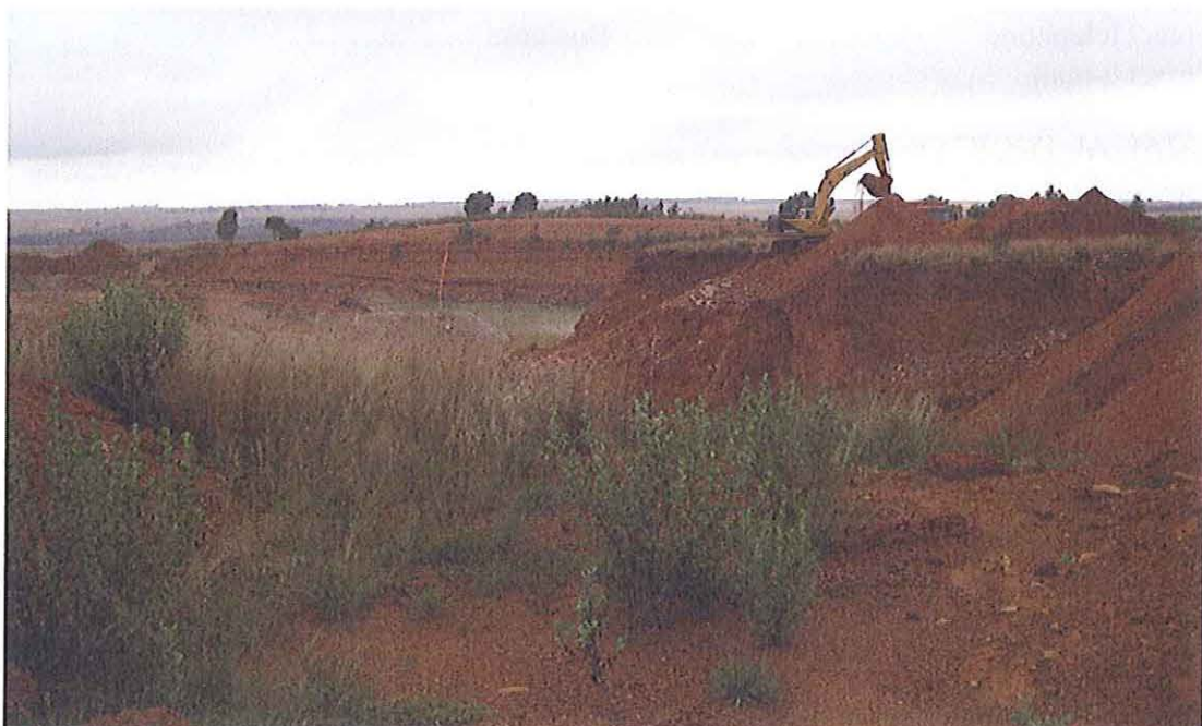
Figure 2. Activities on adjacent property (To the north)