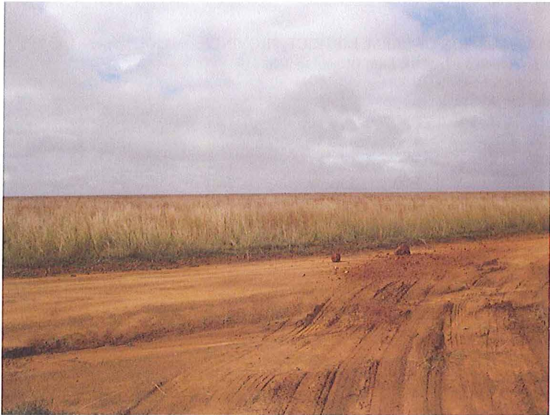
Figure 1. Typical aspect of the site that was investigated.