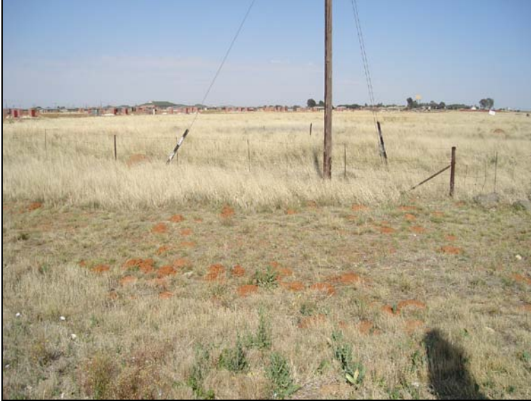
Fig.1 Point A. View of the proposed area at the S117 turn-off to Edenburg facing along the N8 road to Kimberley.