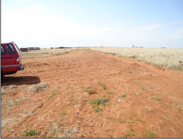
Fig.3 The area of developments at Point C. Note the graded roads.