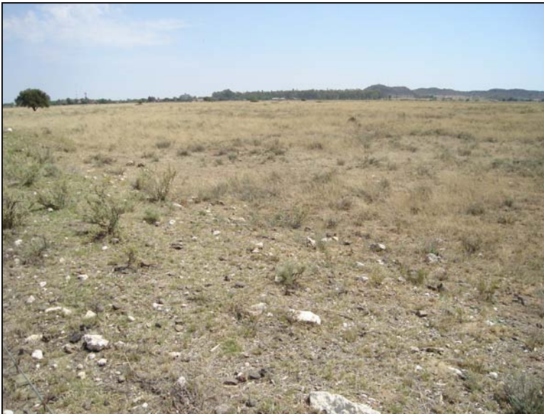
Fig.4 The region of development at Point D facing towards the residential area of Petrusburg.