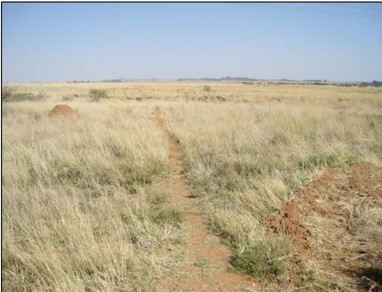
Fig.2 View of the area from Point B.