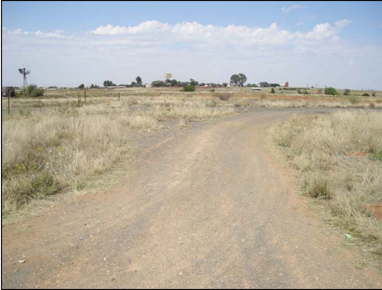
Fig.5 View from Point E towards Bolokanang, Petrusburg.