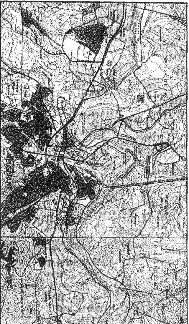
Fig. 1 Location of the study area to the north of Nelspruit.