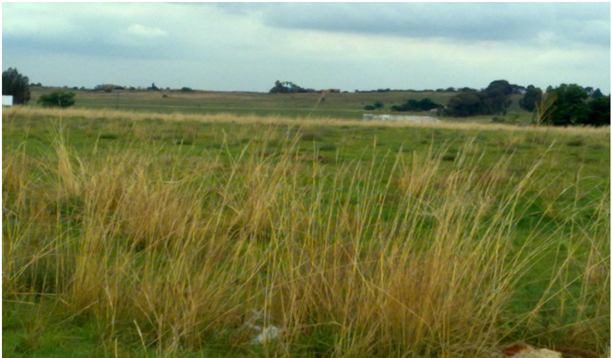
Figure 4: View of the area from the east of the proposed area, showing the manifestation of abundant grass.