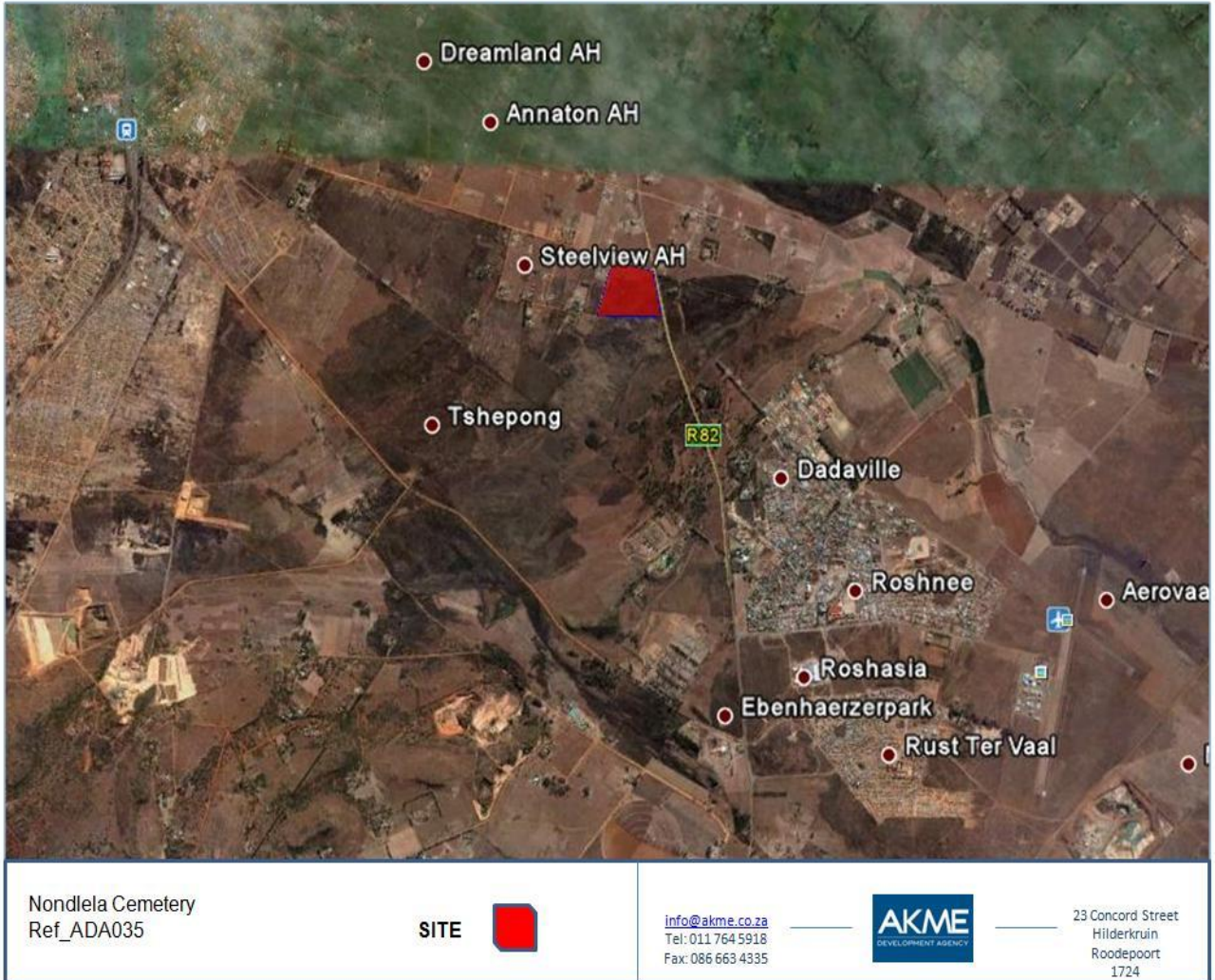
Figure 1: Location of Study Area