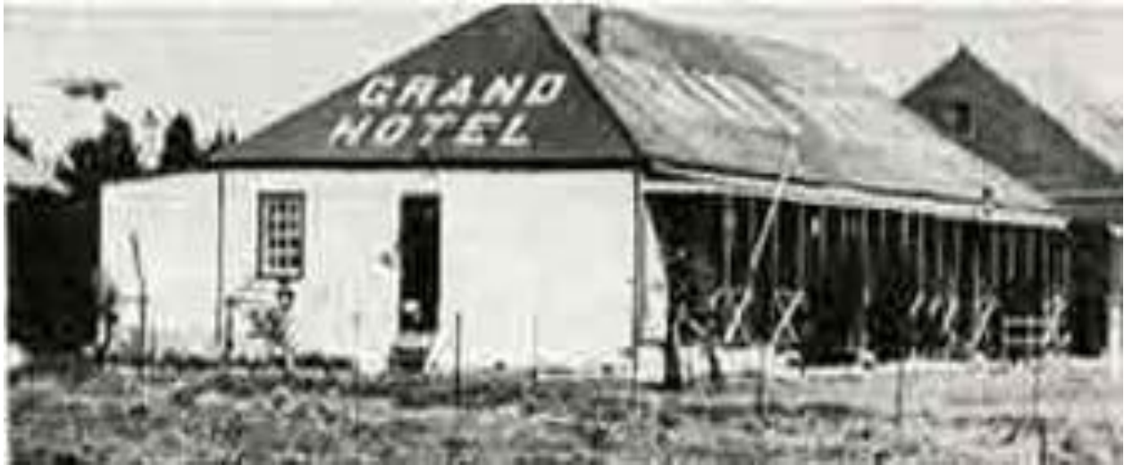
Picture 8: The first hotel built in Vereeniging ... photographed in 1894.