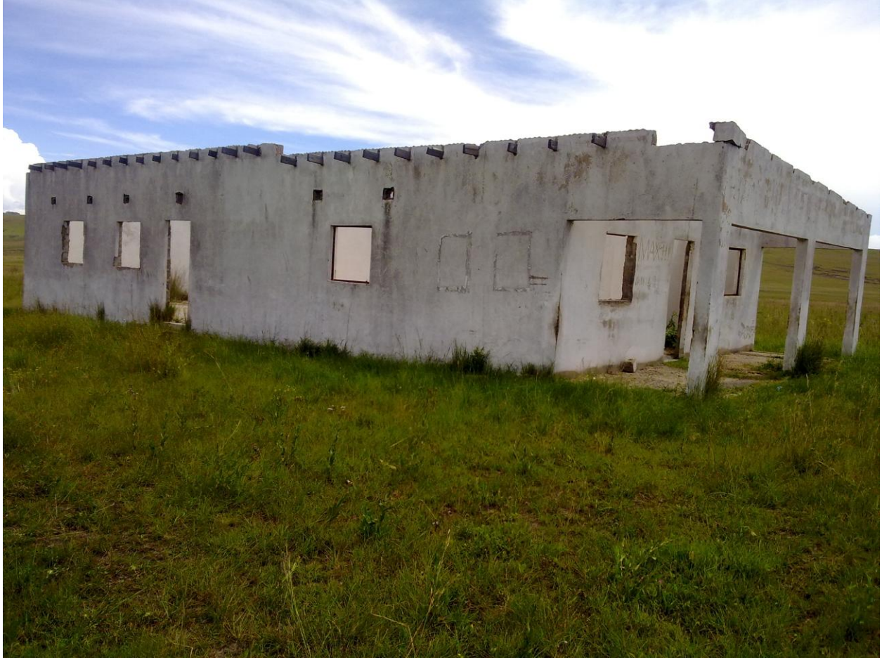
Figure 2: An overview of a structure and association foundation. This dilapidated structure is without roof and in a general good state of repair (or completion). Elements of original joinery are still intact. Adaptive reuse of the structure is possible and encouraged. This structure appears to be a recent phenomenon and as such is not protected by the National Heritage Resources Act (Act no 25 of 1999), however it will have been protected by legislator if over 60 years of age.