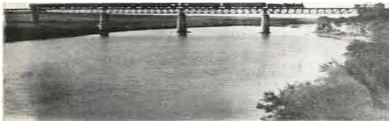
Picture 7: The funeral train, crossing the Vaal River bridge at Vereeniging, carried President Kruger's remains back to the Transvaal after the Anglo-Boer War