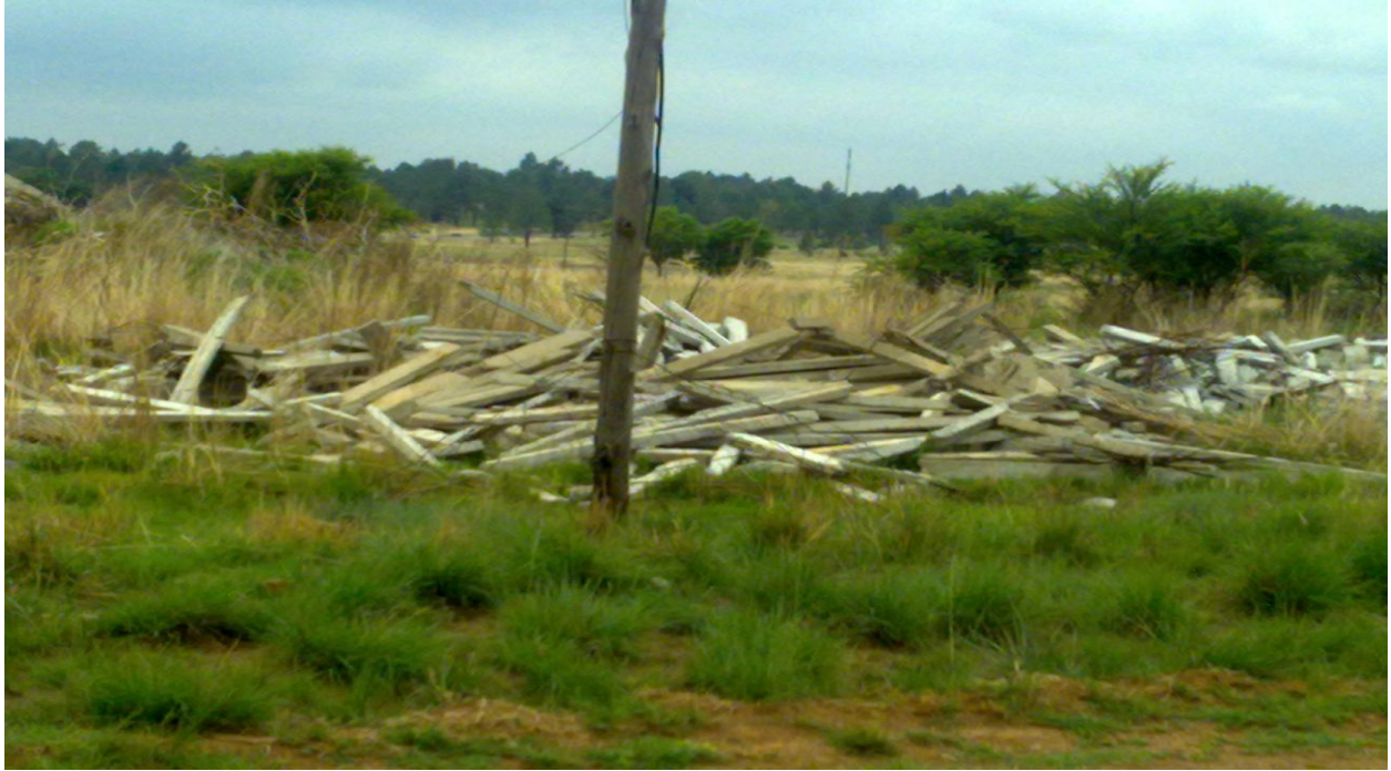
Figure 3: Panels of a Durawall dumped on Site