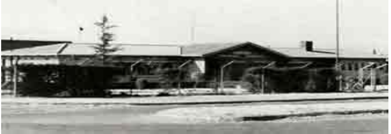
Picture 9: Scene of the Sharpeville Riot where Pan-Africanists led 69 Bantu residents to their deaths in 1961.

A skirmish developed between a Bantu demonstrator and a colonel and a sergeant of the Security force in which both policemen were pushed back into the yard. Bantu surged through the gate and under the pressure of the crowd, the security fence was bent back. Simultaneously, stones rained down on the police. Two shots were fired from the crowd, and although no order to fire was given to the police, in the deafening din the word 'shoot!' was heard by someone, then the whole line started to fire. For ten to thirty seconds shots were fired and the crowd fled ,and 169 Bantu People were killed.