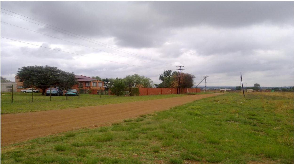
Picture 4: A gravel road bordering the study area and the residential area