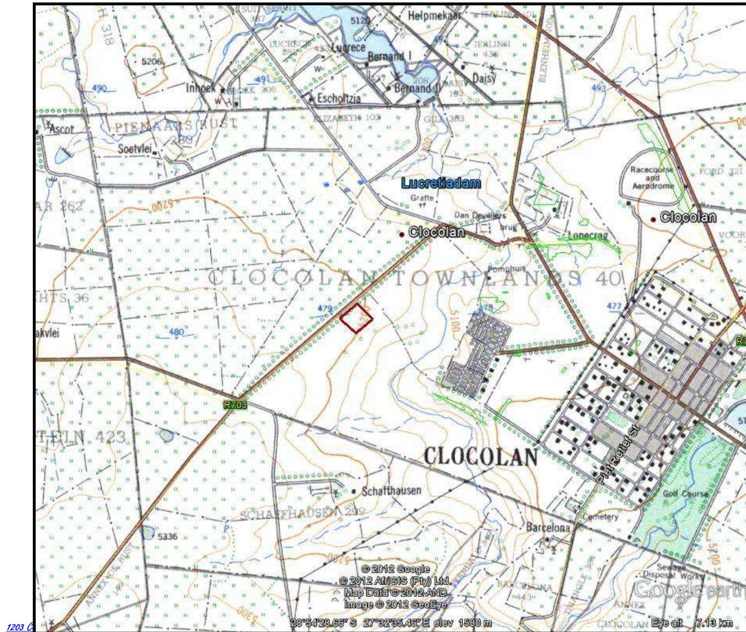
FIG. 4: LOCATION OF THE PROPOSED REITZ SOLID WASTE SITE IN 1969