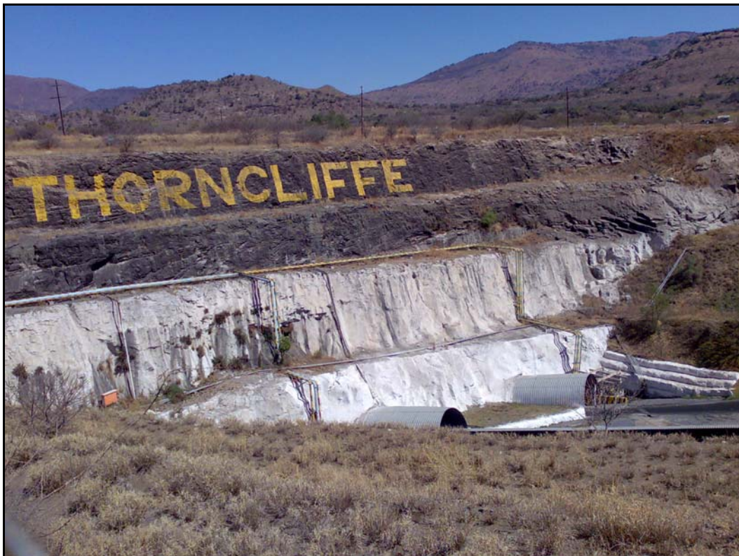
Figure 1: Entrance to the Xstrata underground mine.

The site is situated approximately 35 km south of Steelpoort and about 33 km northwest of Lydenburg in the Limpopo Province (Map 1). The project falls within the jurisdiction of the Tubatse Local Municipality (which is under the jurisdiction of the Greater Sekhukhune Municipality) of the Limpopo Province. The site is situated on portion 3 of the farm De Grootboom 373KT.