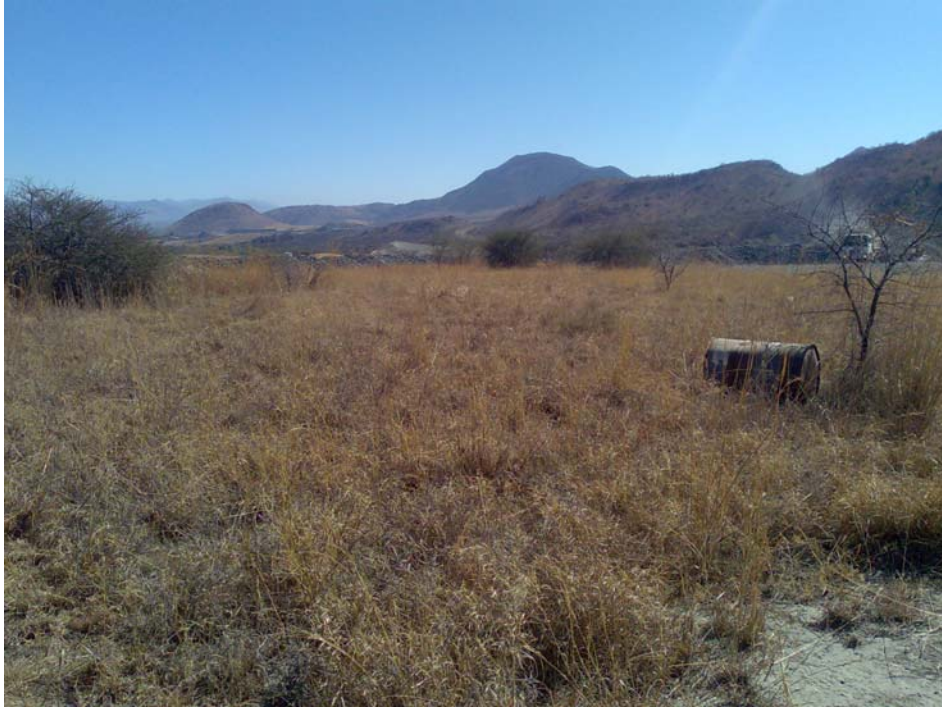
Figure 2: General disturbed condition of the area.

The site is an open flat area which has been disturbed during past mining activities. No archaeological or historical remains were recorded.