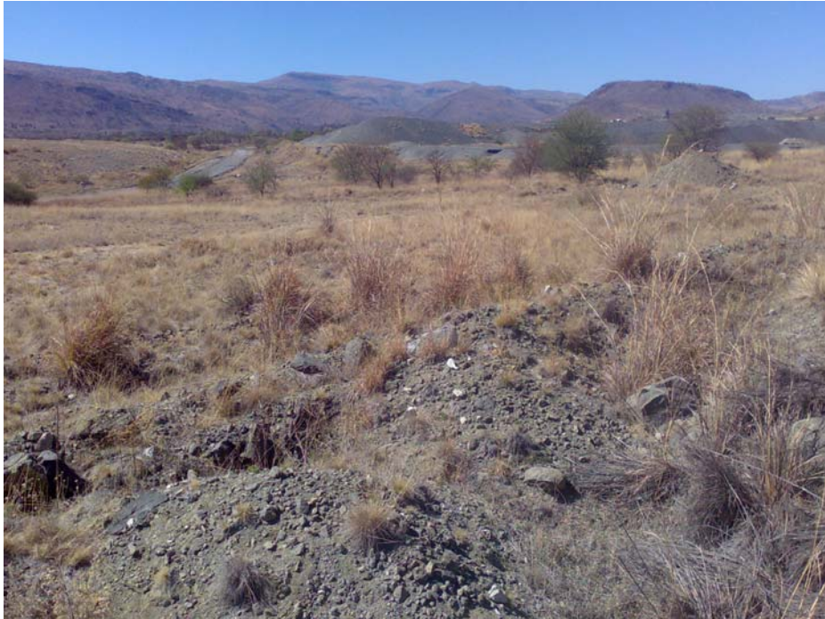
Figure 3: General disturbed condition of the area.

The site is an open area which has been almost completely backfilled. Various excavations can still be seen and a road extends the western side of the site. No archaeological or historical remains were recorded.