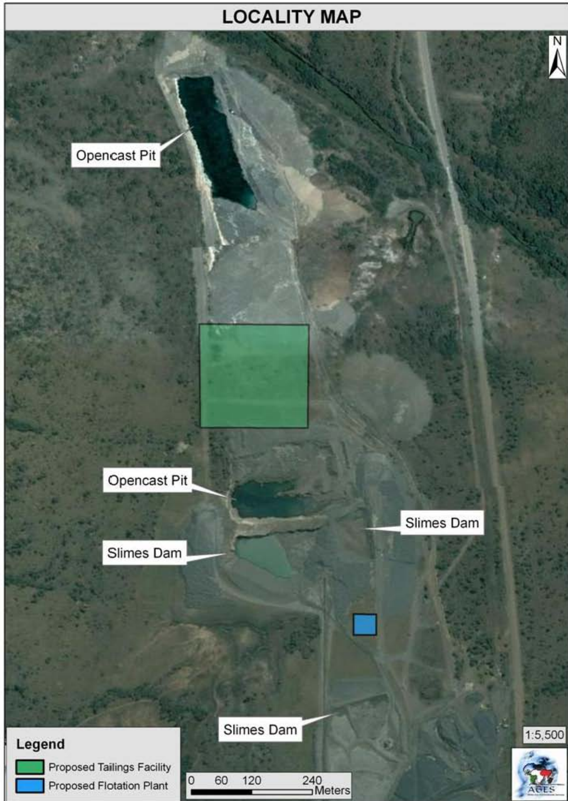
Map 2: Aerial view of the tailings facility and flotation plant.