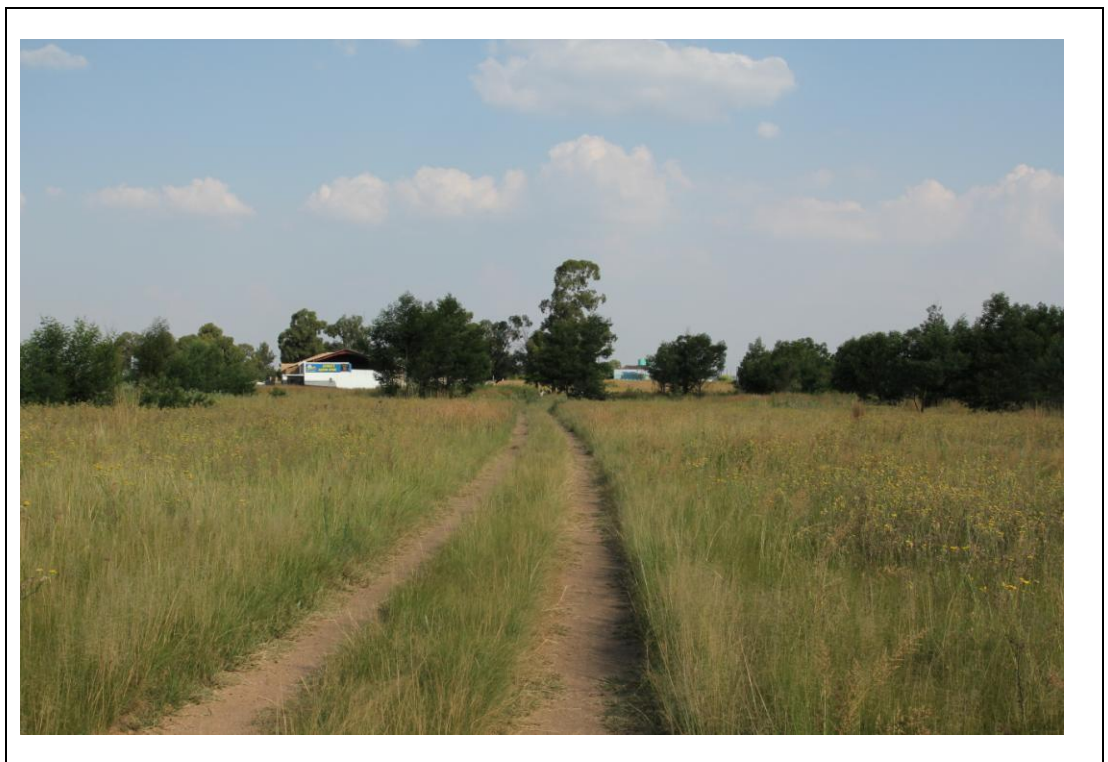
Fig. 2. View over the study area.