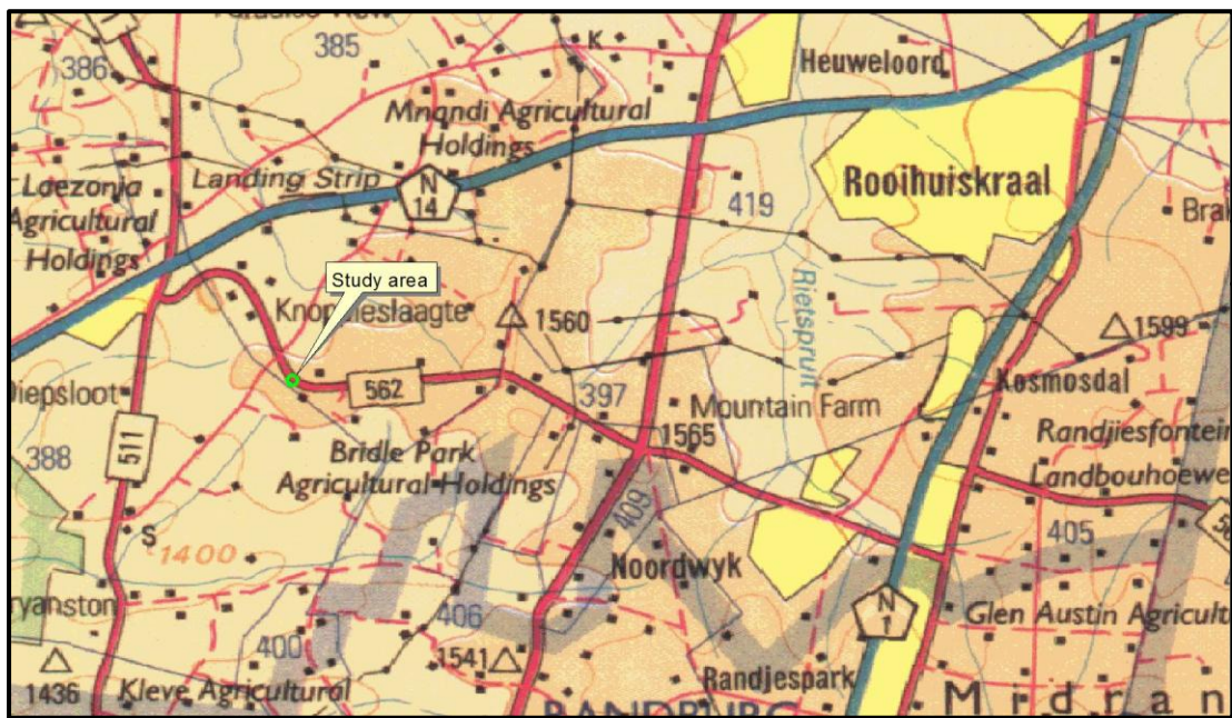
Fig. 1. Location of the study area in regional context. (Map 2528: Chief Surveyor-General)