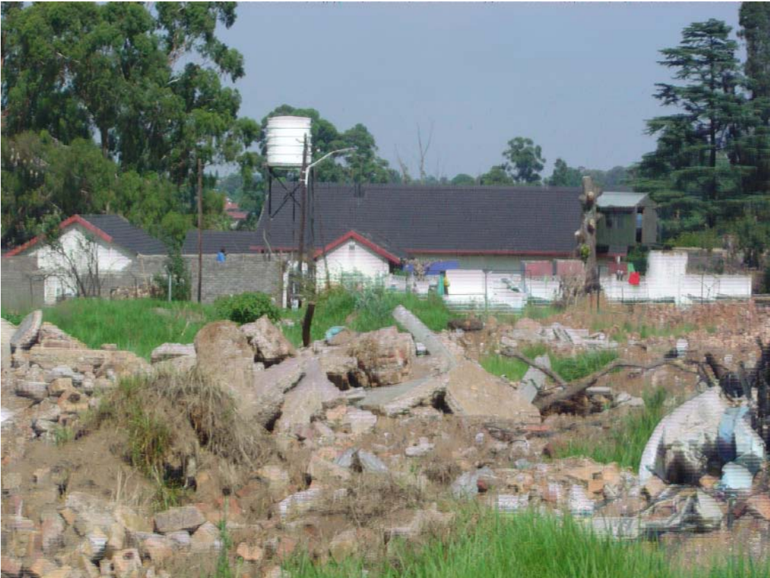
Illegal dumping on the site with the modern house in the background.