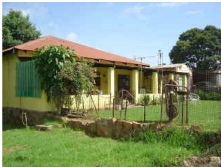
No. 1 Front view of house