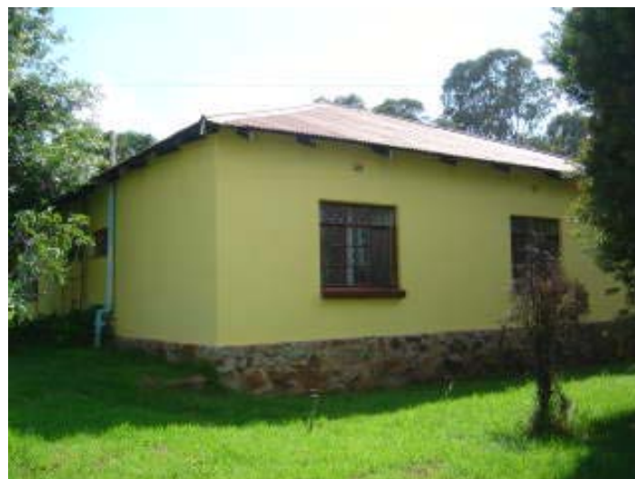
No. 2 Side view of house