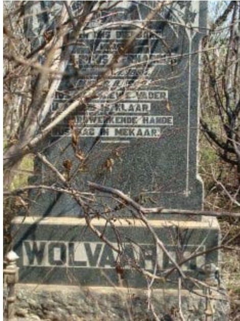
Figure 6: Grave 1 – Site 3