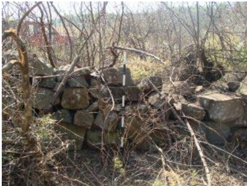
Figure 4: Site 1 – historical stone walling

The site is not significant, and the documentation done during the survey is deemed as sufficient mitigation.