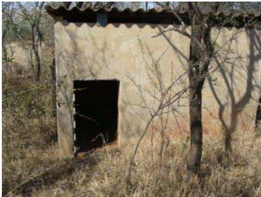
Figure 5: One of the structures on Site 2

The structures are less than 60 years of age and not significant. They might be incorporated into the development. It is located at S 25.92040 & E 27.54535.