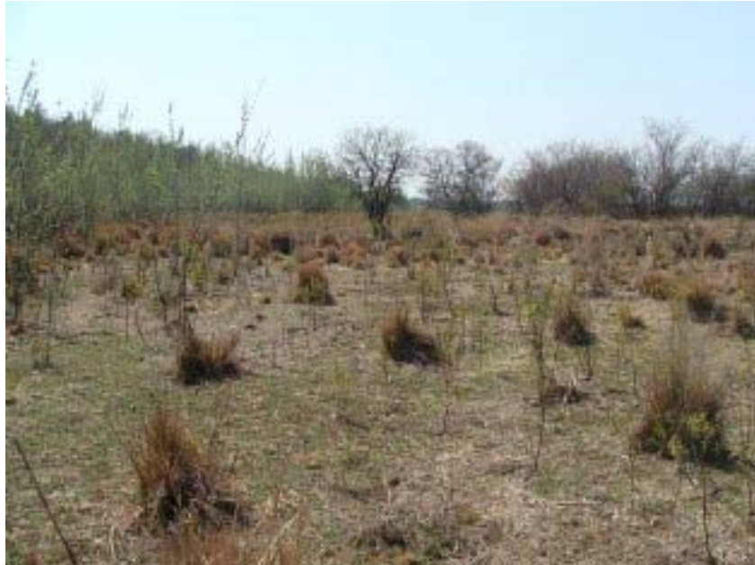
Figure 3: Another view of the survey area