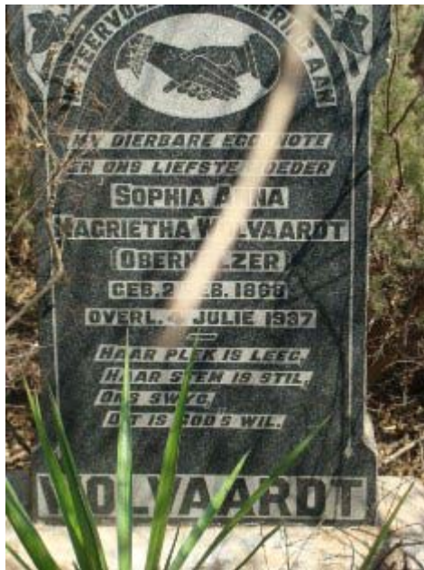
Figure 7: Grave 2 – Site 3