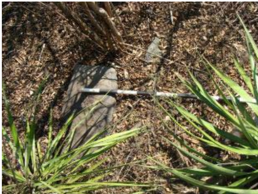
Figure 9: Grave 4 – Site 3