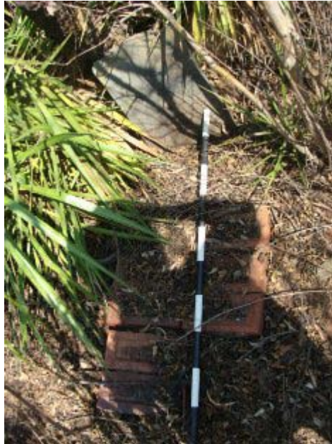
Figure 8: Grave 3 – Site 3