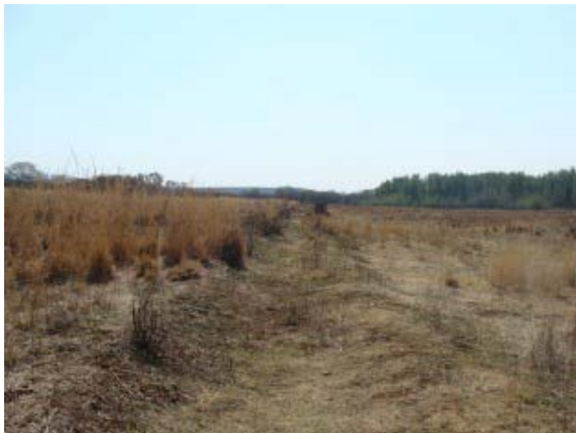
Figure 2: General view of the survey area