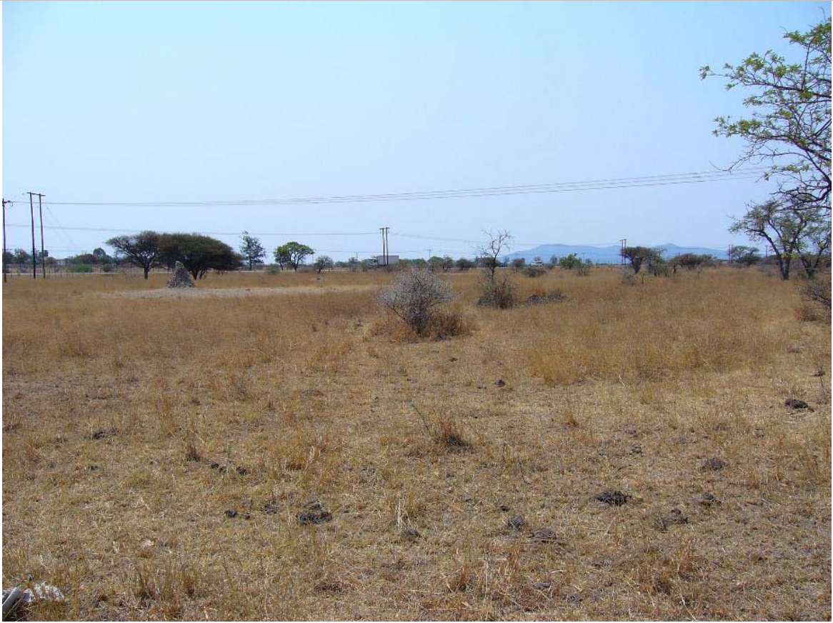
Fig. 1 General view of area