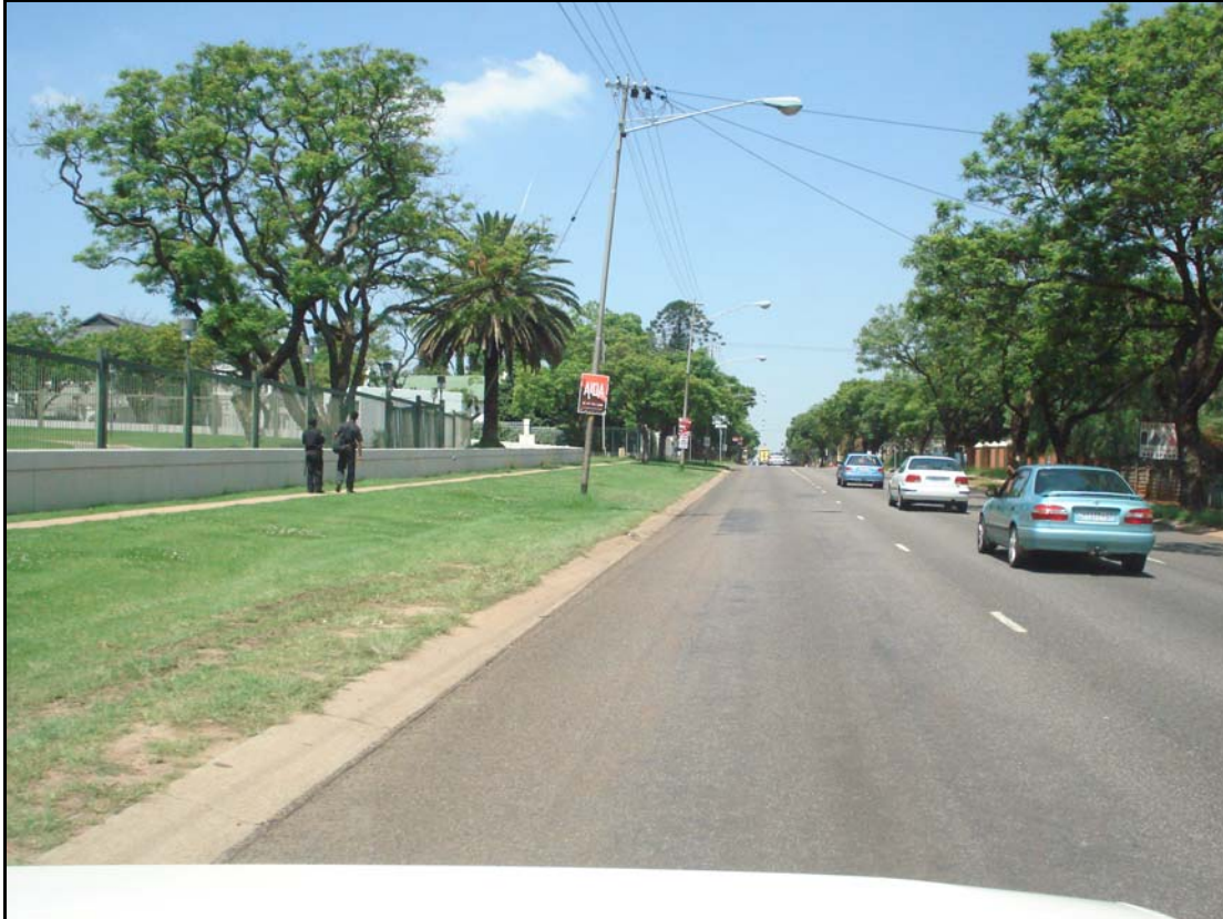
Figure 3: Road serve: Schoeman Street