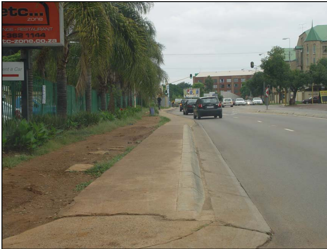
Figure 2: State of the road reserve: Duncan Street.

Francois P Coetzee Upgrade of Duncan Street, Hatfield One-Way System recorded during the survey. Specifically no historical ducts or corner stones were recorded near the relevant sections of roads.