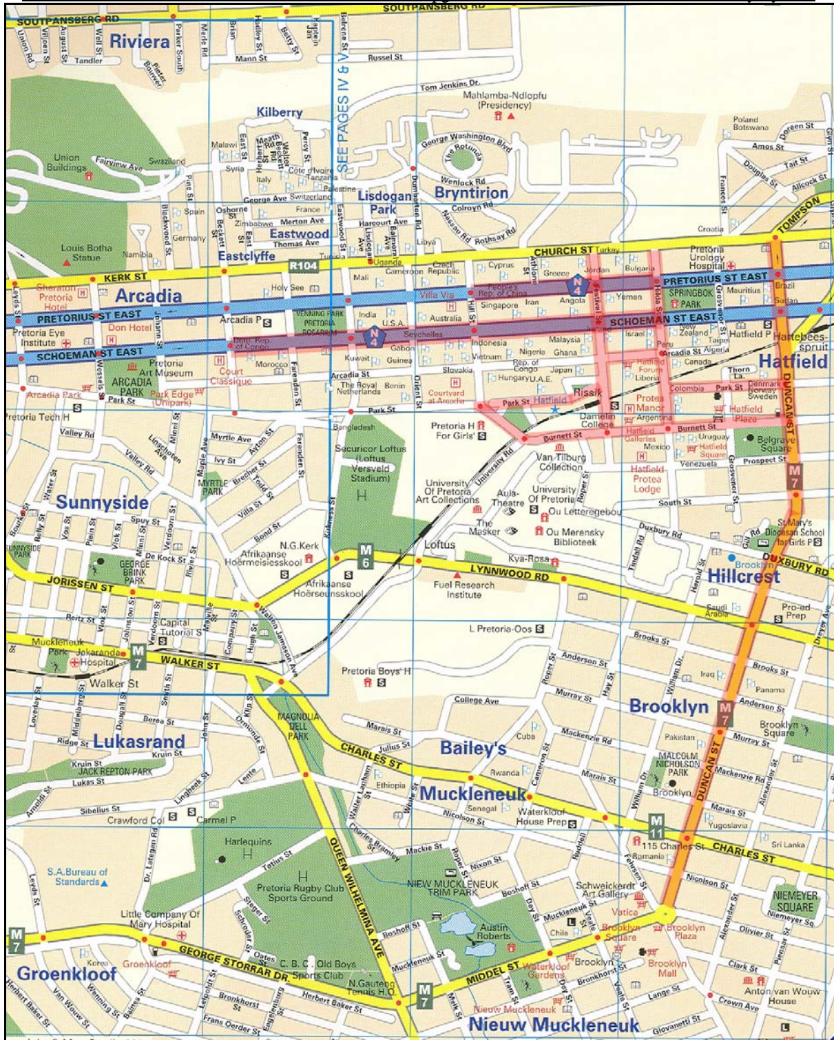
Figure 1: Map indicating the relevant road sections.