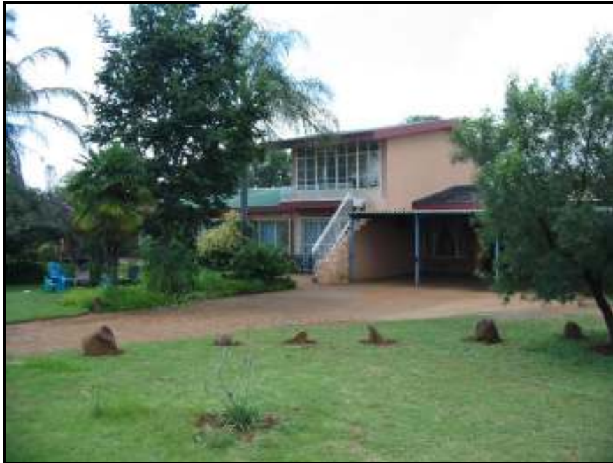
• Figure 2: Modern dwelling on site

Entrance to the site is from First Avenue in Heatherdale Agricultural Holdings, Pretoria. A Modern dwelling and associated outbuildings exist on site. Low ground visibility is present in parts of the study area due to exceptional high vegetation growth. It is foreseen that the development will consists of 60 dwelling units per hectare.