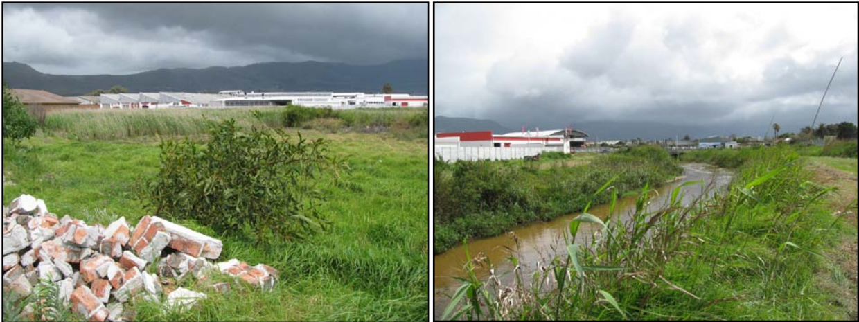
Plate 2: View of the dumped builder's rubble in the foreground, with commercial properties of Barlow World and Supa Quick on the western banks of the Keyser River and the Constantiaberg range in the background. Plate 3: The Keyser River with the mown kikuyu grass to the right, part of the Public Place.