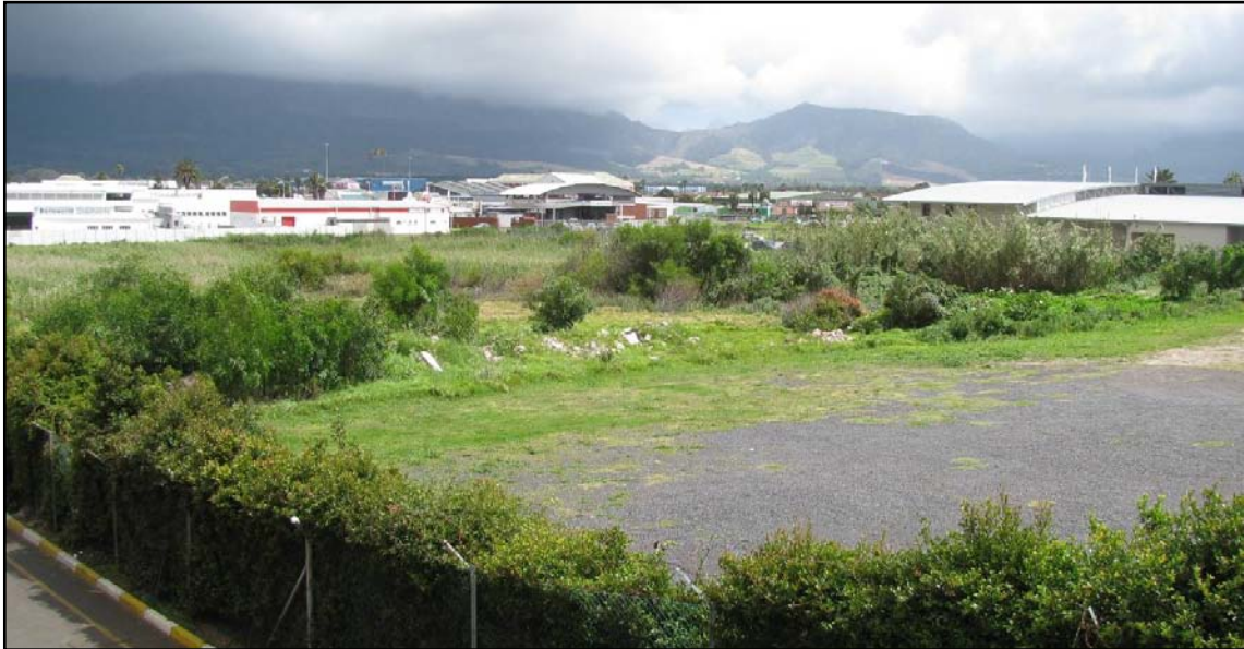
Plate 1: View of the property from the second floor of the Engedi Christian Church looking north-west. The old parking area in the foreground, and the builder's rubble and alien vegetation clearly visible.

The Keyser River is a small river that flows from the Steenberg slopes of Table Mountain to False Bay near Muizenberg, about 10 kilometres away. In past times, it would have flowed through vleis and wetlands, but over the last fifty years the area has been radically changed and what remains is a managed watercourse. The land between Erf 155306 and the river is described as Public Place in the survey diagrams for the property. The Erf adjoining the Keyser River has also been significantly transformed from its original state. Large areas are covered in kikuyu grass and aliens such as rooikrantz/port Jackson. There has been a substantial amount of dumping of builder's rubble in the eastern portion of the Erf.