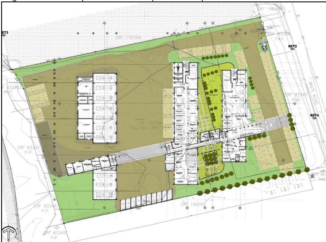
Figure 2: Design and layout of the electricity depot on Erf 155306, Retreat.