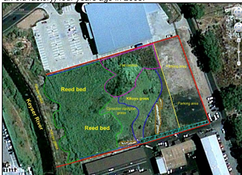
Figure 5: Aerial view of the site indicating the vegetation types on the Erf. The kikuyu grass along the Keyser River is public access lands.

Erf 155306 (Figure 2) is situated between the Keyser River (west) and White Road (east) in Retreat. White Road is an extension of Tokai Road which crosses Main Road, takes a sharp southerly bend and runs parallel to the railway line. There is retail development to the north (Tafelberg Furnishers) while the large, double story commercial building to the south belongs to the Engedi Christian Church. The church acquired this building (presumably an old factory) four years ago in 2005.