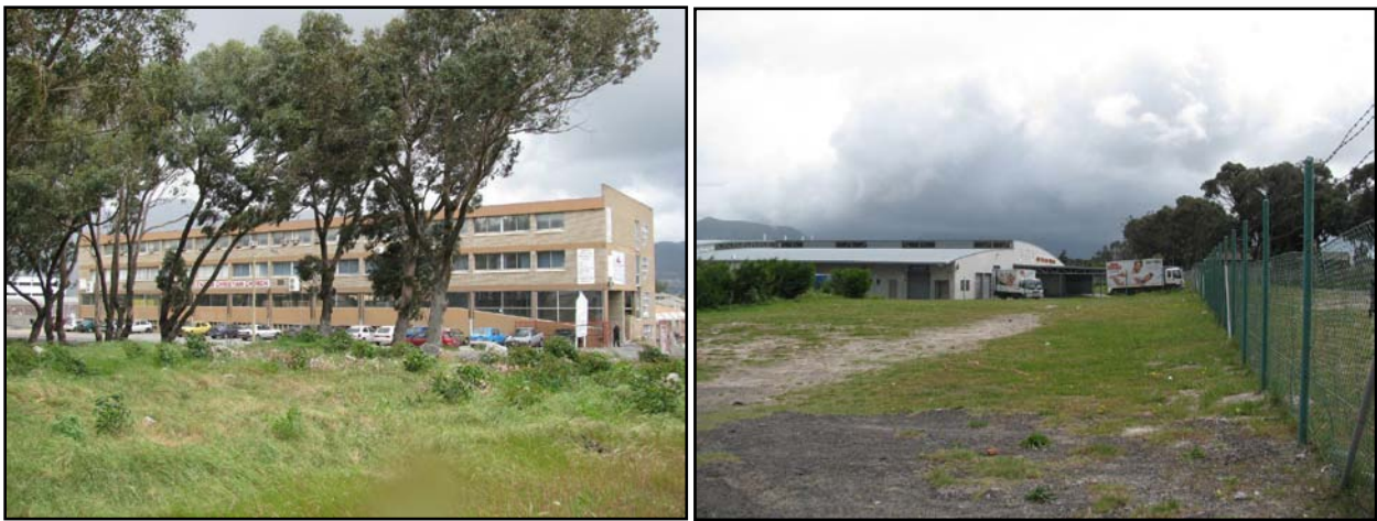
Plate 4: The Engedi Christian Church is located in a factory building to the south of the Erf. Plate 5: The retail store, Tafelberg Furnishers are located to the north of the Erf.