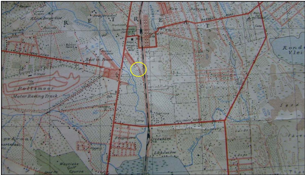
Figure 4: 1934 map of Tokai, in the Cape Peninsula. Scale 1:25 000. Commemorative reprint of the first map series issued by the Office of the Surveyor General.