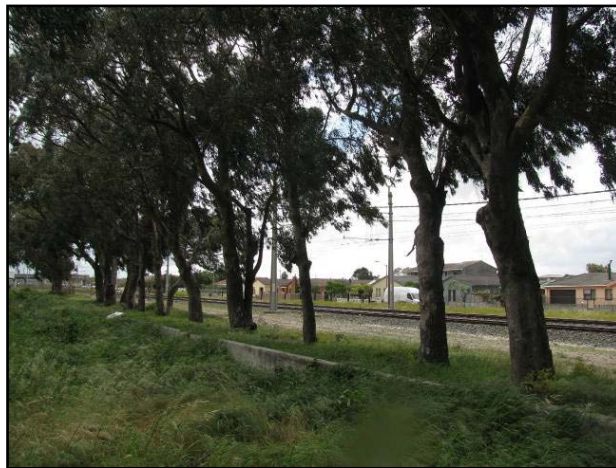
Plate 6: View of the vacant land, avenue of gum trees and the railway line to the east of the Erf, with the residential development of Square Hill (Retreat) in the background.