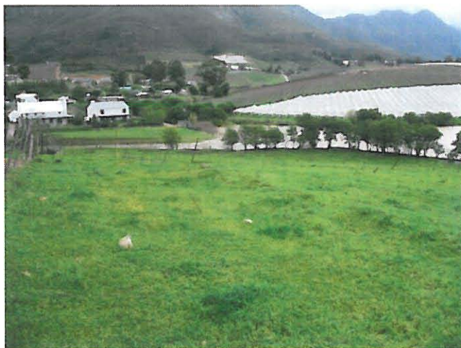
Figure 4. Erf 2021 view facing north west