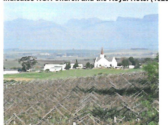
Figure 8. View of the property from the road into Riebeeck Kasteel