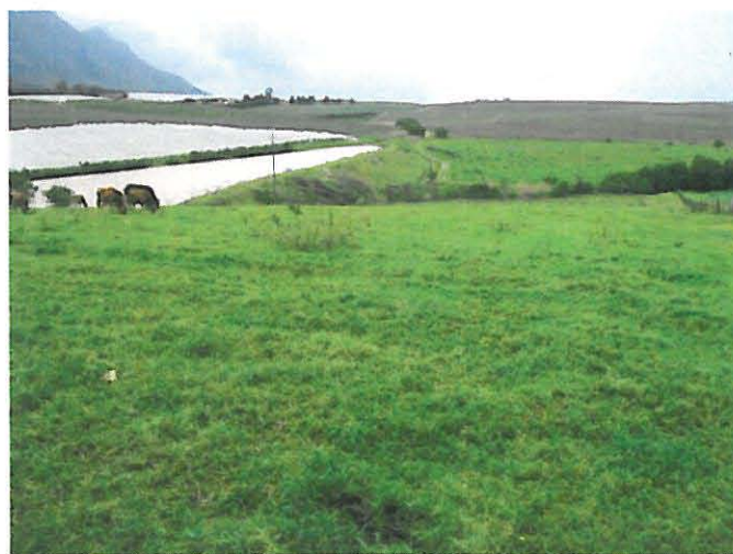
Figure 5. Erf 2021 view facing north east