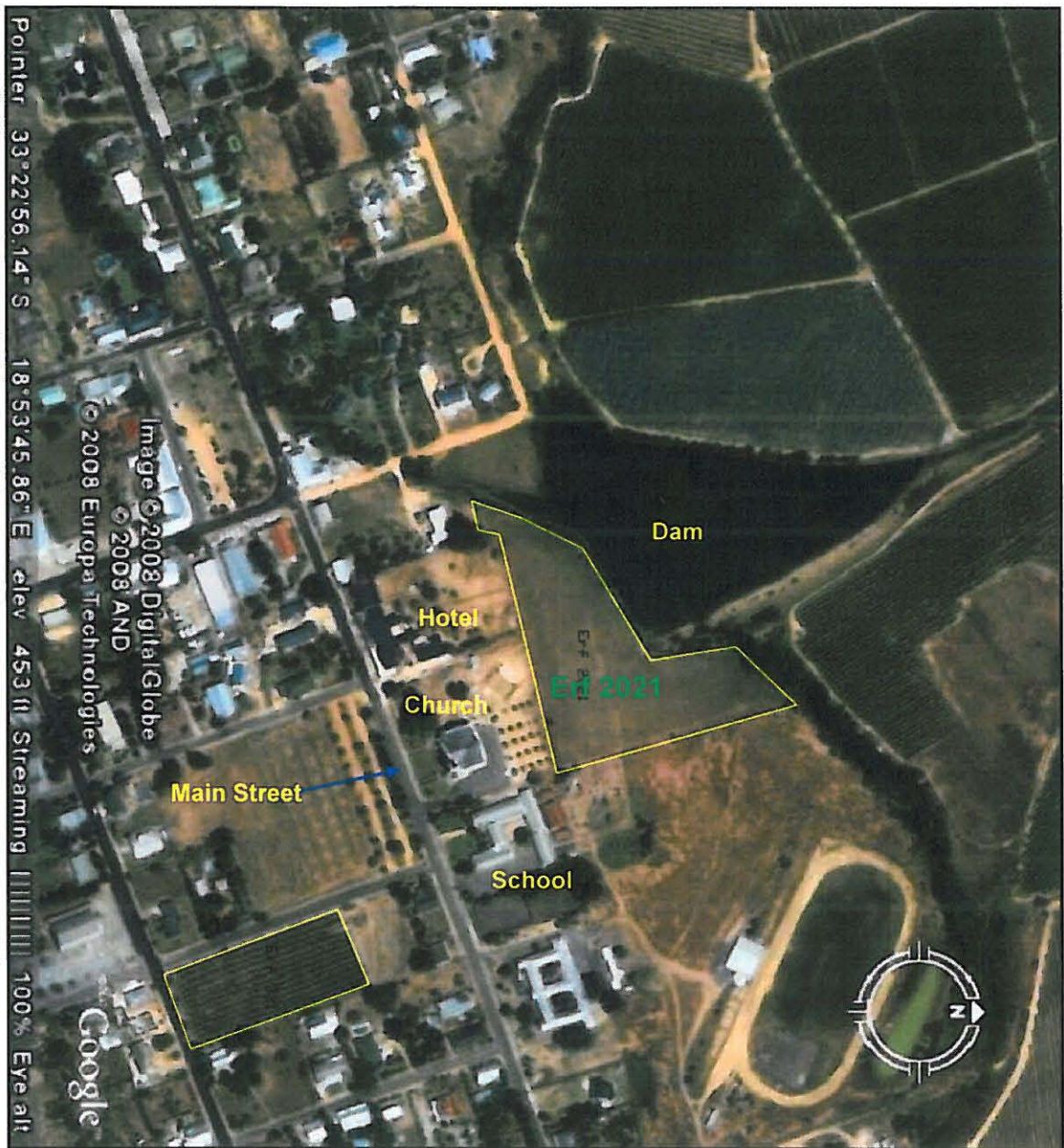
Figure 2. Aerial photograph of the study site