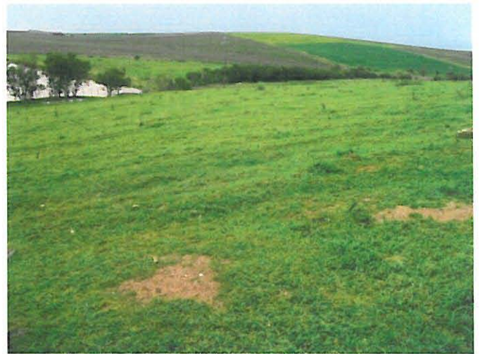
Figure 6. Erf 2021 view facing north east