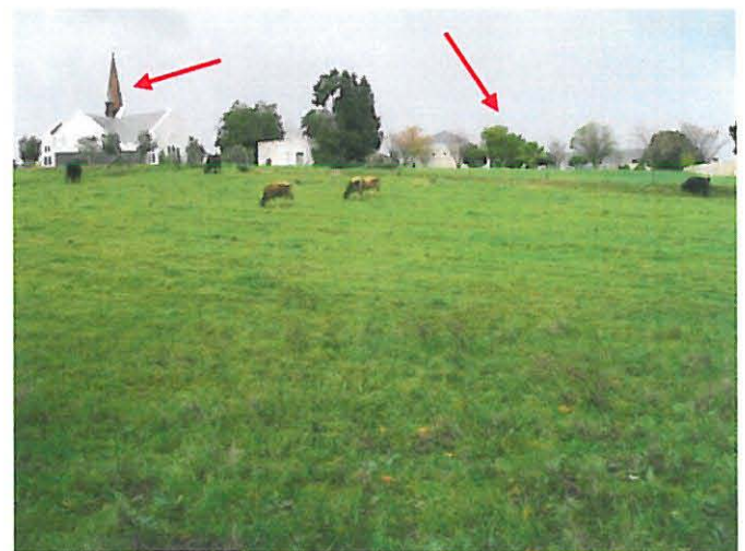
Figure 7. Erf 2021 view facing south. Arrows indicates NGK Church and the Royal Hotel (1929)