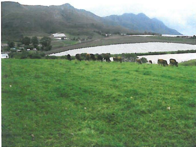
Figure 3. Erf 2021 view facing north west