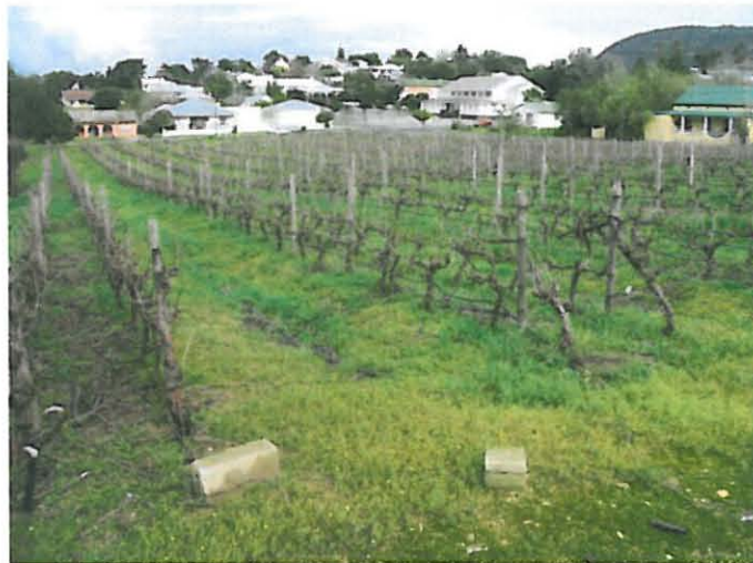
Figure 4. Erf 321. View of the site facing north