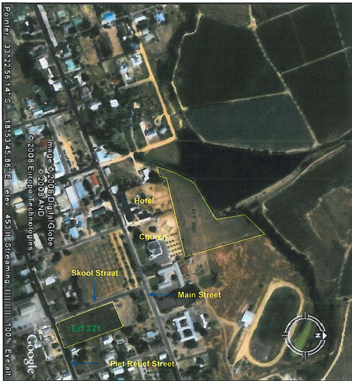
Figure 2. Aerial photograph of the study site.