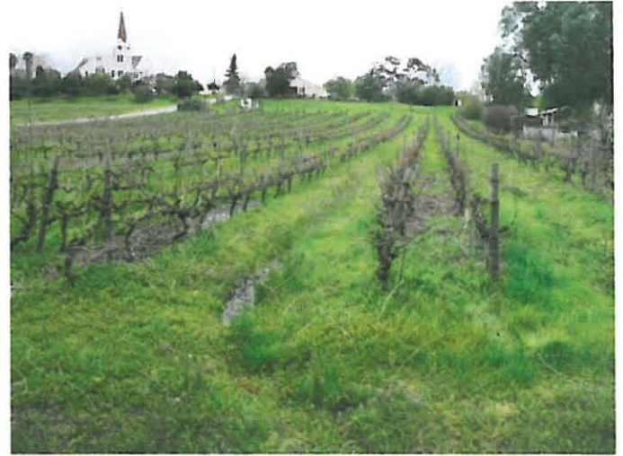
Figure 5. Erf 321. View of the site facing north west. The NGK church is in the background