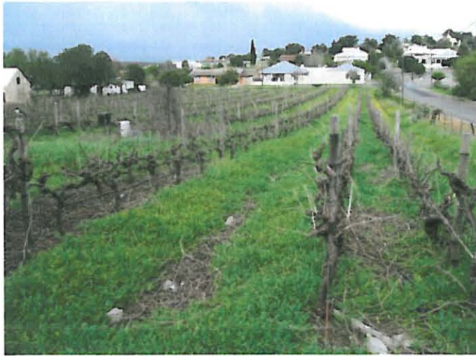
Figure 3. Erf 321. View of the site facing south