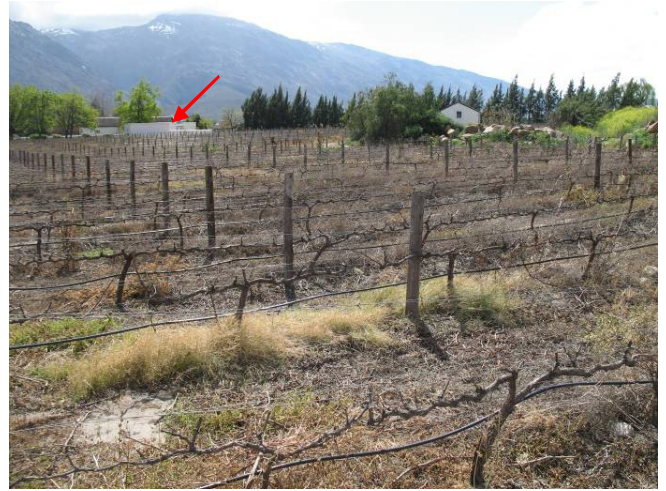
Figure 4. View of the site facing north west. Arrow indicates the historic farm homestead