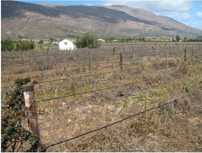
Figure 3. Block of vineyards closest to the farm homestead. View of the site facing south