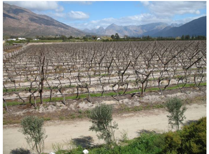
Figure 6. View of the site facing south west taken from the dam wall