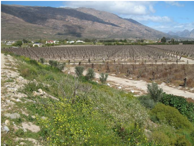
Figure 5. View of the site facing south taken from the dam wall