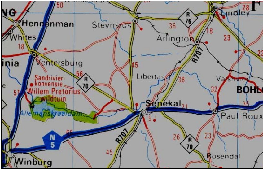
Map 1 Locality of Senekal and Libertas.