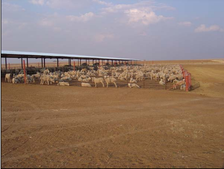
Fig.1 Existing feedlot at Elim 1053 Senekal.