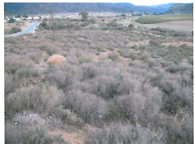
Figure 8. View of the site facing south east