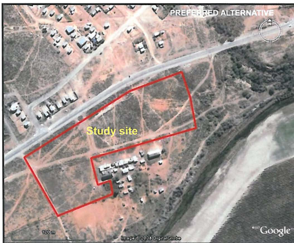
Figure 2. Aerial photograph of the study site