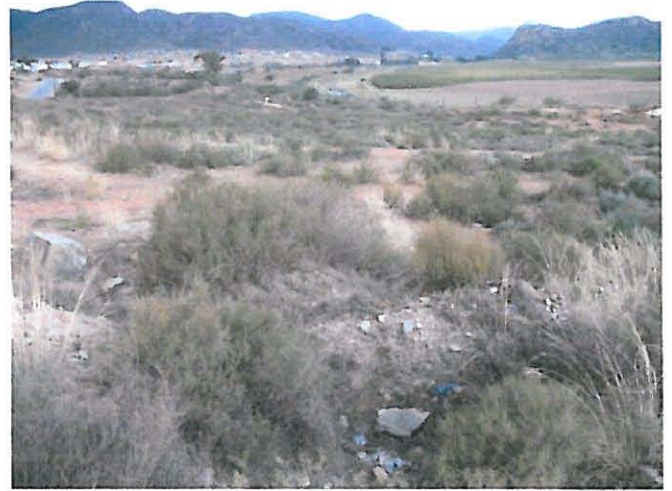
Figure 6. View of the site facing south east