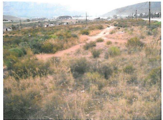
Figure 7. View of the site facing south west