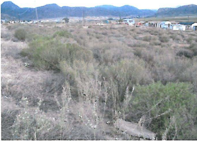
Figure 3. View of the site facing south east