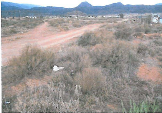
Figure 4. View of the site facing south