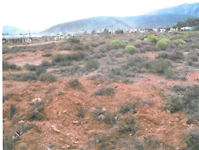
Figure 5. View of the site facing south west