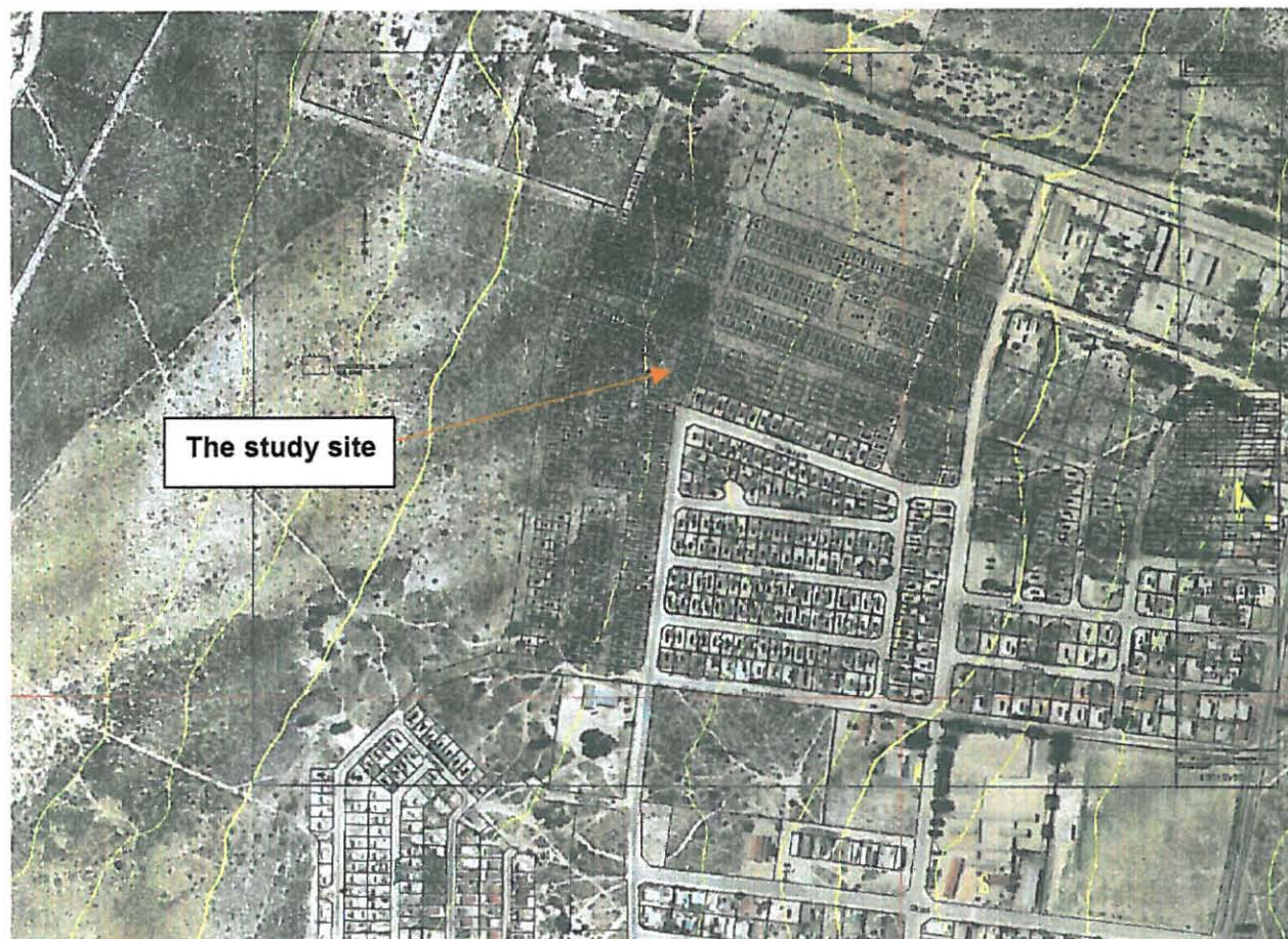
Figure 2. Aerial photograph of the site illustrating the proposed township layout