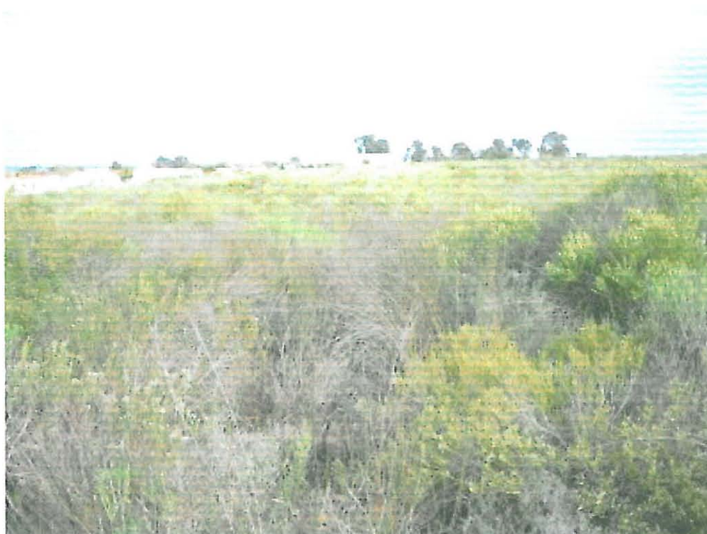
Figure 5. The site facing south alongside Duine Street.