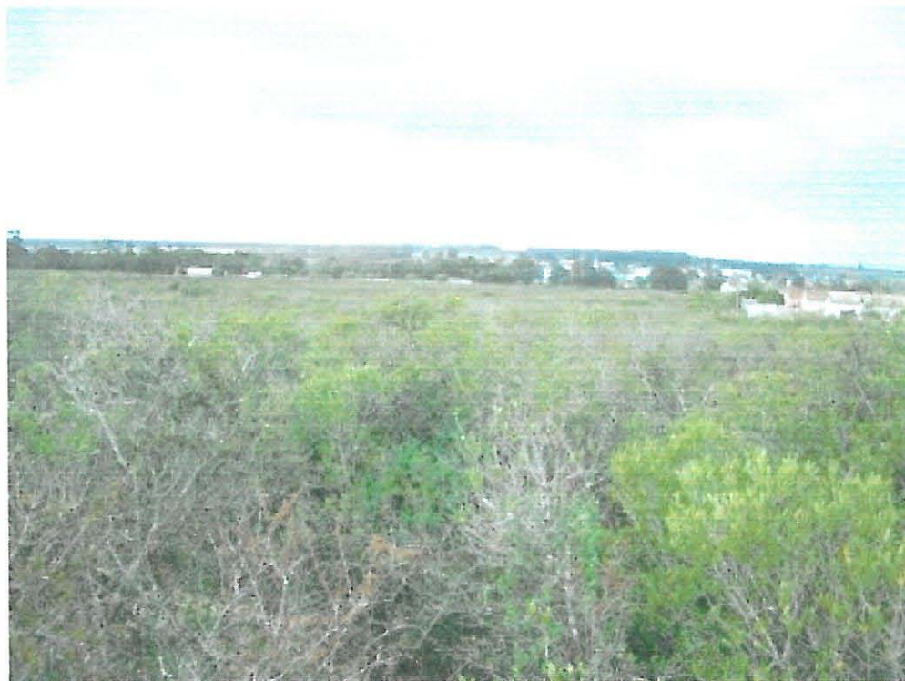
Figure 4. The site facing east.