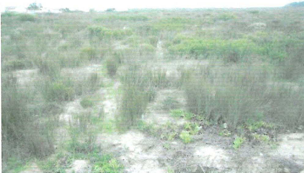
Figure 3. The site facing west