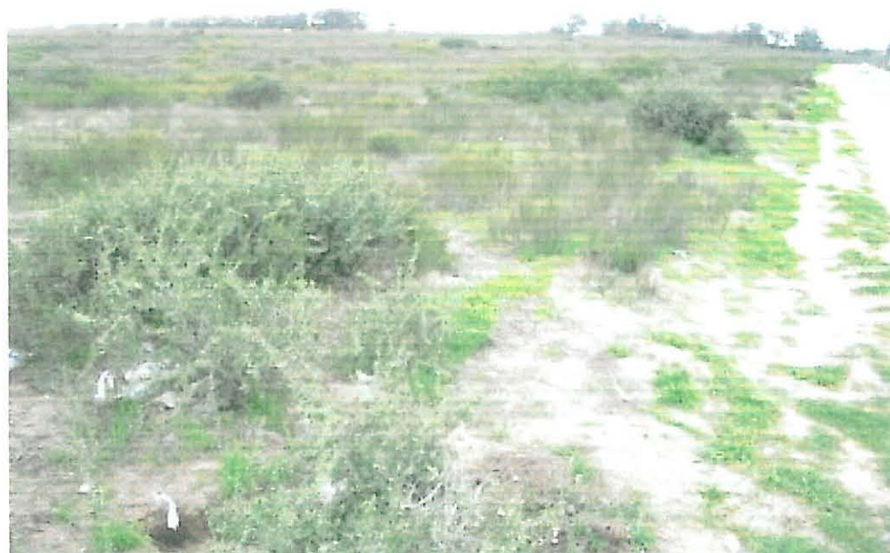
Figure 6. The site facing north alongside Duine Street.