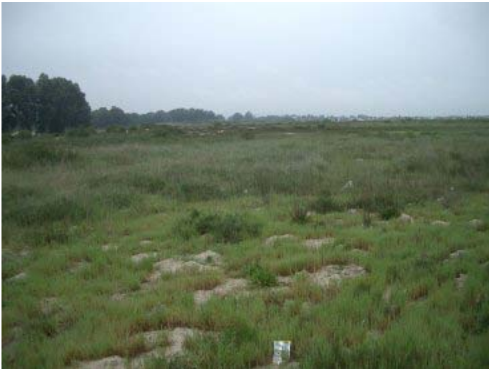
Figure 2. Erf 17975. The site facing south east