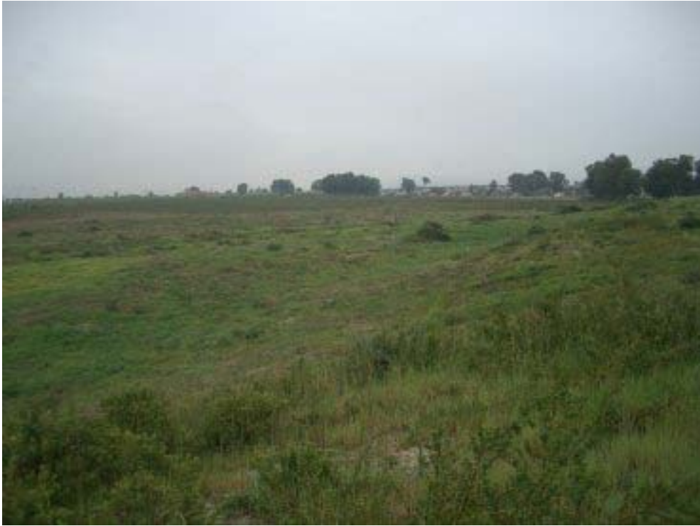
Figure 4. Erf 17975. The site facing north west. Note the remnant dunes to the right of the plate.