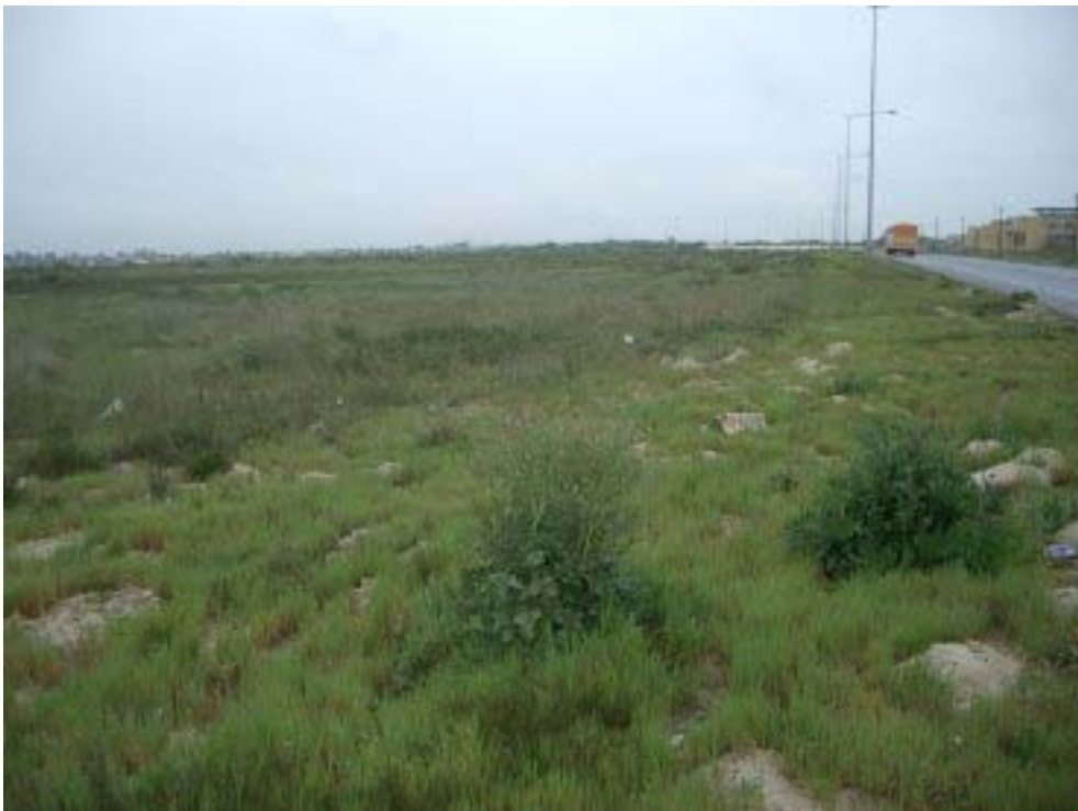
Figure 3. Erf 17975. The site facing south. Eersterivier Road is to the right of the plate.