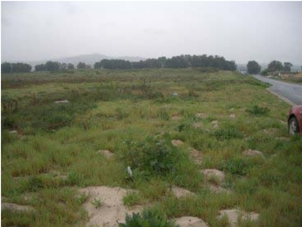
Figure 5. Erf 17975. View of the site facing east. Albert Philander Road is to the right of the plate.