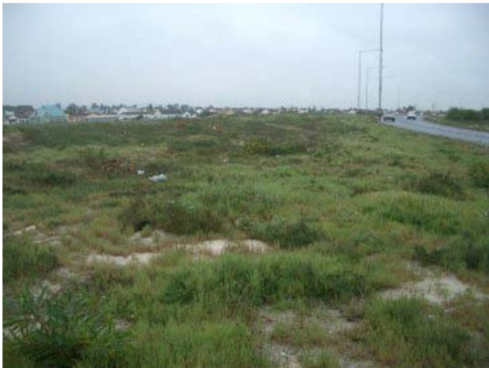
Figure 7. Erf 17974. View of the site facing south. Eersterivier Road is to the right of the plate.