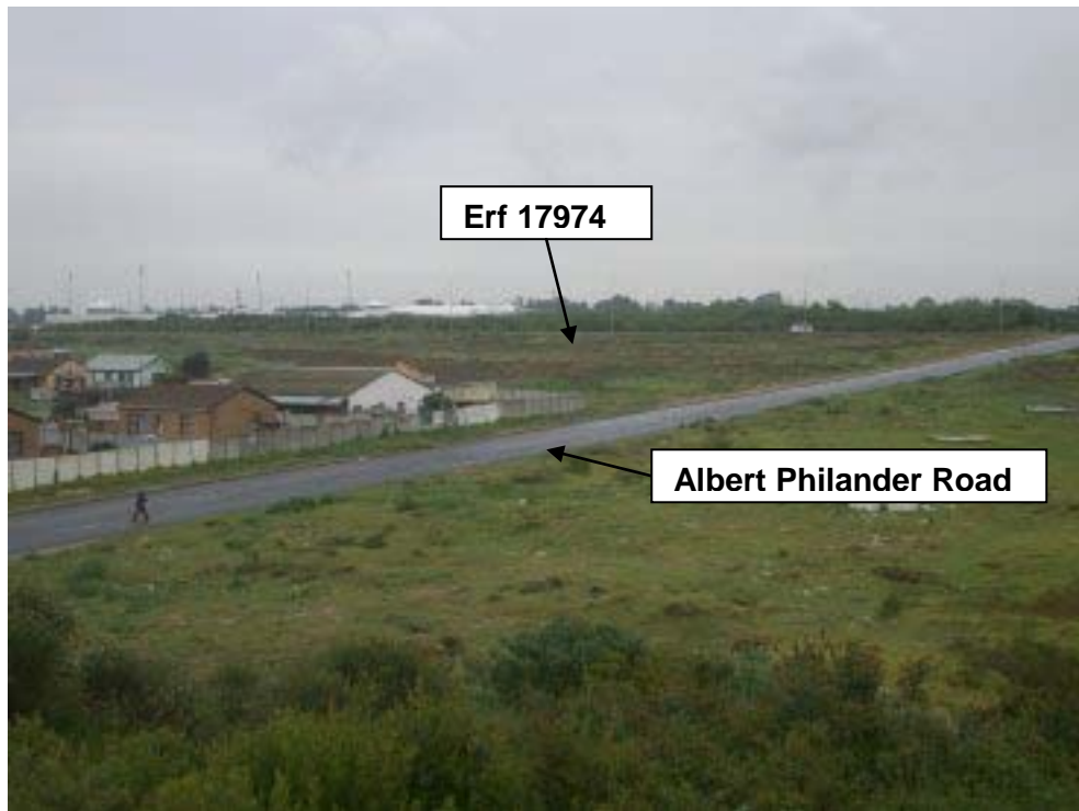
Figure 6. View of Erf 17974 taken from Erf 17975. The Conifers housing development is in foreground of the plate.