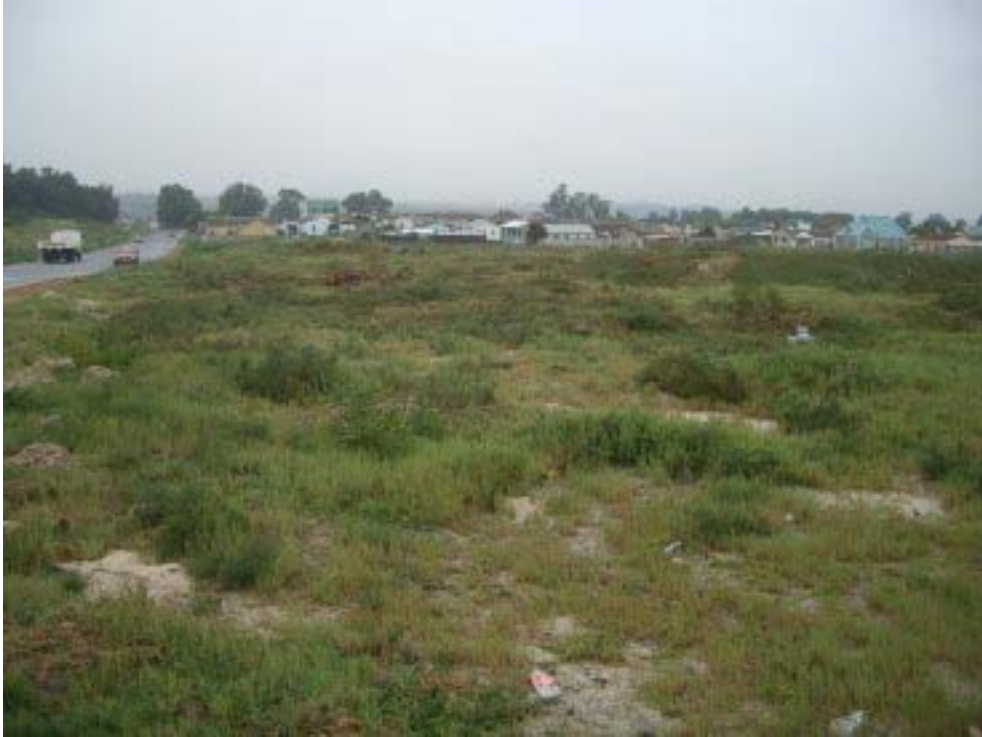
Figure 8. Erf 17974. View of the site facing east. The Conifers housing estate is in the background.