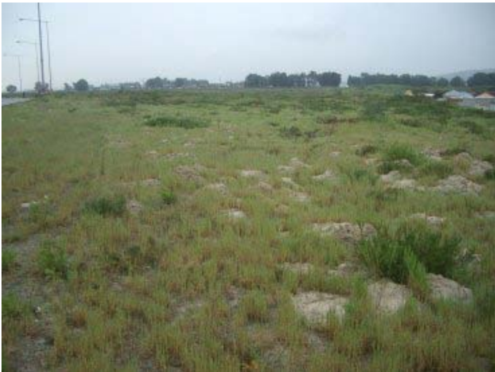
Figure 9. Erf 17974. View of the site facing north.