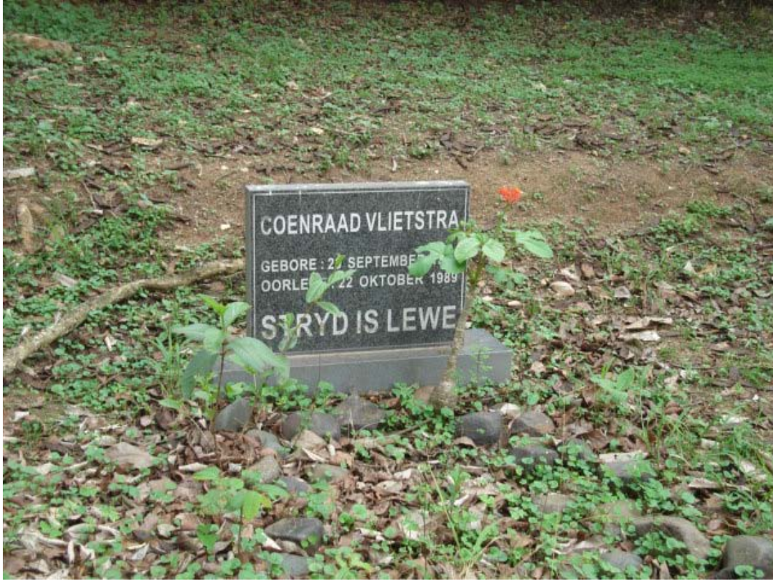
The tombstone of Coenraad Vlietsta