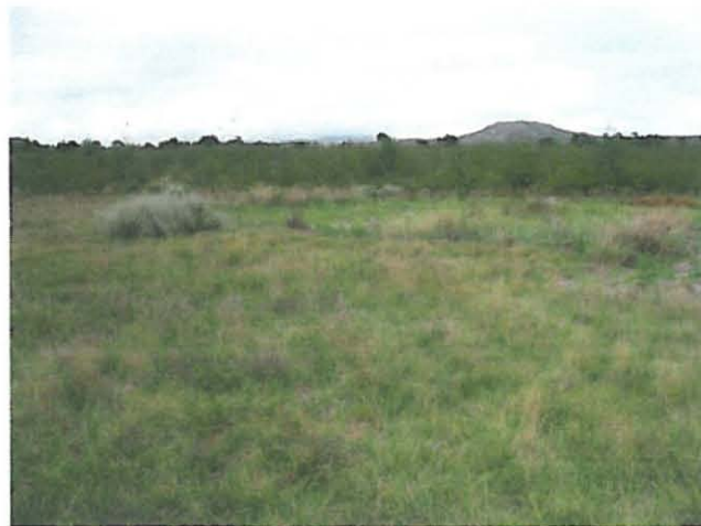
Figure 5. View of the site facing south east