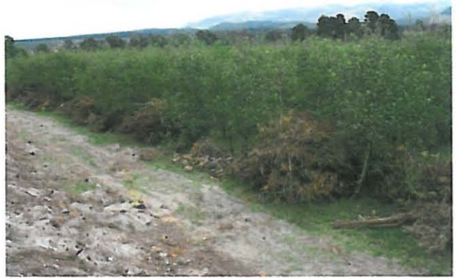
Figure 6. View of the site facing south west