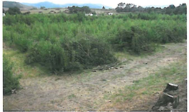
Figure 7. View of the site facing north west