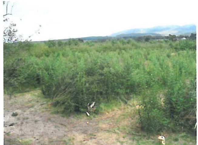
Figure 8. view of the site facing south west