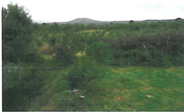
Figure 4. View of the site facing south east