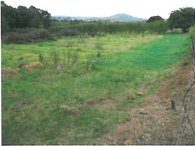
Figure 3. View of the site facing south